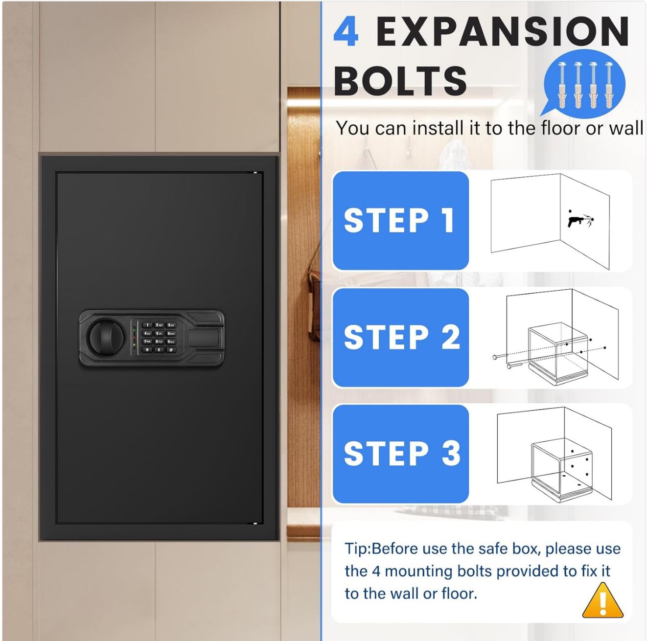
Image: Visual guide for securely mounting the safe to a wall or floor using expansion bolts.

Video: A demonstration of how to fix the safe to a wall or floor to enhance its anti-theft performance.