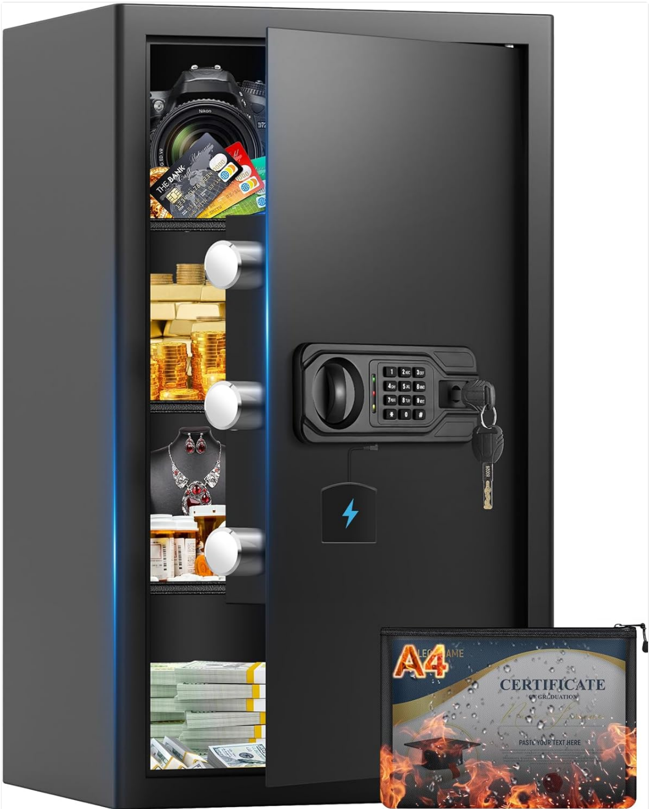
Image: The Thmosz 5.5 Cuft Large Fireproof Safe, showcasing its spacious interior and digital keypad.