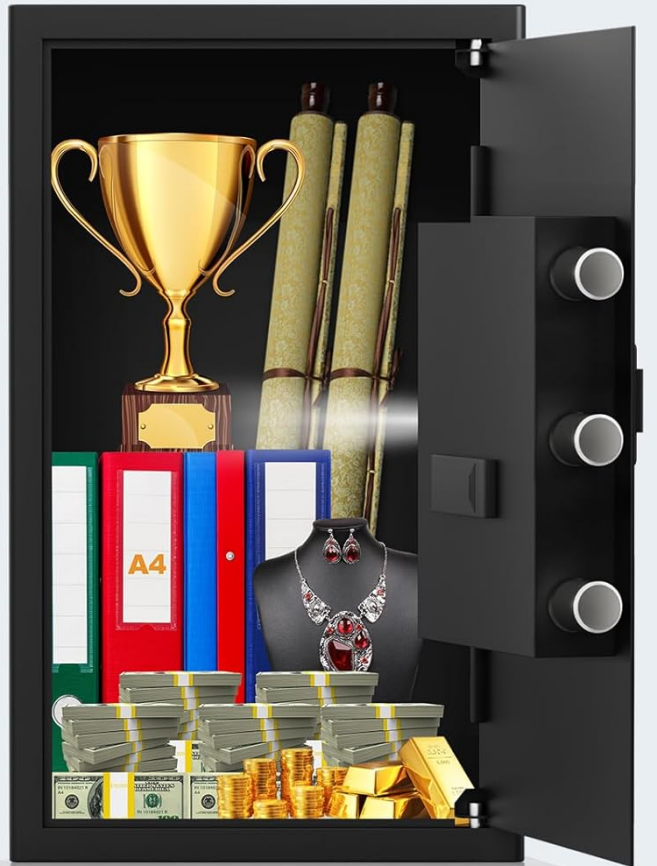
Image: The safe's interior, demonstrating the flexibility of its removable shelves for various items.