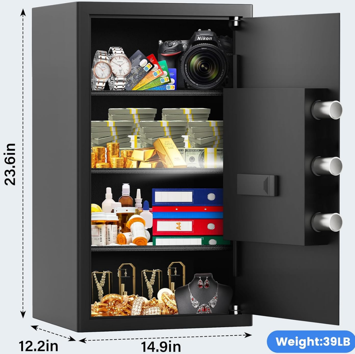
Image: Detailed dimensions of the safe, highlighting its large capacity.