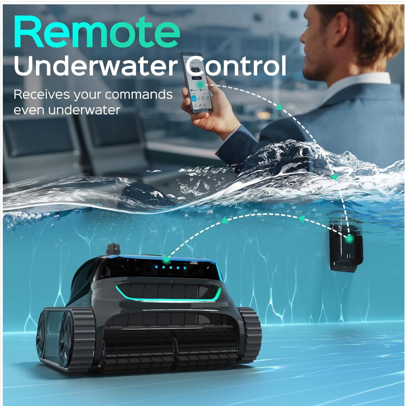
Figure 5: The WYBOT app provides full remote control capabilities, allowing users to start, stop, direct, and schedule cleaning cycles from anywhere.