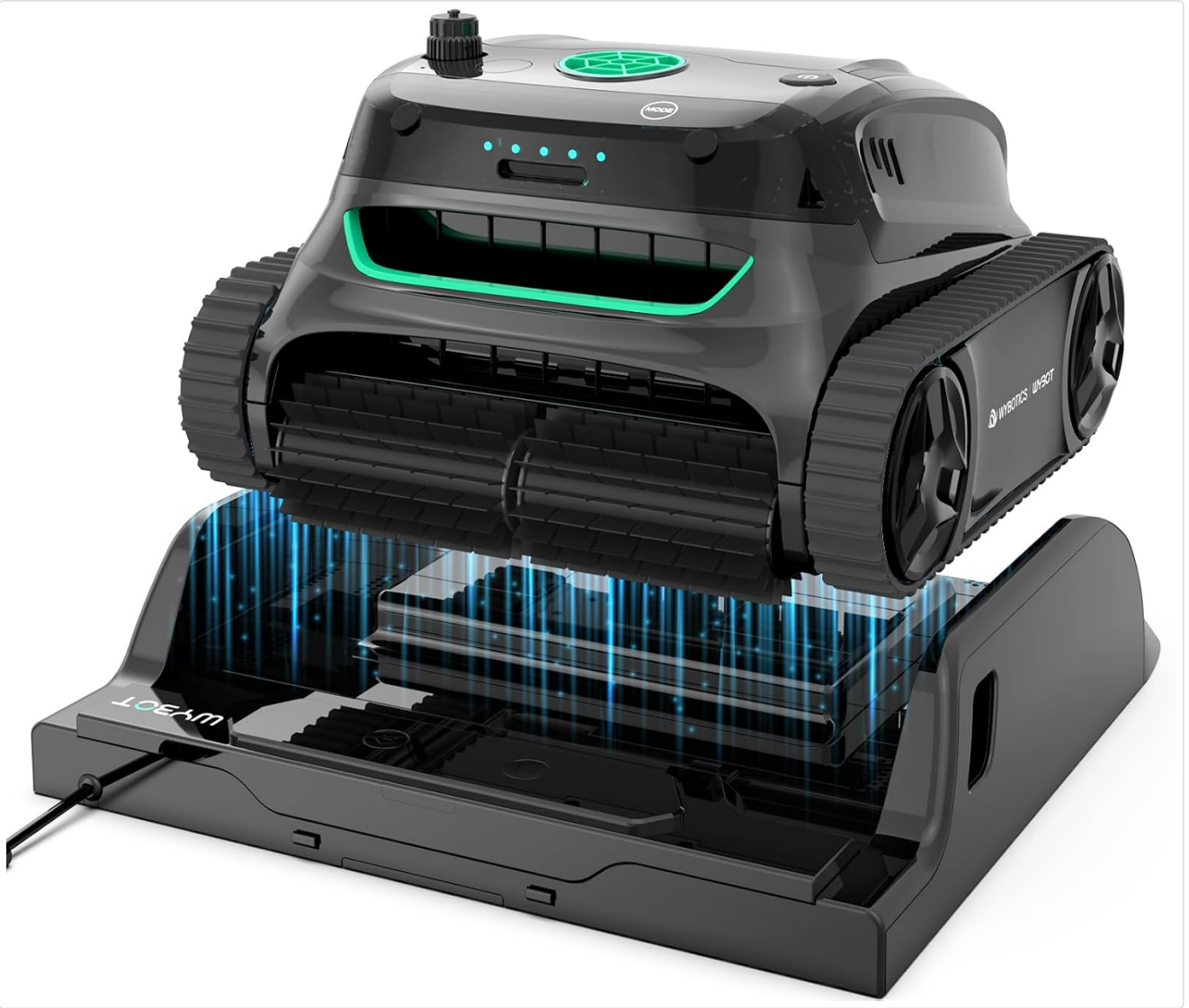
Figure 1: The WYBOT S2 Pro robotic pool cleaner, designed for efficient and autonomous pool maintenance, shown with its innovative wireless charging dock.