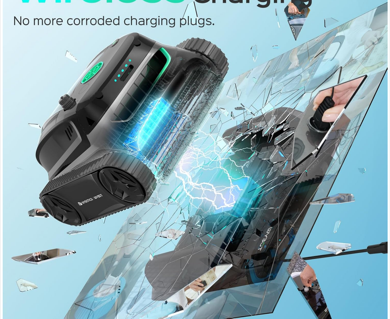
Figure 4: The advanced underwater wireless charging system ensures a secure and corrosion-free power connection, enhancing durability and user convenience.