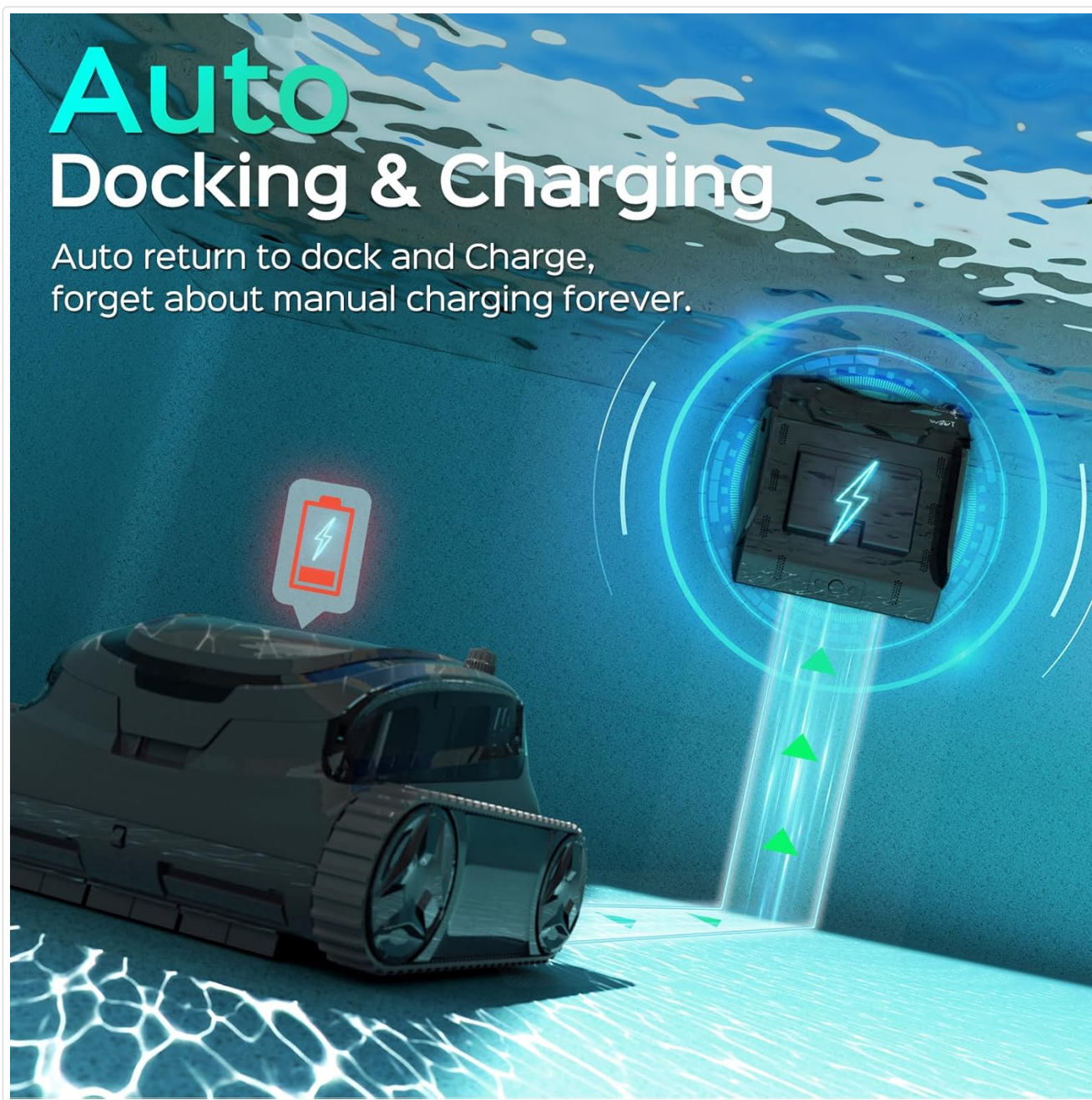
Figure 3: The S2 Pro features automatic docking and wireless charging. When battery levels are low, the cleaner autonomously navigates back to its dock for recharging, eliminating manual retrieval for charging.

Before first use, fully charge the S2 Pro. Place the cleaner onto its wireless charging dock. Ensure the dock is connected to the power adapter and a power outlet. The indicator lights on the cleaner will show charging status. A full charge typically takes approximately 3 hours.