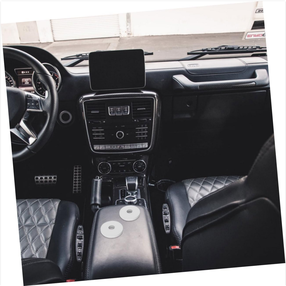
Image 2.1: Example placement of aroma pads on a car console. This image shows two white aroma pads resting on the central console of a modern car, demonstrating potential locations for a car diffuser or direct pad placement.