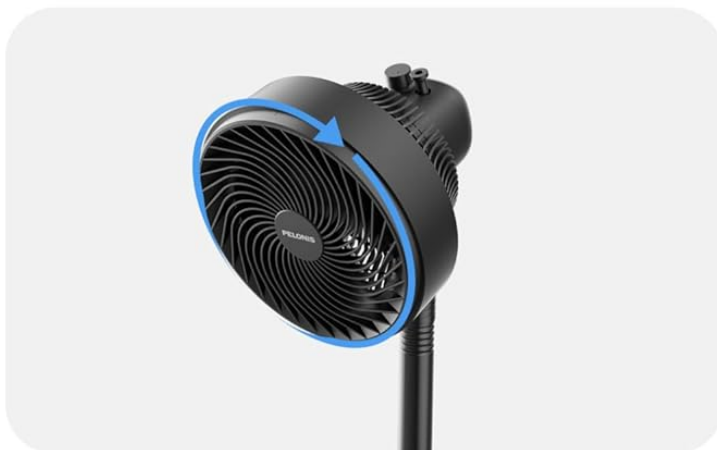
Image: Step 3 of assembly, demonstrating the alignment of the fan grilles.

Align the front grille snaps with the top line of the rear grille.