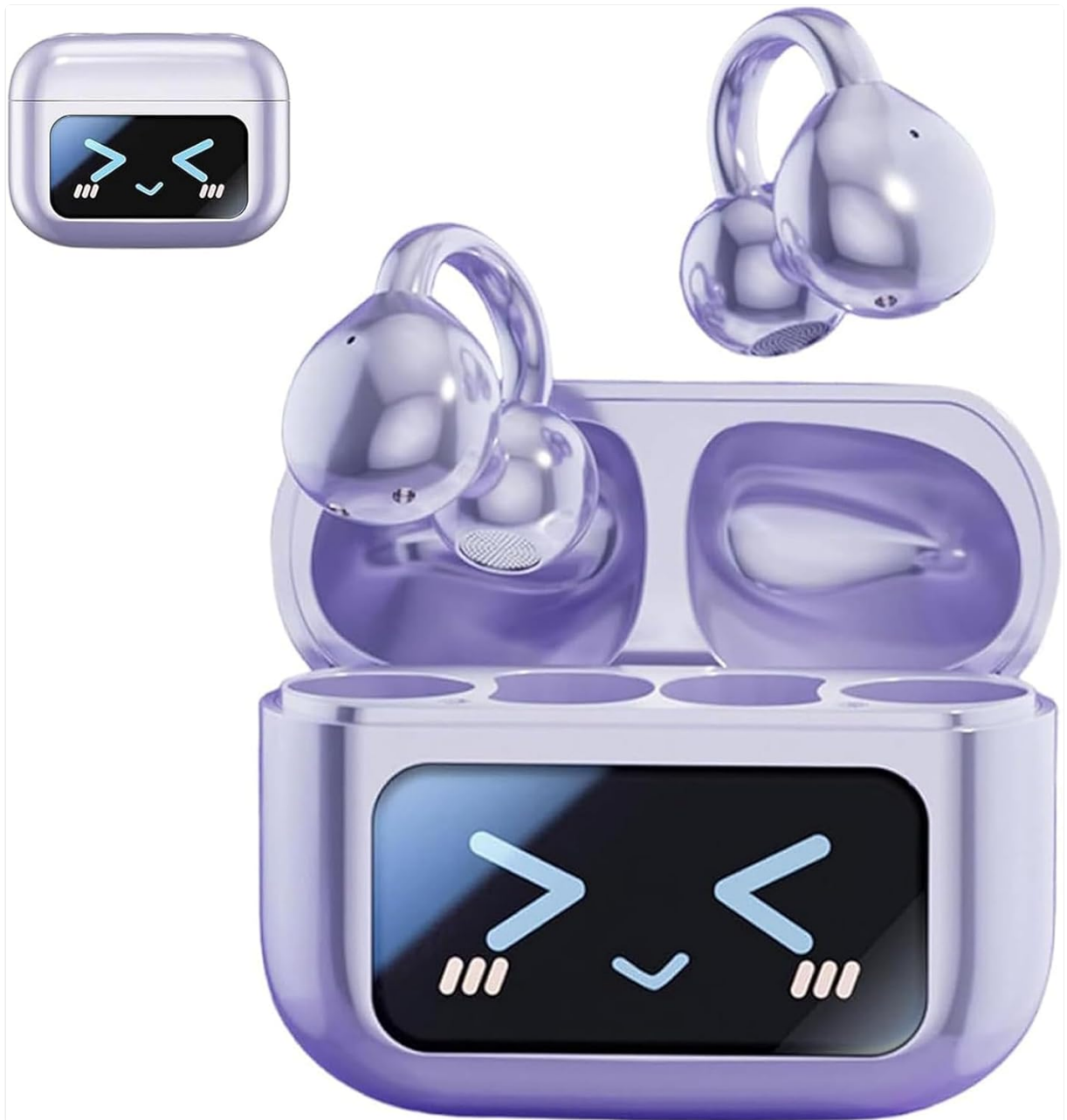
Figure 1: Generic M100 Clip-On Wireless Ear Headphones and Charging Case. The earbuds are shown nestled in their purple charging case, which features a front-facing smart LED touch screen.