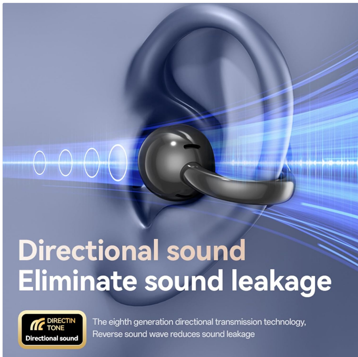
Figure 4: Directional sound technology. This graphic illustrates how the earbuds deliver sound directly to the ear canal while minimizing sound leakage, enhancing privacy and audio quality.