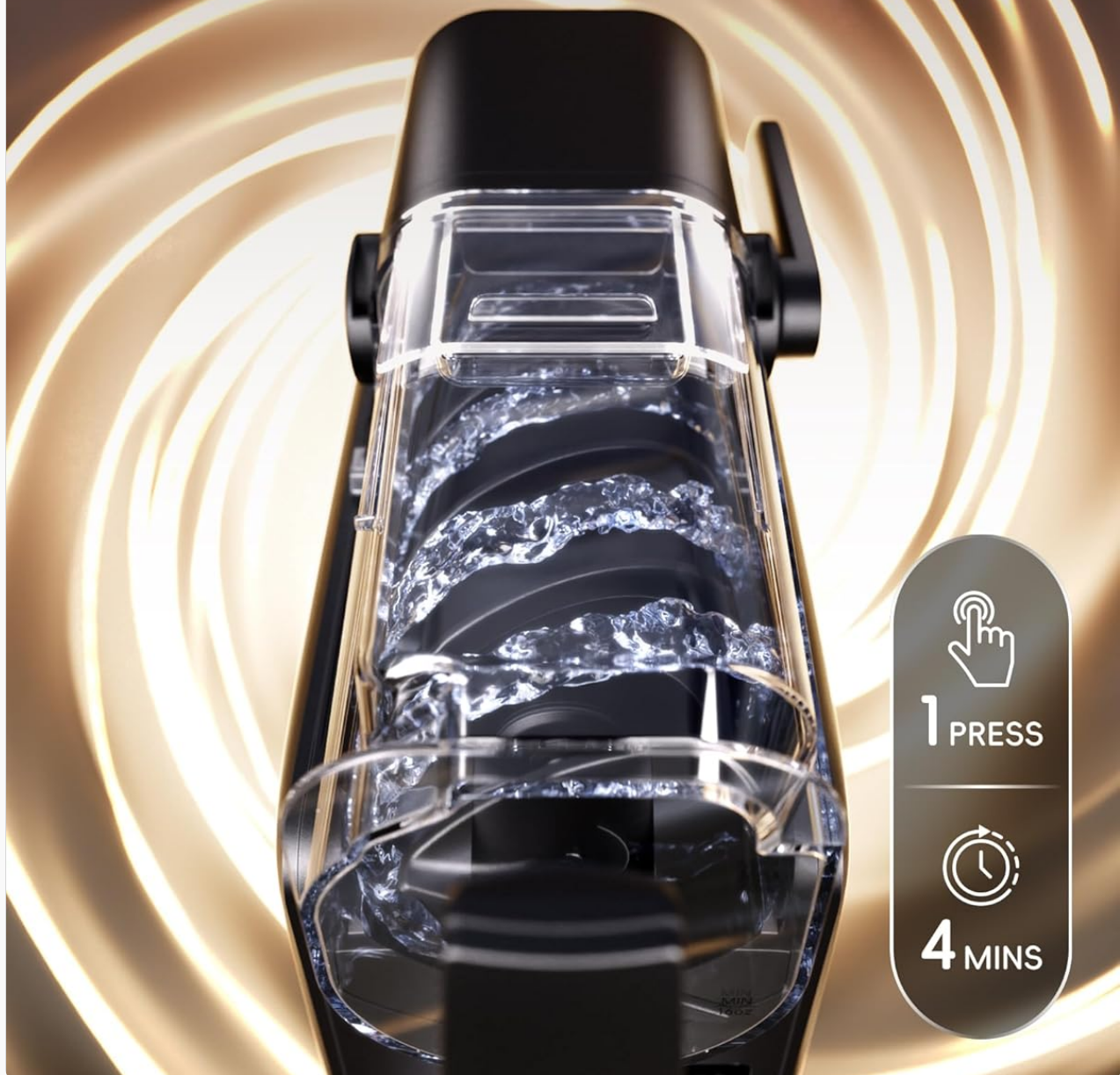
Figure 6.1: The 'Effortless Clean' feature, which can be activated with one press and completes in approximately 4 minutes.