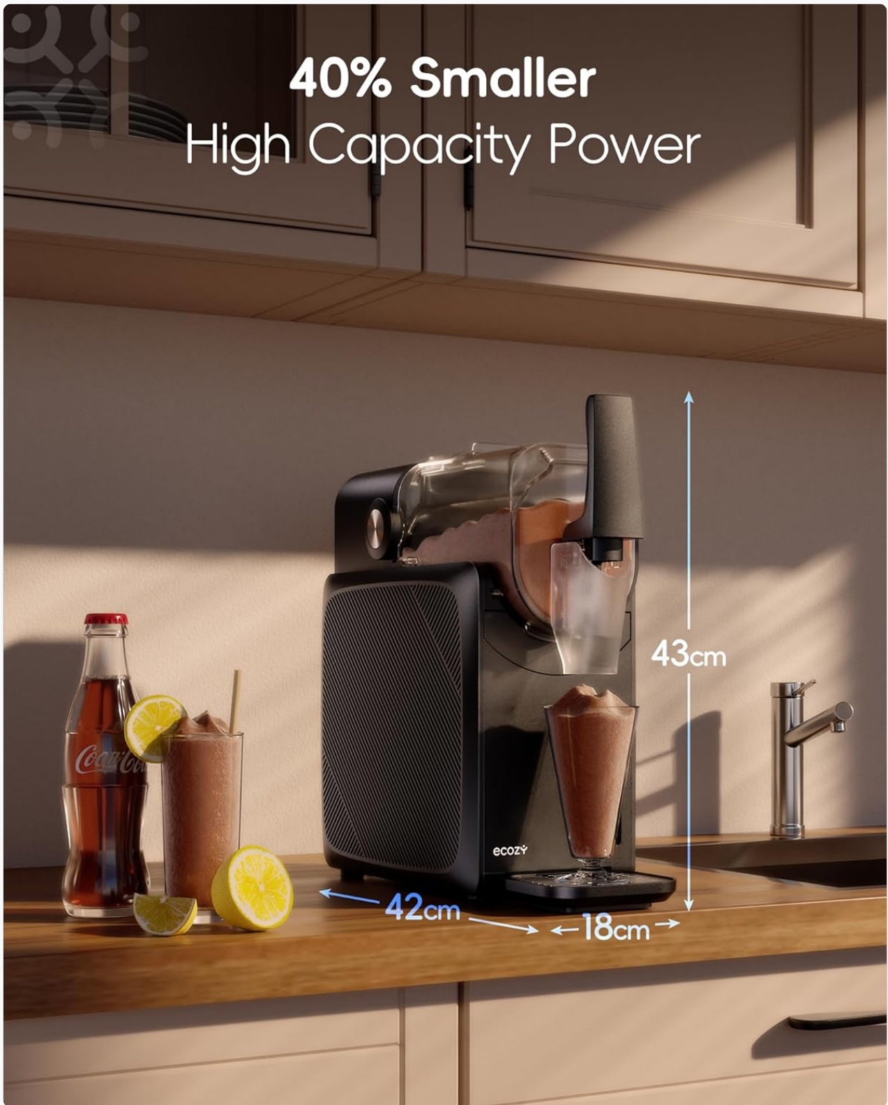
Figure 8.1: The compact dimensions of the ecozy Slushie Machine, measuring approximately 42cm in width, 43cm in height, and 18cm in depth.