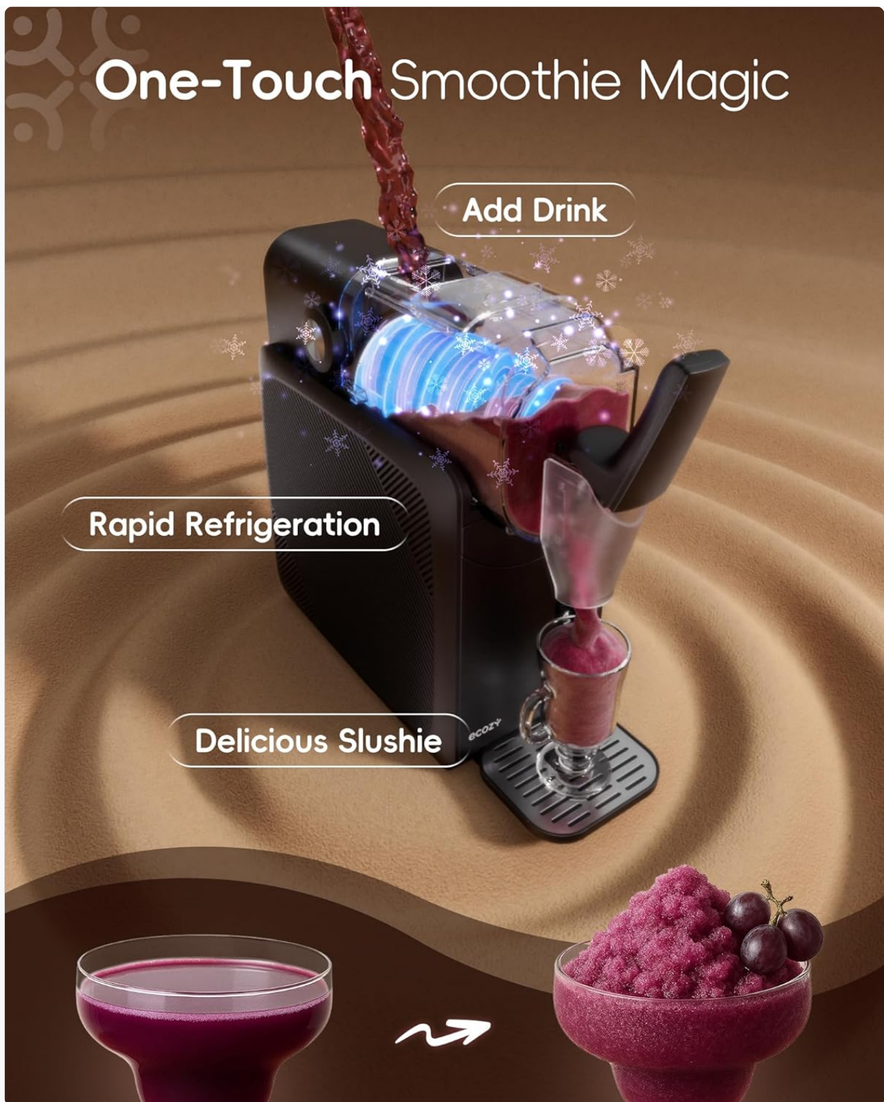
Figure 5.2: The 'One-Touch Smoothie Magic' process, illustrating the addition of liquid, rapid refrigeration, and the creation of a delicious slushie.