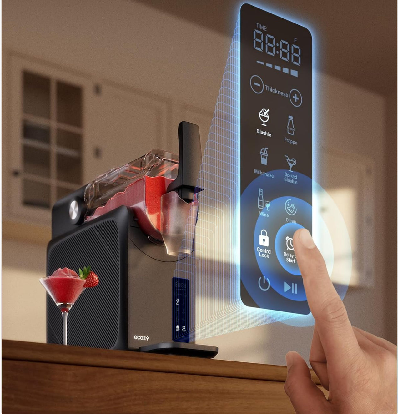
Figure 3.1: The intuitive touch screen control panel, displaying various function icons and time settings.