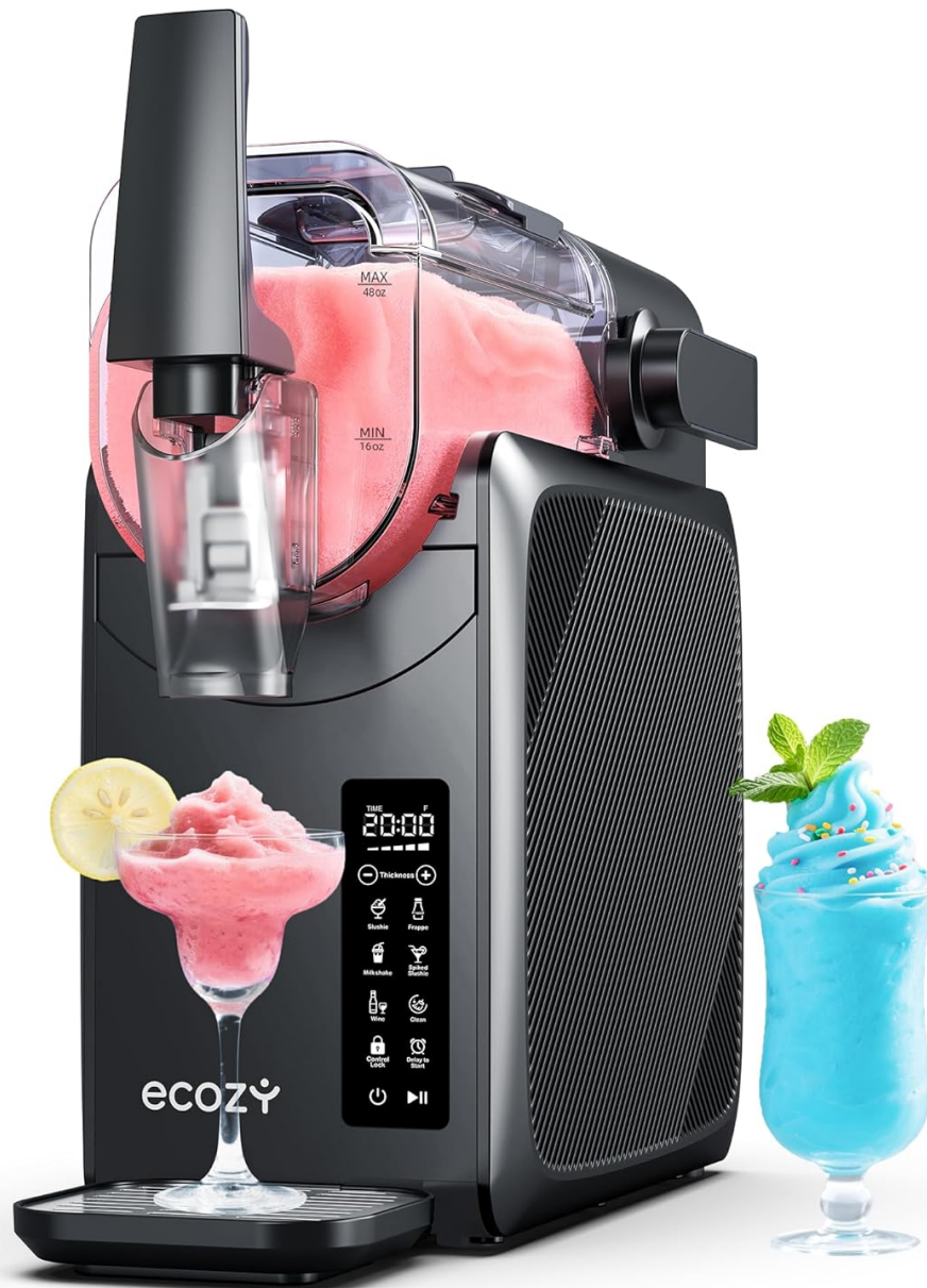
Figure 1.1: The ecozy SM-FS201C Slushie Machine, showcasing its sleek design and two example frozen beverages.