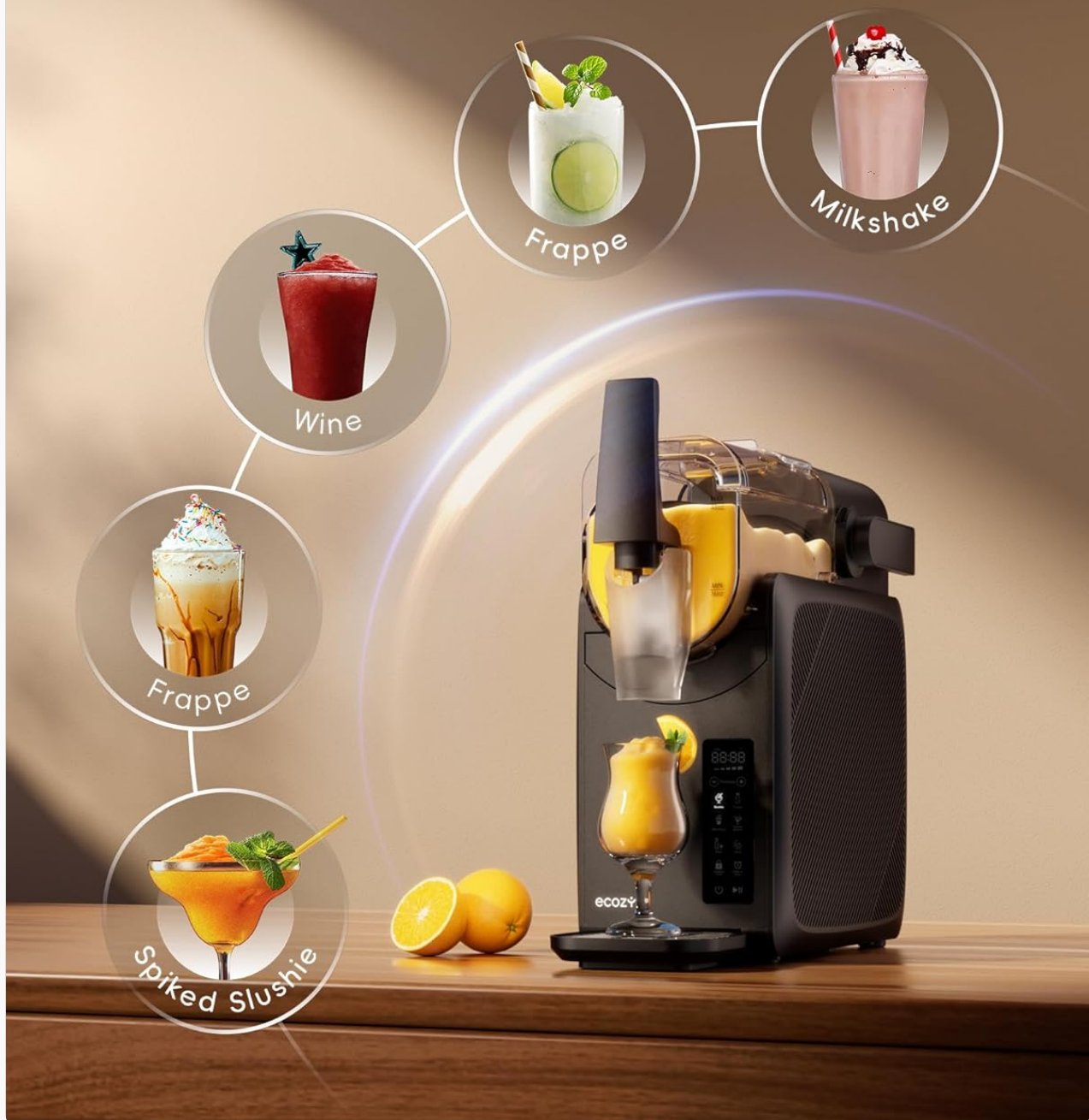
Figure 5.1: Examples of beverages that can be prepared, including Frappe, Milkshake, Wine, and Spiked Slushie.