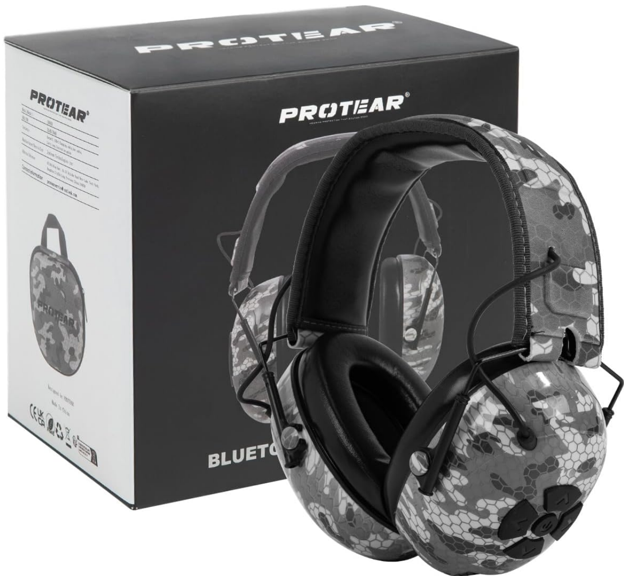
Image 3.1: The PROTEAR Bluetooth Earmuffs shown with their included portable waterproof hard case.