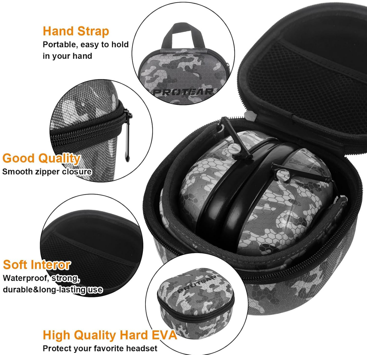
Image 7.1: The PROTEAR earmuffs neatly folded and stored within their durable, waterproof hard case, highlighting the hand strap, smooth zipper, and soft interior for protection.

When not in use, store the earmuffs in their portable waterproof hard case to protect them from dust, moisture, and physical damage.