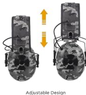
Image 5.2: A diagram illustrating the adjustable design of the earmuff headband.