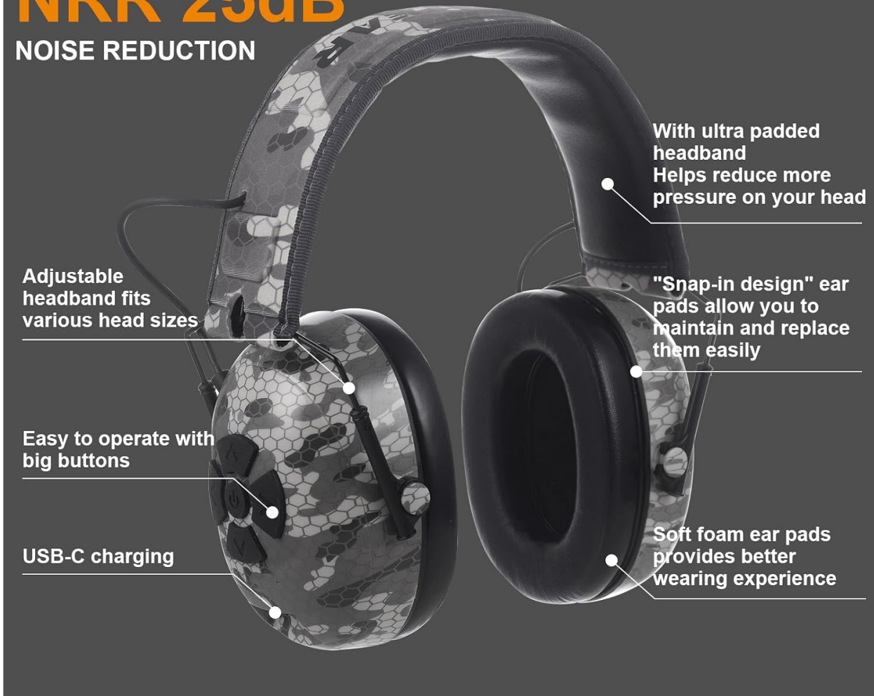
Image 4.1: Detailed view of the earmuffs highlighting features such as the NRR 25dB rating, ultra-padded headband, adjustable design, large control buttons, USB-C charging port, snap-in ear pads, and soft foam ear pads.