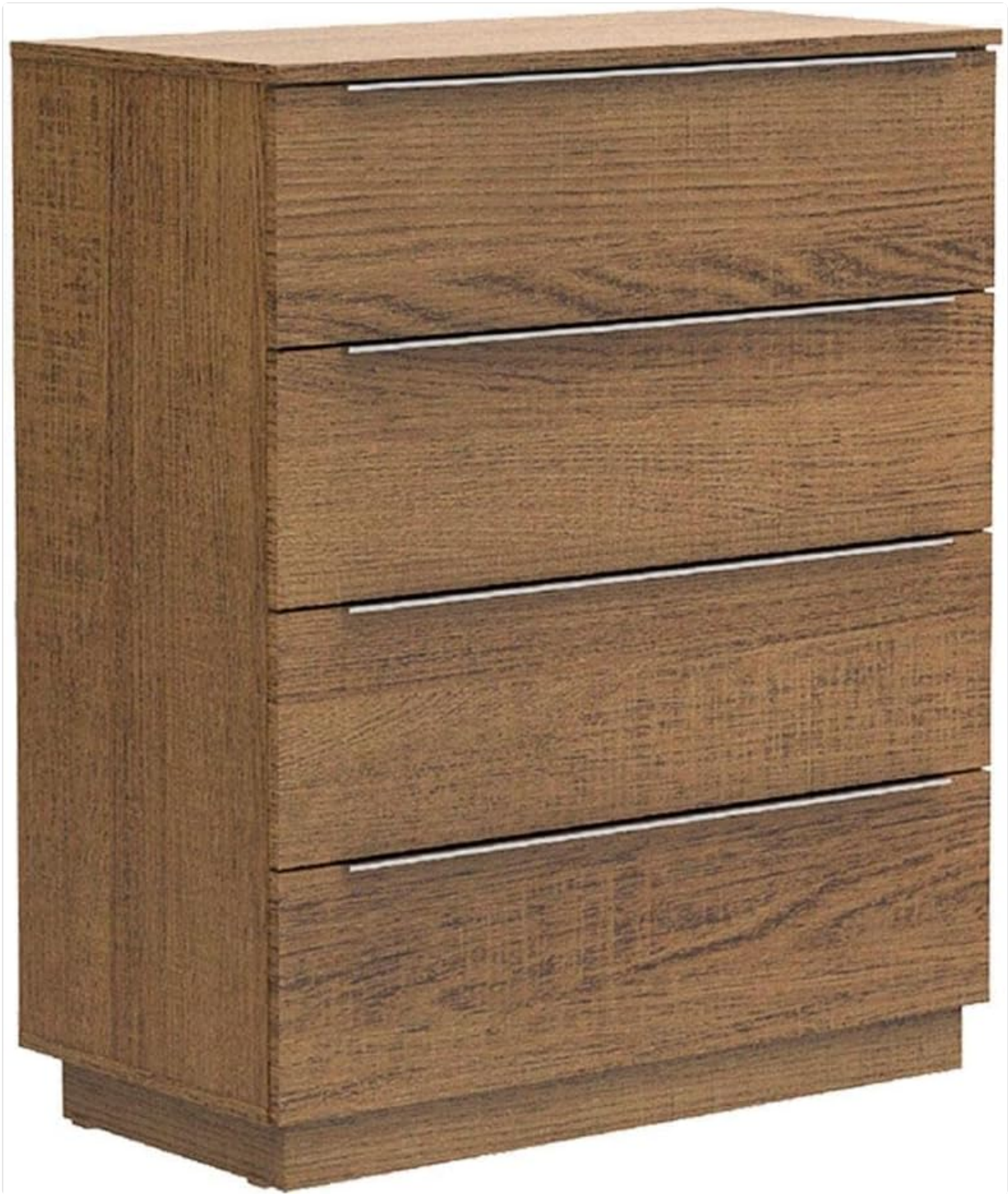
Image 1.1: The Madesa 4-Drawer Chest in a typical bedroom environment.