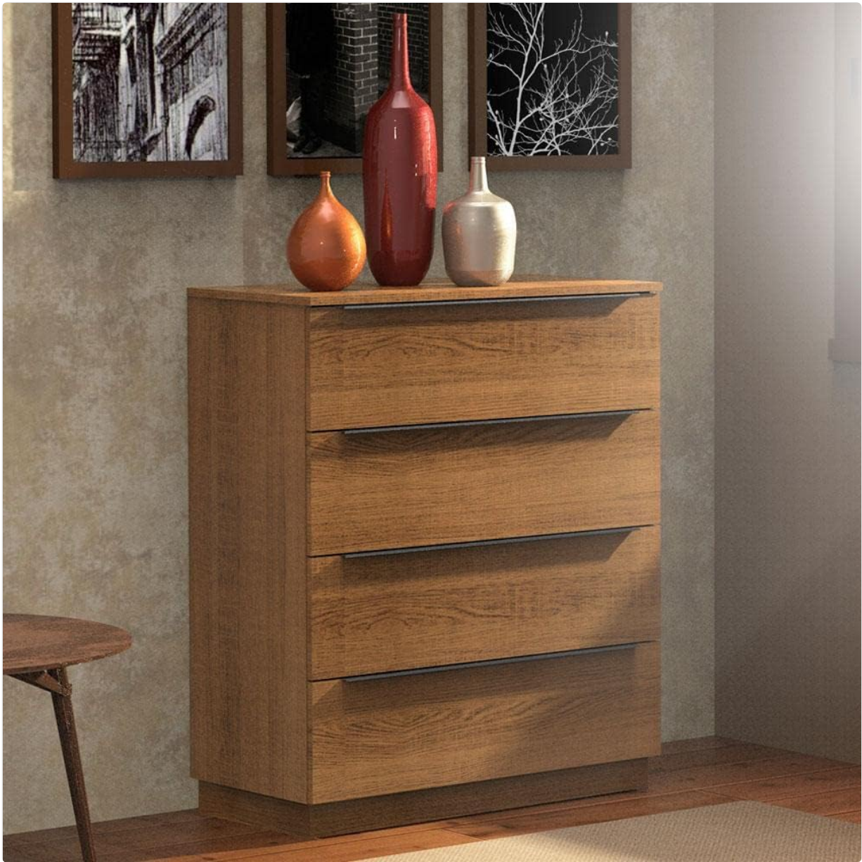
Image 4.1: Product dimensions: 95 cm (height), 80 cm (width), 40 cm (depth).