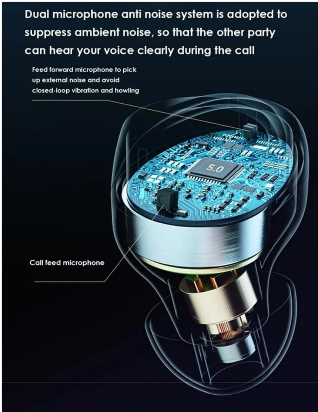
Image: An internal view of the earbud, highlighting the dual microphone anti-noise system designed to suppress ambient noise for clearer calls.