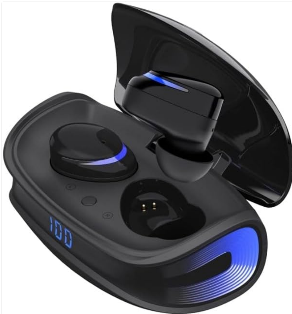
Image: TWS Earbuds in their charging case, showing the LED display and sleek black design.

This manual provides detailed instructions for the operation and maintenance of your TWS Earbuds. Please read this manual carefully before use to ensure proper function and longevity of your device.