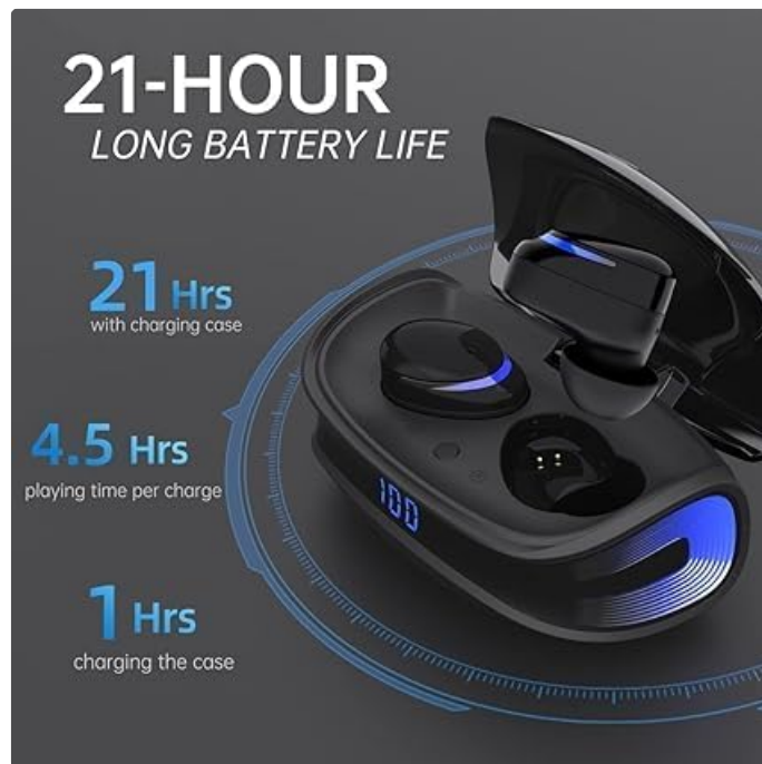
Image: Infographic detailing the battery life of the TWS Earbuds, including playtime per charge and total playtime with the charging case.