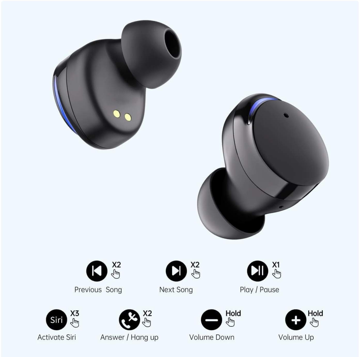
Image: Detailed diagram illustrating the various touch control gestures for music playback, call management, and voice assistant activation on the earbuds.