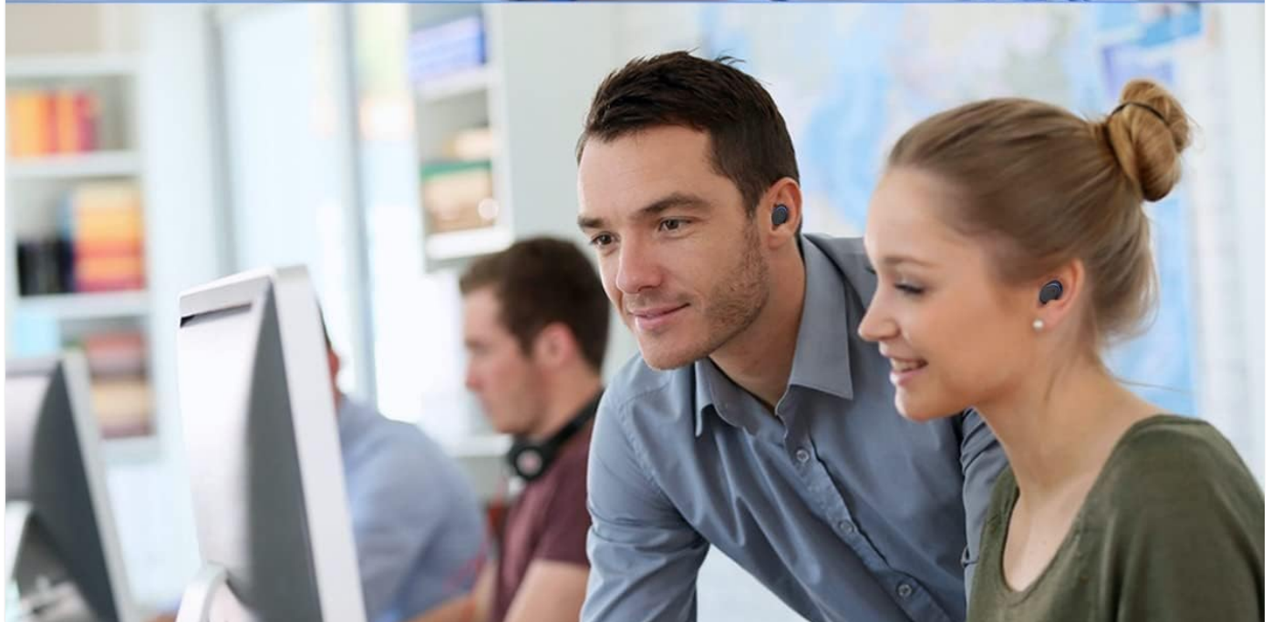
Image: Examples of individuals wearing the TWS Earbuds comfortably in various settings, highlighting their ergonomic design.