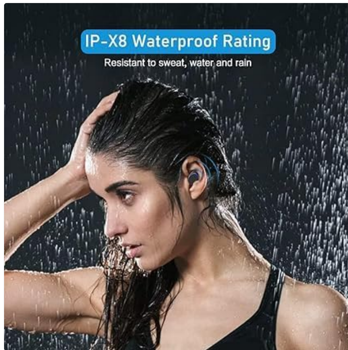
Image: A woman in the rain, illustrating the IPX8 waterproof capability of the earbuds, indicating resistance to sweat, water, and rain.