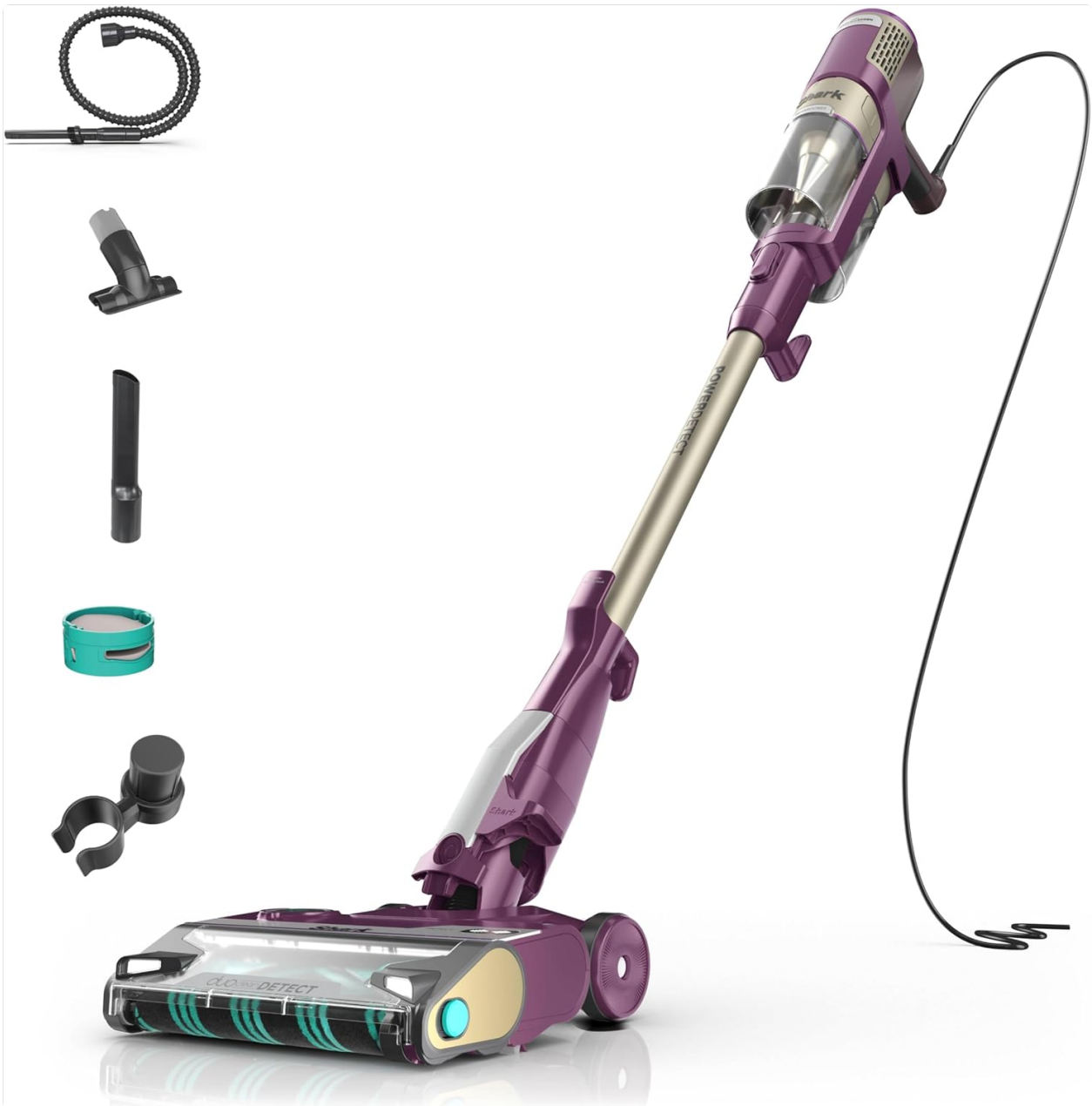
Image: The fully assembled Shark POWERDETECT Ultra-Light Corded Stick Vacuum, ready for use, with its cord and included accessories shown separately.