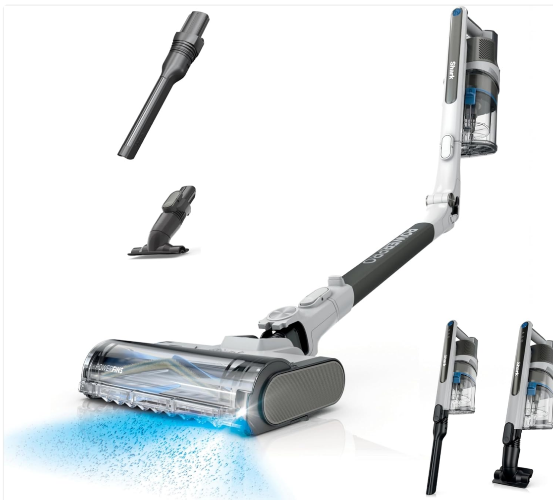
Image: The Shark PowerPro Flex Reveal Plus Cordless Vacuum shown with its main body, flexible

The Shark PowerPro Flex Reveal Plus Cordless Vacuum is designed for efficient cleaning across various surfaces. This section details the main components of your vacuum.