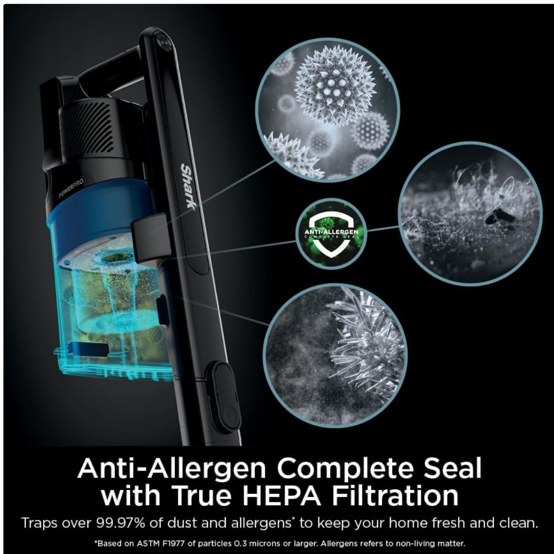
Image: A diagram illustrating the vacuum's HEPA filtration system, showing how it traps dust, allergens, and other particles.