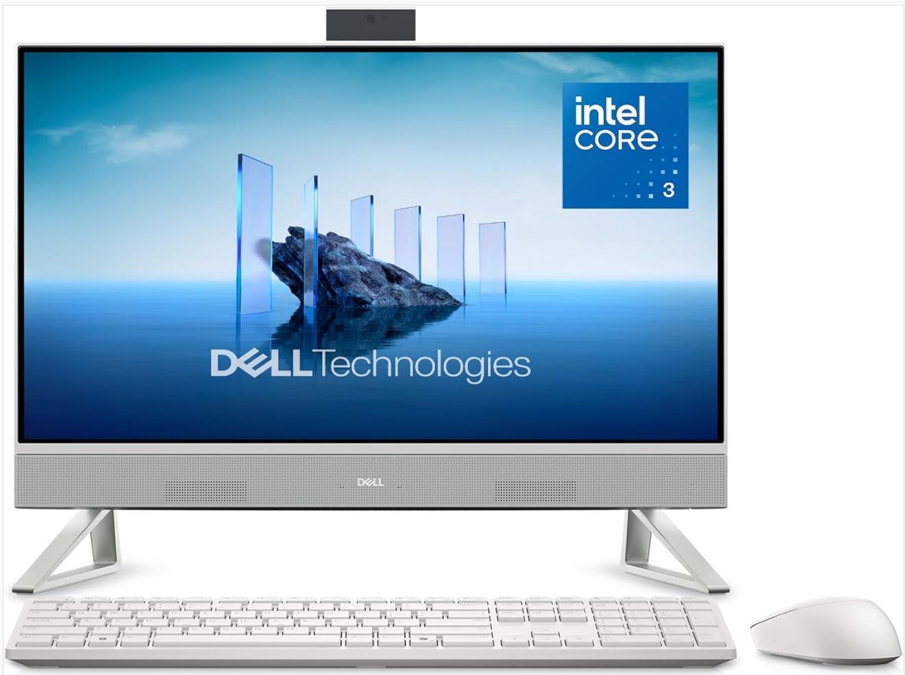
Figure 2.1: Dell 24 All-in-One Desktop with included keyboard and mouse.