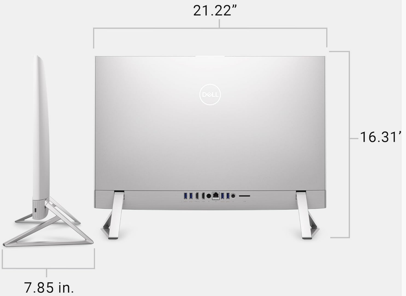
Figure 6.1: Physical dimensions of the Dell 24 All-in-One Desktop.