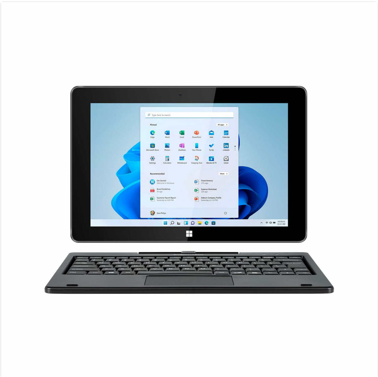
The Kruger&Matz EDGE 1089 2-in-1 Tablet in laptop mode, showcasing the Windows 11 operating system interface.