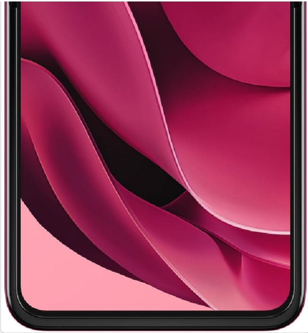
Figure 3.1: The Motorola Razr Ultra 2025 in its fully open state, ready for use.