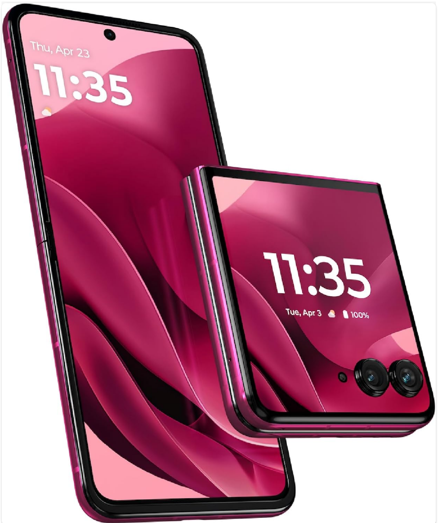
Figure 1.1: The Motorola Razr Ultra 2025, demonstrating its unique foldable design and the Pantone Cabaret finish.