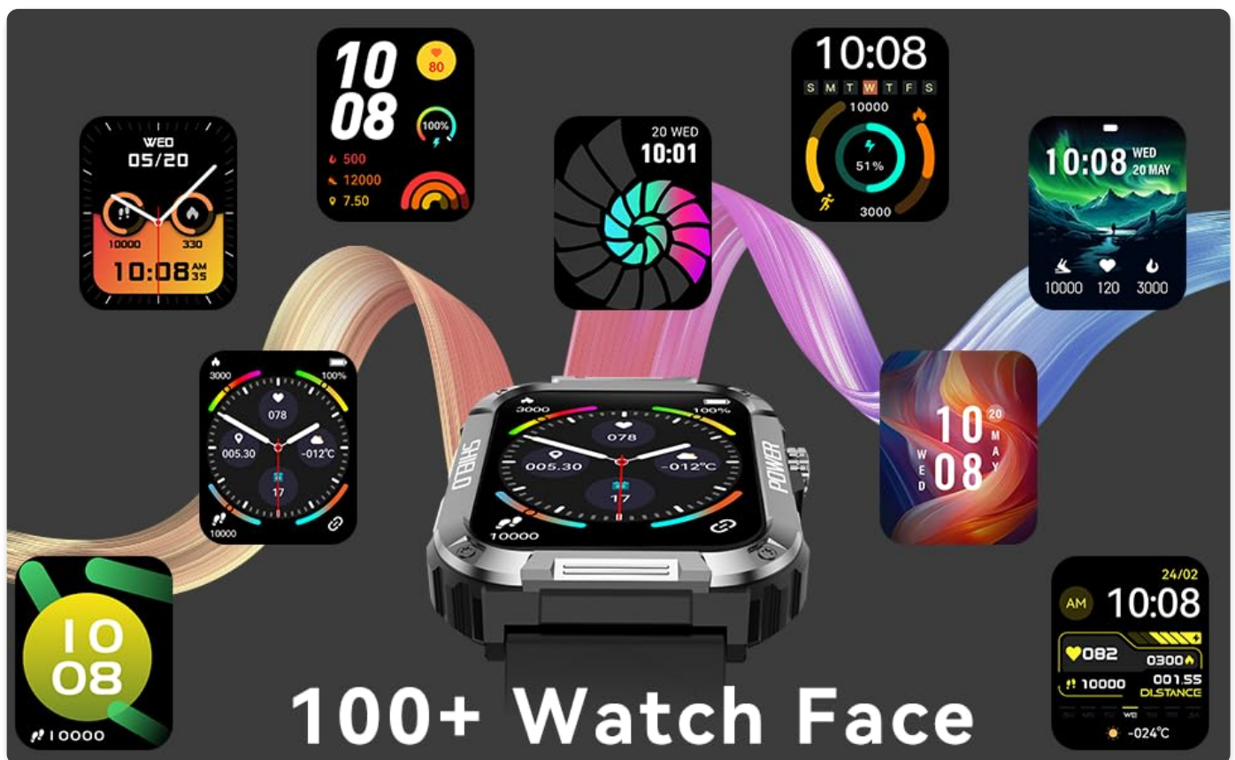
Figure 4: A selection of over 100 available watch faces, allowing for extensive personalization.

Personalize your watch to match your style and preferences.