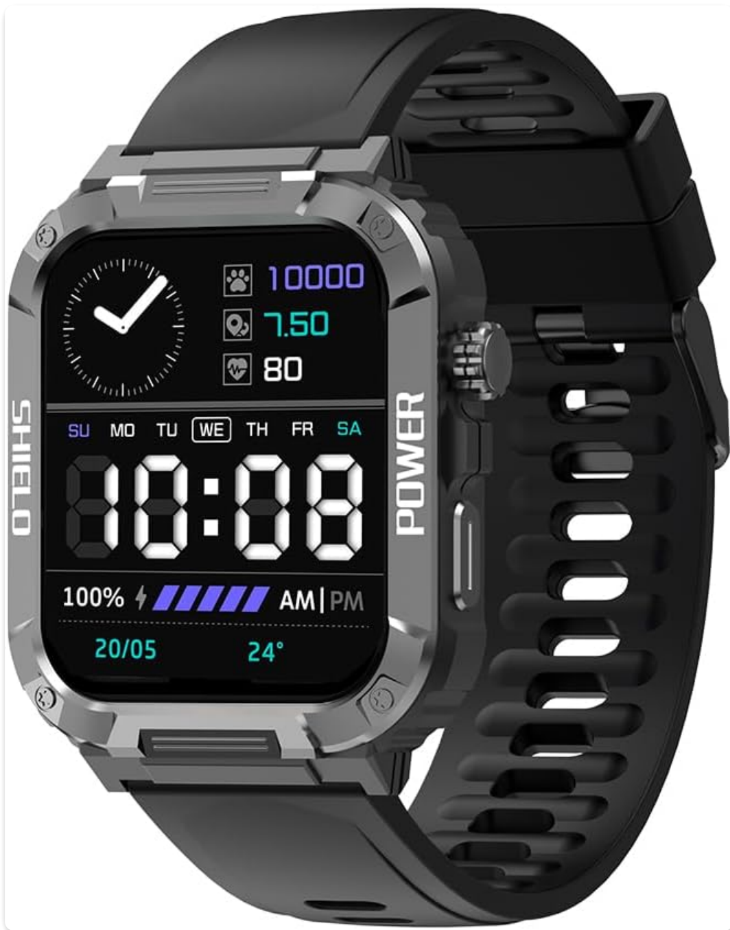
Figure 1: Apexfit Pluse S06 Pro Smart Watch, showcasing its sleek design and digital display.