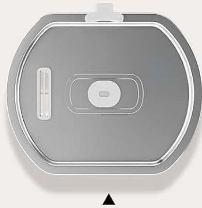
Stainless Steel Top Cover