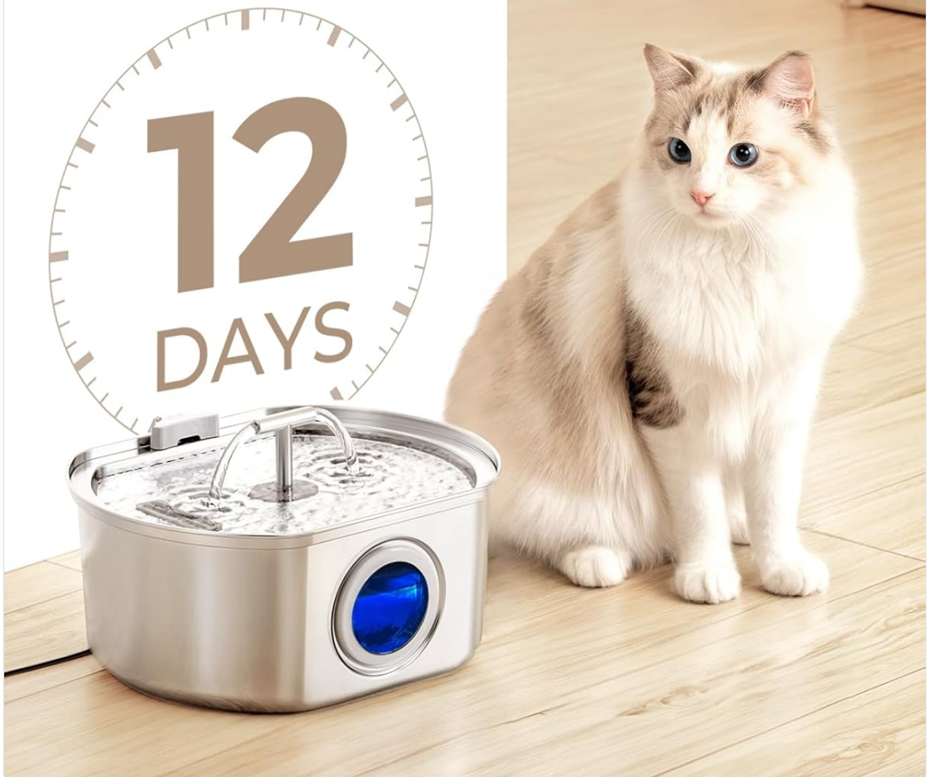
Image: A cat sitting next to the Neareal fountain, illustrating its 3.2L (108oz) capacity, sufficient for approximately 12 days of water for one cat.