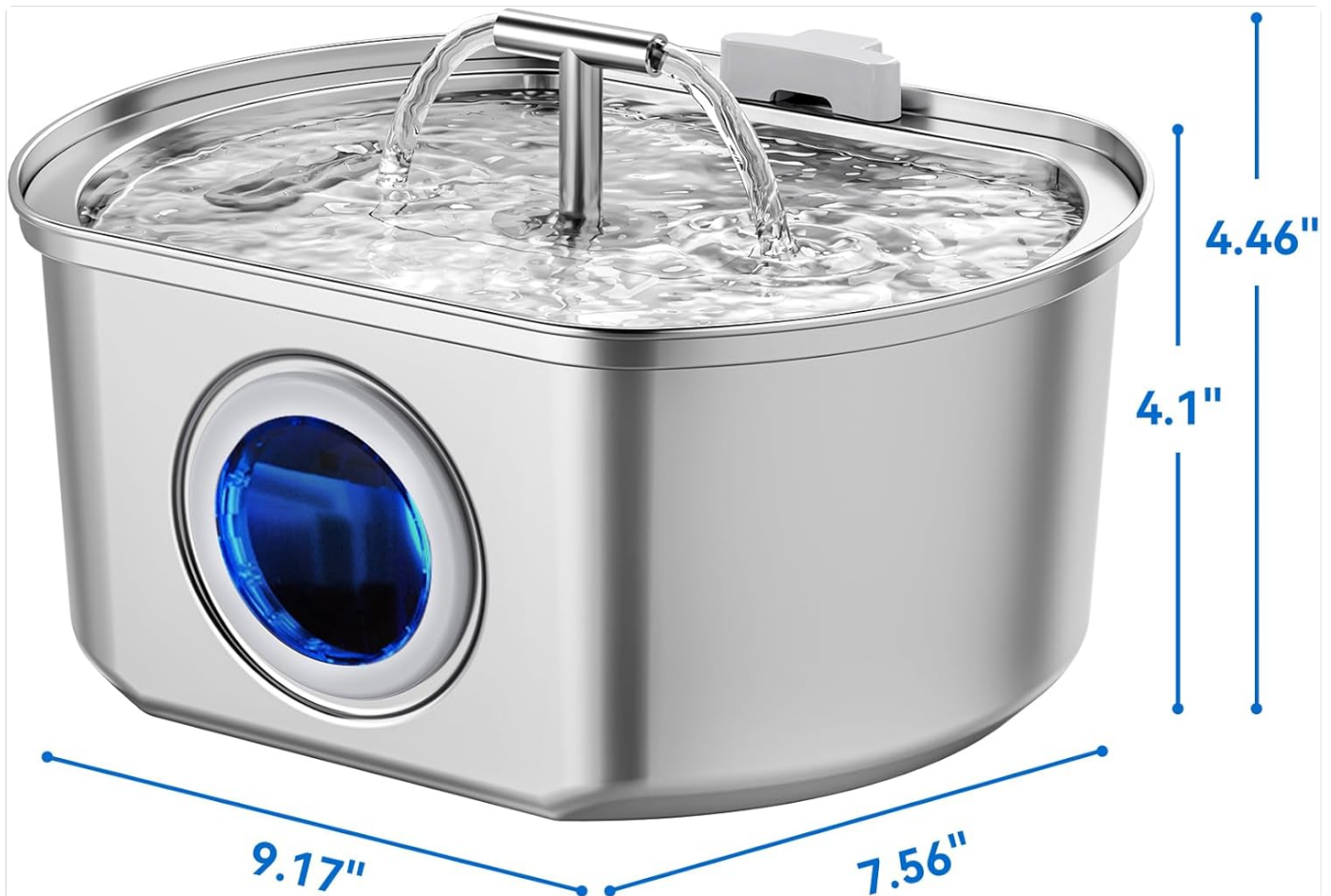
Image: Diagram illustrating the dimensions of the Neareal HY-Pro 3.2T Stainless Steel Cat Water Fountain.