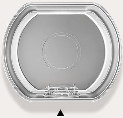
Stainless Steel Water Tank