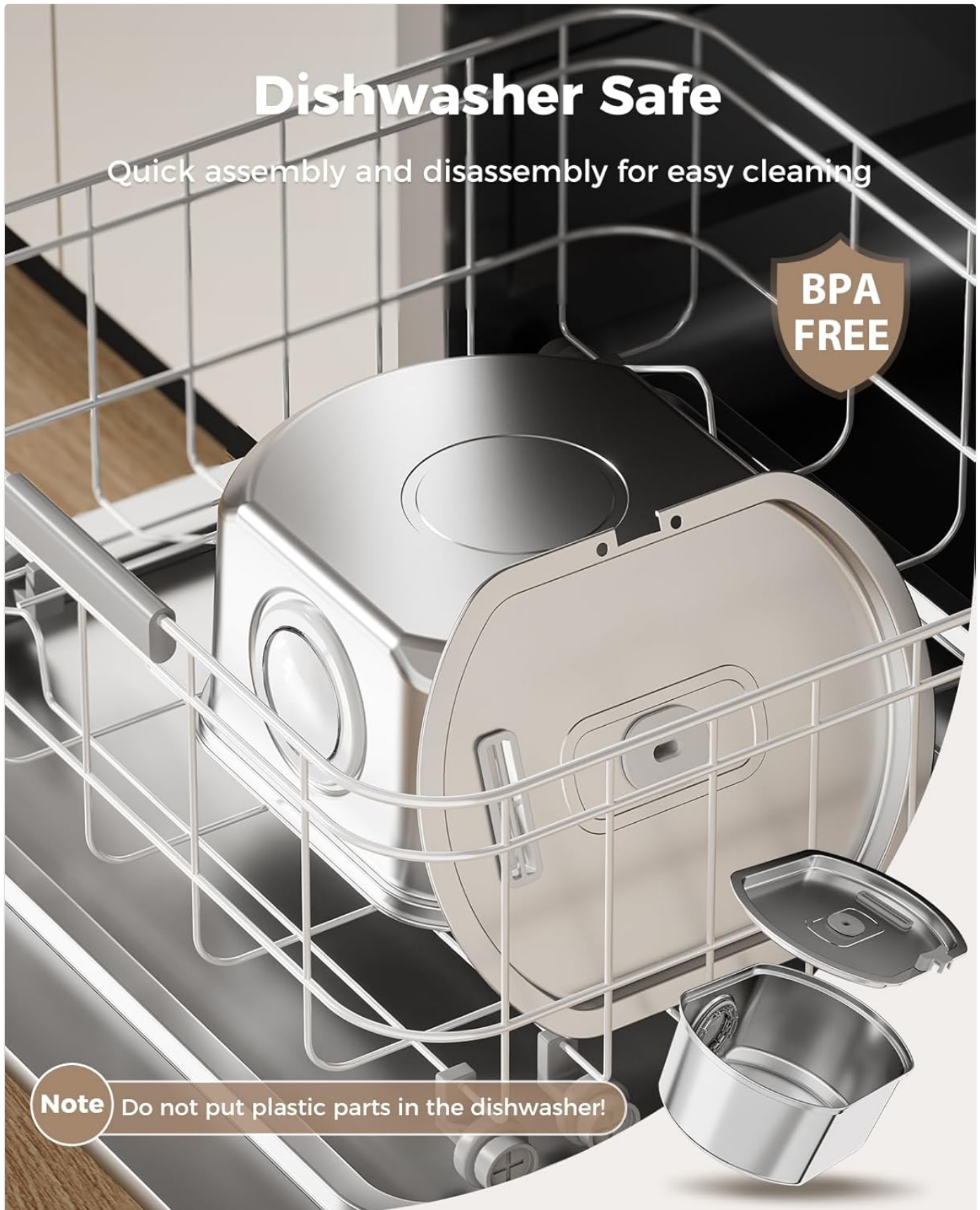
Image: Stainless steel components of the fountain placed in a dishwasher for cleaning, highlighting their dishwasher-safe feature.