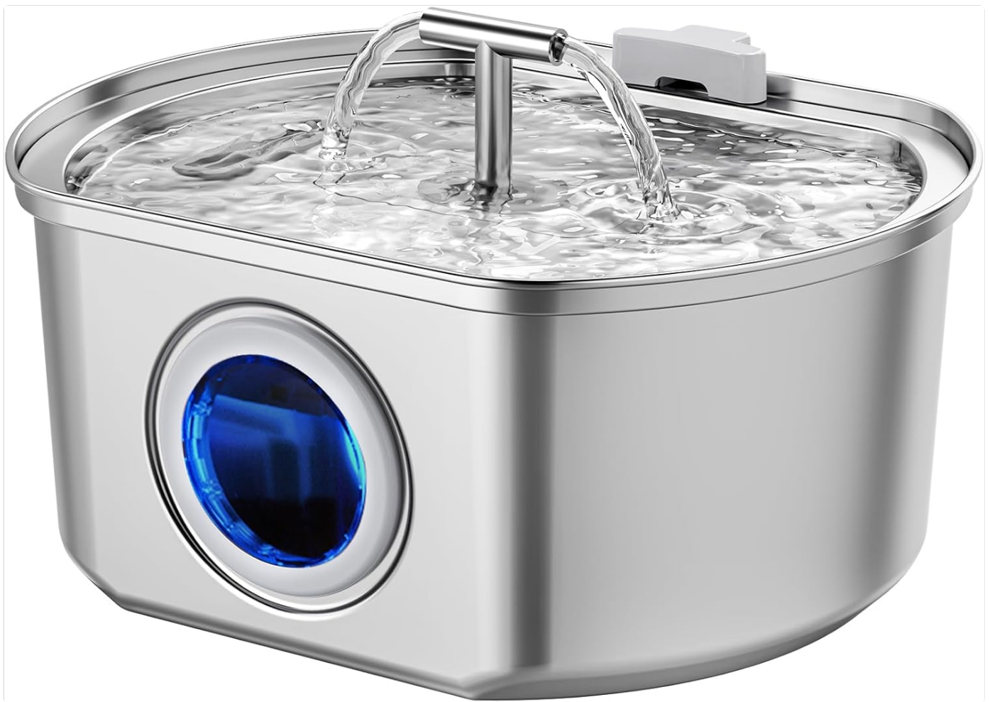
Image: The Neareal HY-Pro 3.2T Stainless Steel Cat Water Fountain, showing its sleek design and flowing water.