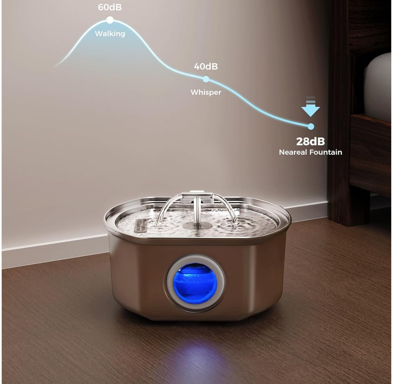
Image: A graphic demonstrating the ultra-quiet operation of the fountain's pump, rated at 28dB.

Provide comfortable, peaceful and noise-free environment