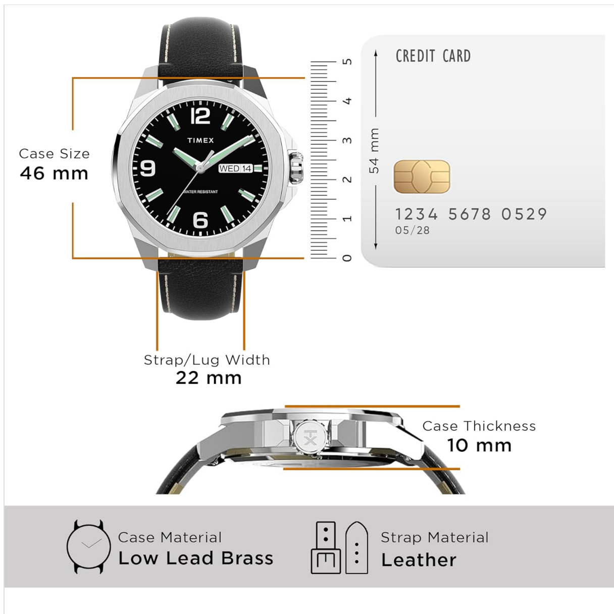
Image: Detailed diagram illustrating the key dimensions and materials of the TIMEX Essex watch, including case size, strap width, and case thickness.