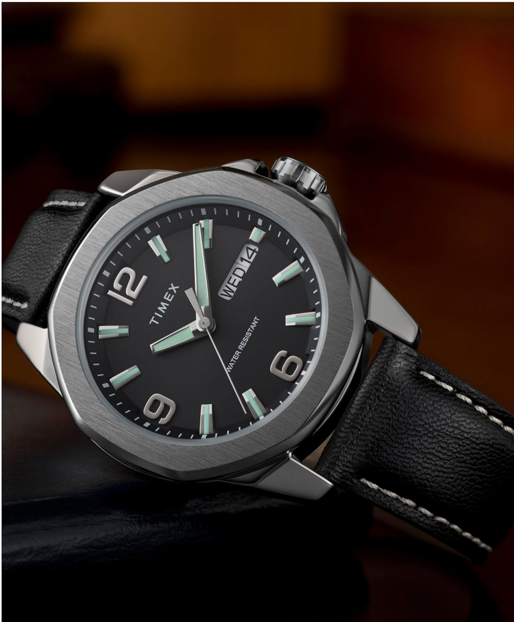
Image: Front view of the TIMEX Essex watch, showing the crown on the right side of the case, used for setting time and date.