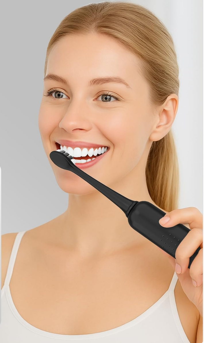
Image: 2-minute smart timer with 30-second pause reminders.