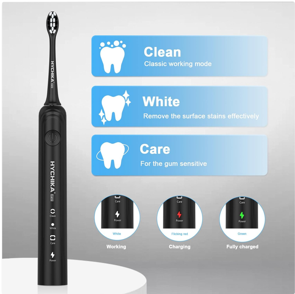
Image: Brushing modes and charging indicators.