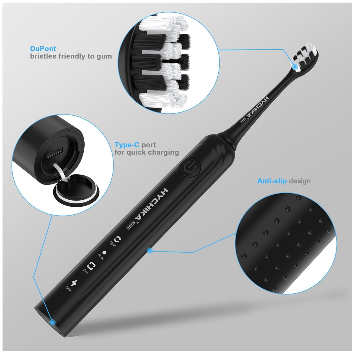
Image: Type-C charging port and anti-slip design.