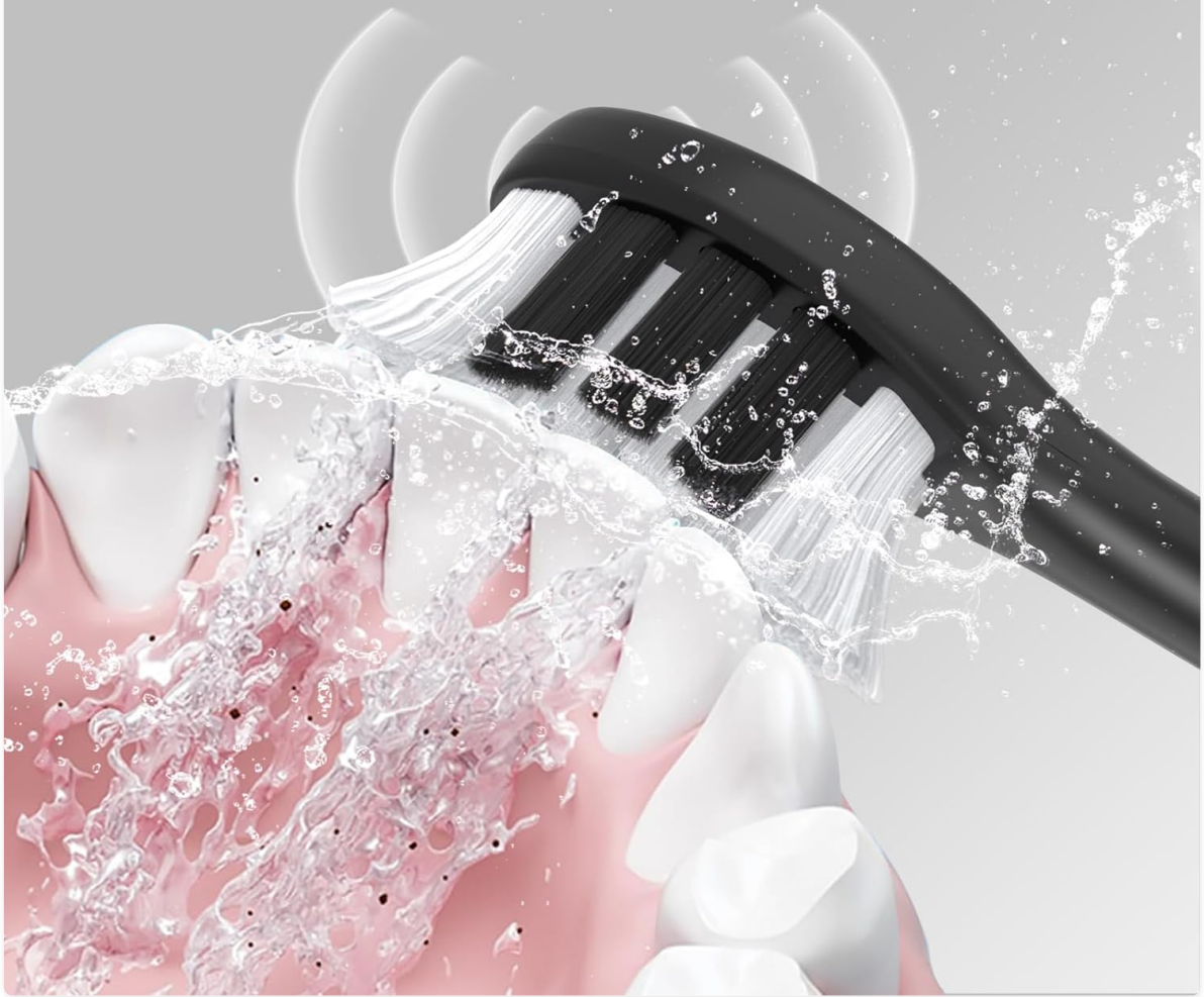
Image: Up to 31,000 vibrations per minute.