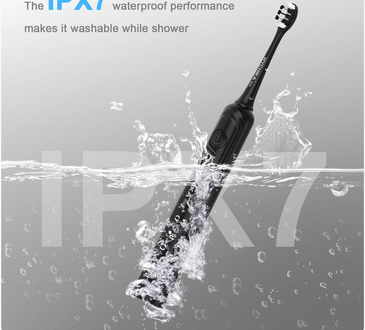
Image: IPX7 waterproof performance.

The IPX7 waterproof performance makes it washable while shower