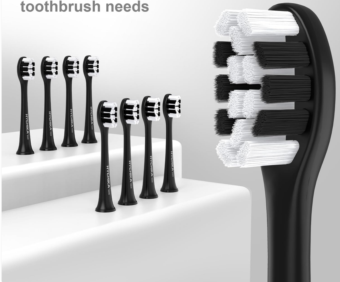
Image: 8 replacement brush heads for 2 years of use.