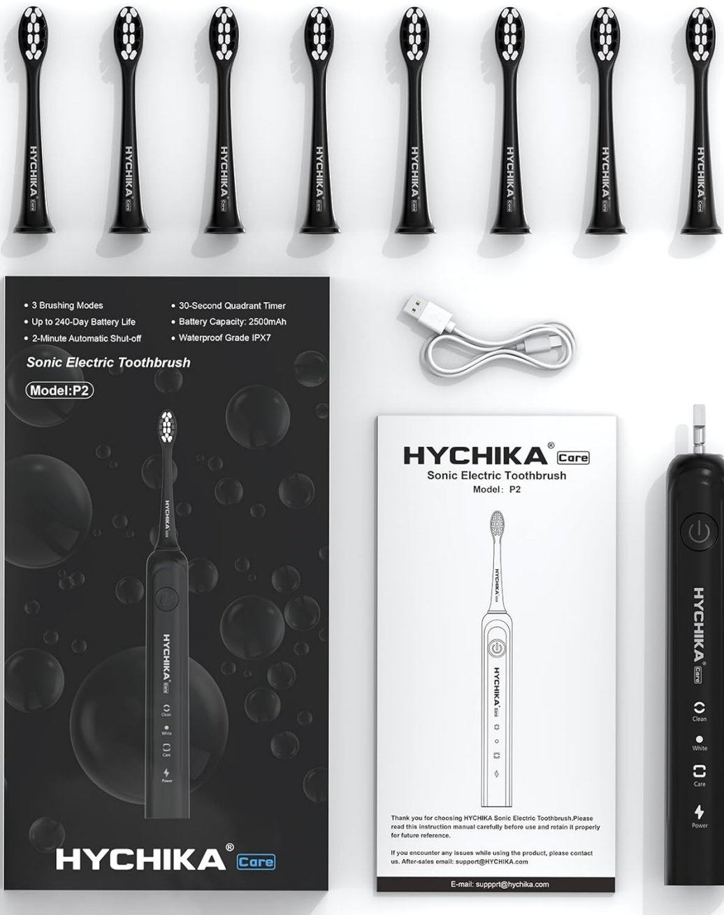
Image: All components included in the HYCHIKA Sonic Electric Toothbrush package.