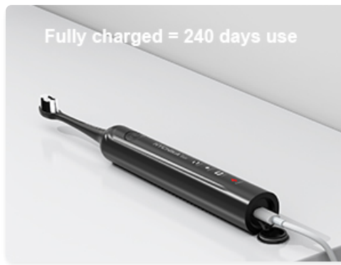
Image: Toothbrush connected to charging cable.