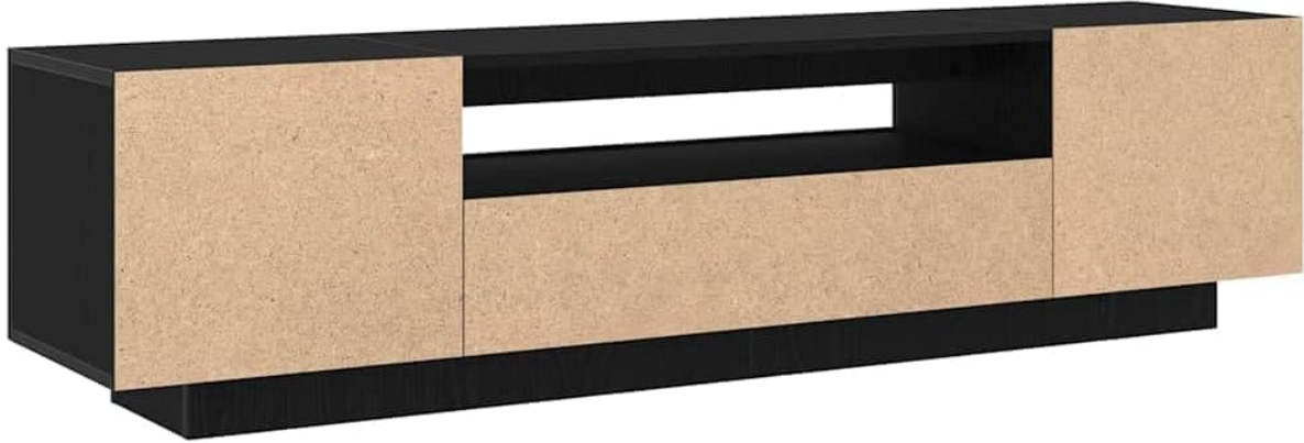
Image 3.1: Example of TV stand panels, illustrating the material and design elements.