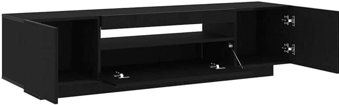
Image 4.1: Interior view of the TV stand, illustrating storage and hinge placement.