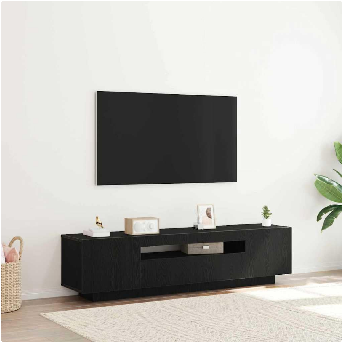
Image 1.1: The vidaXL Black Oak TV Stand with LED Lights in a typical living room setup.