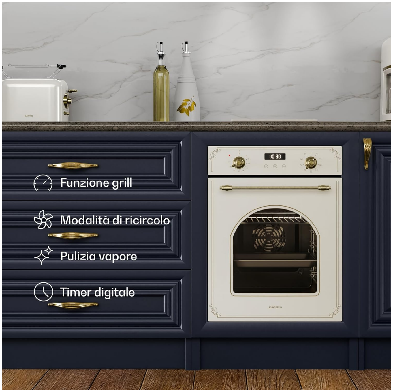
Image highlighting key features such as grill function, recirculation mode, steam cleaning, and digital timer, all contributing to ease of use and maintenance.