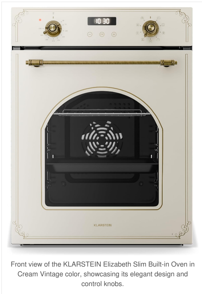
Front view of the KLARSTEIN Elizabeth Slim Built-in Oven in Cream Vintage color, showcasing its elegant design and control knobs.