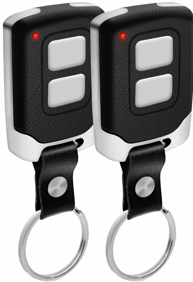
Image: The Avisontek 893MAX 893LM Universal Garage Door Opener Remote, a compact black device with two white buttons and a metal keychain ring.