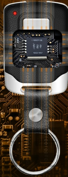
Image: An illustration highlighting the remote's features, including a 240mAh lithium battery, 100,000+ rigorous tests, ABS alloy shell, 3-year warranty, and FCC certification.