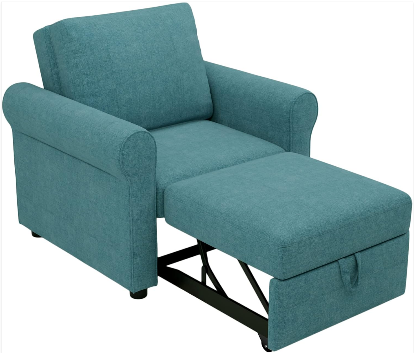
Image: The chair transitioning to a lounger by extending the footrest section.