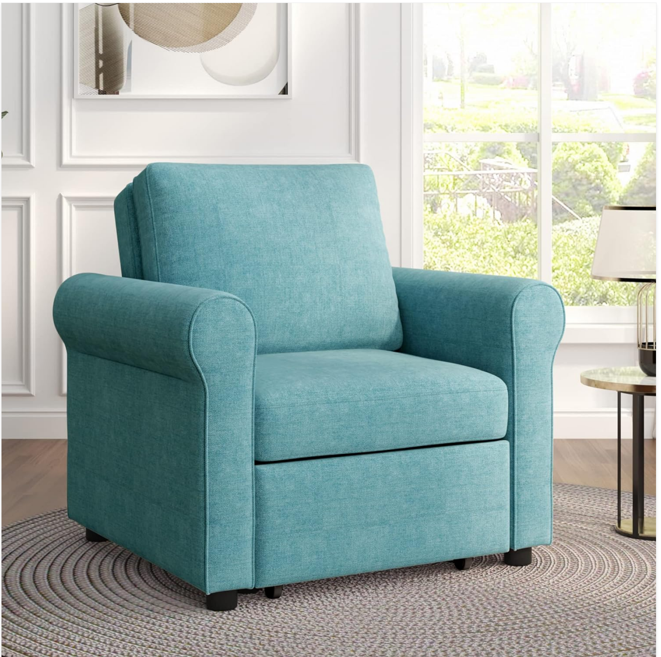
Image: The sofa bed chair in its lounger configuration, ideal for relaxation.