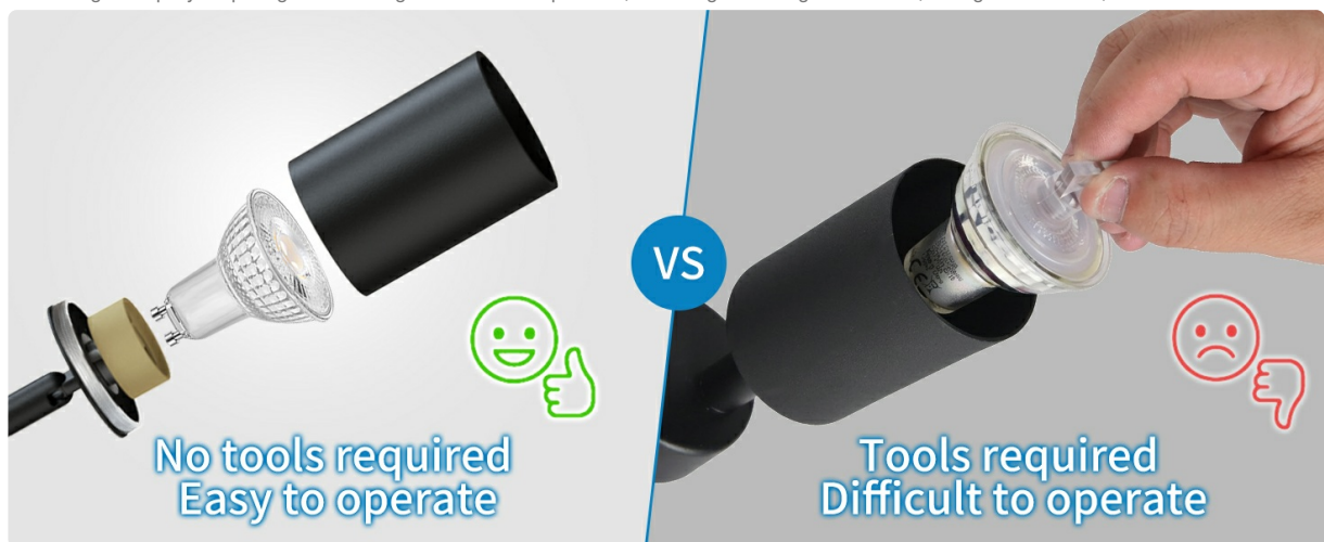
Image: A comparison illustrating the ease of bulb installation without tools for this model versus other designs that may require tools.