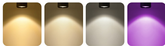
Image: Diagram indicating suitability for GU10 bulbs with a maximum of 40W each, along with examples of different color temperatures.