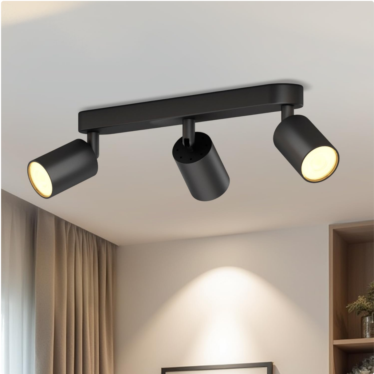
Image: The LVWIT GU10 LED Ceiling Spotlight, featuring three black cylindrical spots mounted on a rectangular base.