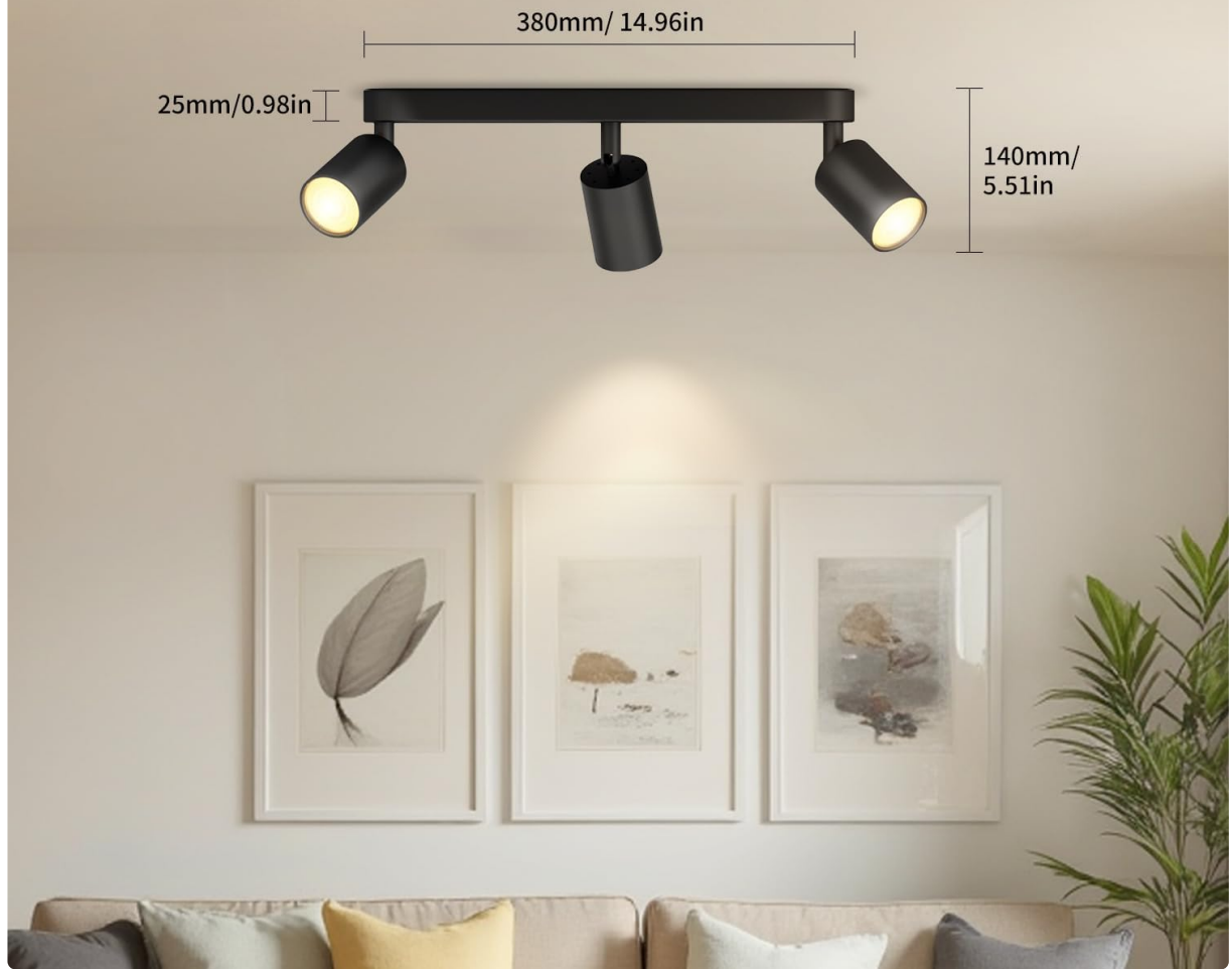
Image: Diagram showing the dimensions of the LVWIT GU10 LED Ceiling Spotlight.