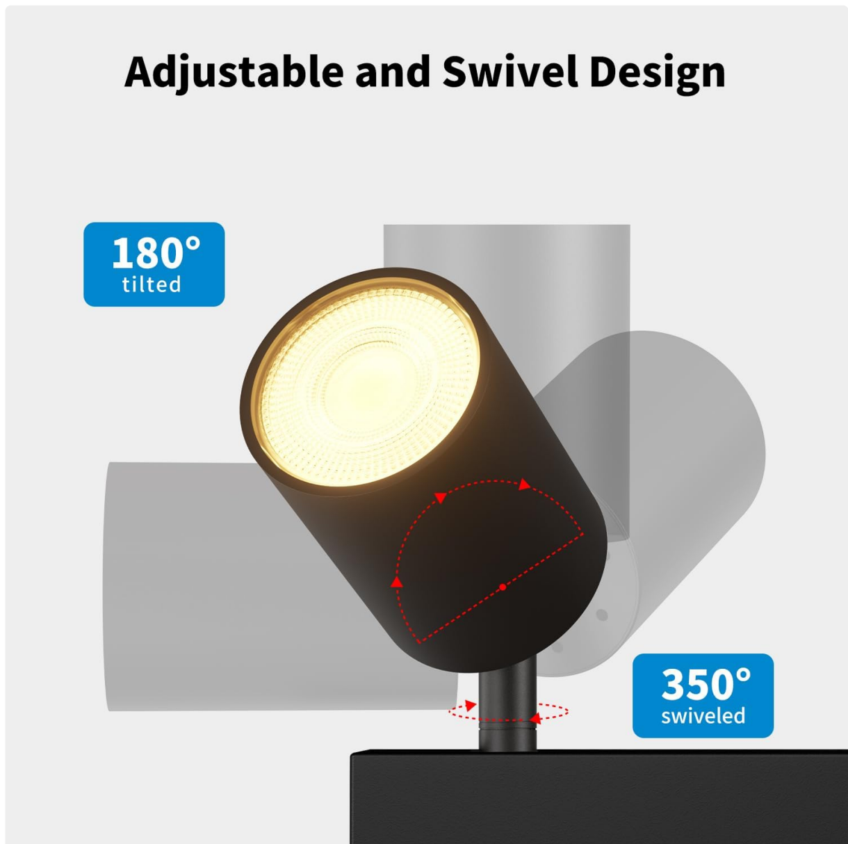
Image: Diagram illustrating the 180° tilt and 350° swivel capabilities of the spotlight heads.