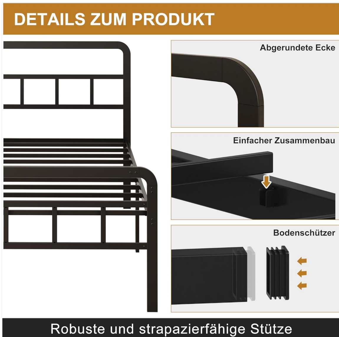
Figure 3: Close-up of design features including rounded corners and floor protectors.