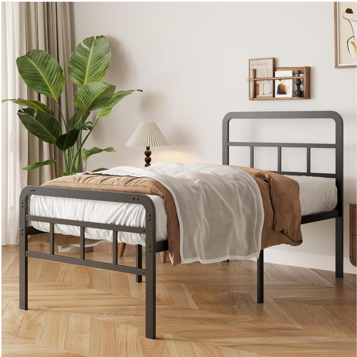
Figure 1: Assembled Yicensen Single Bed Frame with mattress and bedding.