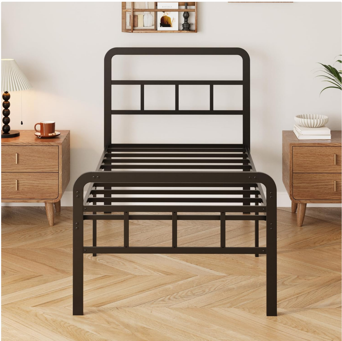
Figure 2: Bed frame components assembled, ready for slats.