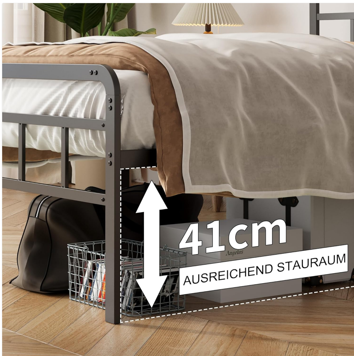
Figure 4: Illustration of the generous under-bed storage space.