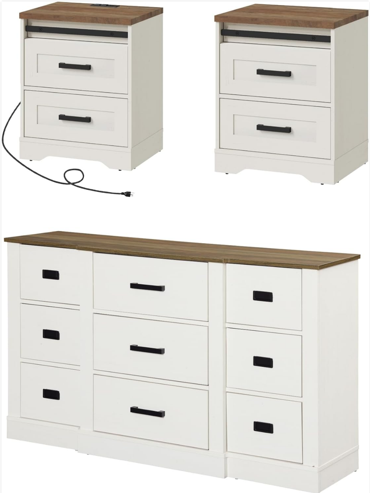
Image 3.1: The WAMPAT 3-Piece Farmhouse Dresser and Nightstand Set displayed in a bedroom. This image provides a visual reference of the assembled product in a typical setting.

An installation video guide may be available online. Refer to the product page or manufacturer's website for access.