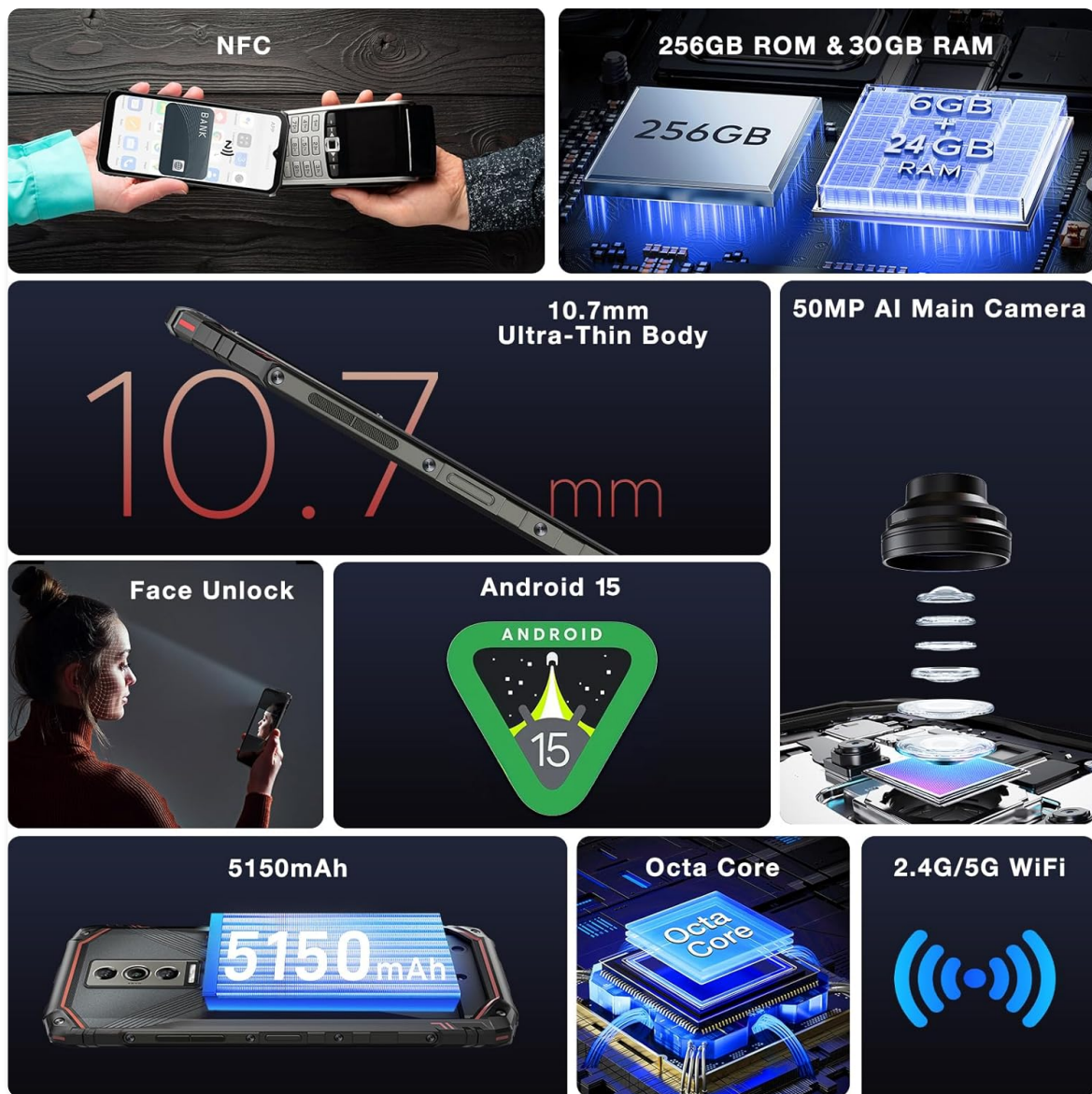
Figure 1: Overview of the DOOGEE Blade 10 Pro Rugged Smartphone with key features.