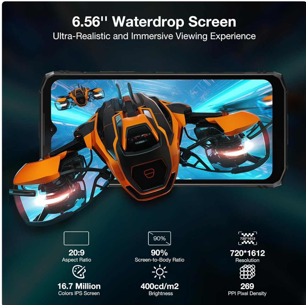
Figure 6: Display features of the Blade 10 Pro.

The 6.56-inch HD+ IPS waterdrop screen offers a 90 Hz refresh rate for smooth interaction and 400 nits of brightness for clear visibility.