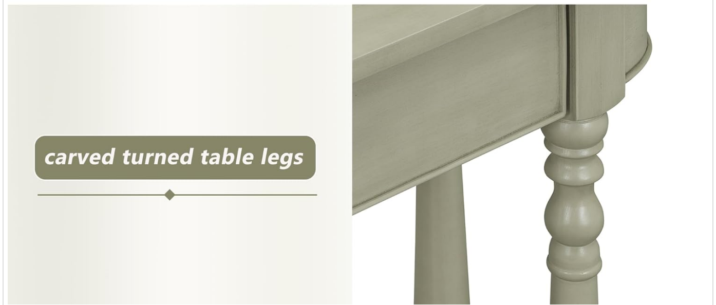
Image: Detailed views highlighting the smooth, curved corners of the tabletop and the intricately carved turned legs, showcasing the table's aesthetic features and craftsmanship.