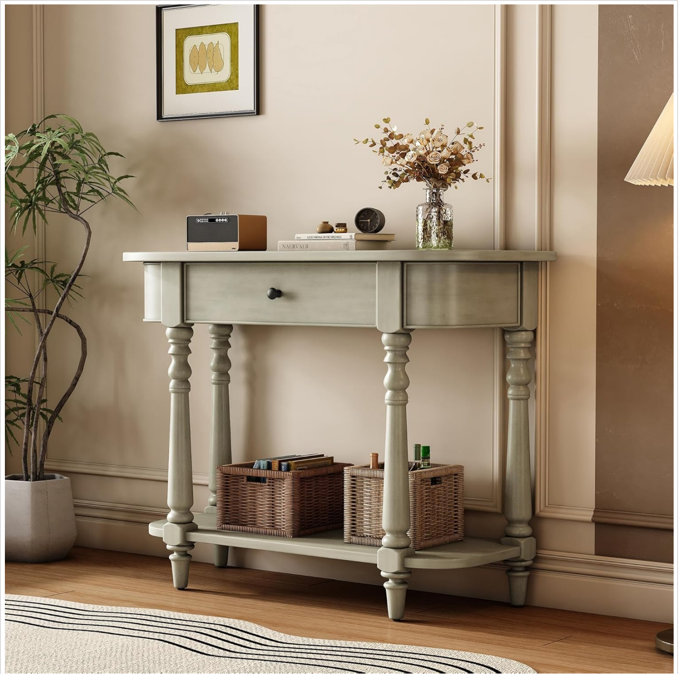
Image: The Narrow Console Table, showcasing its design and placement suitability in an entryway or living room.