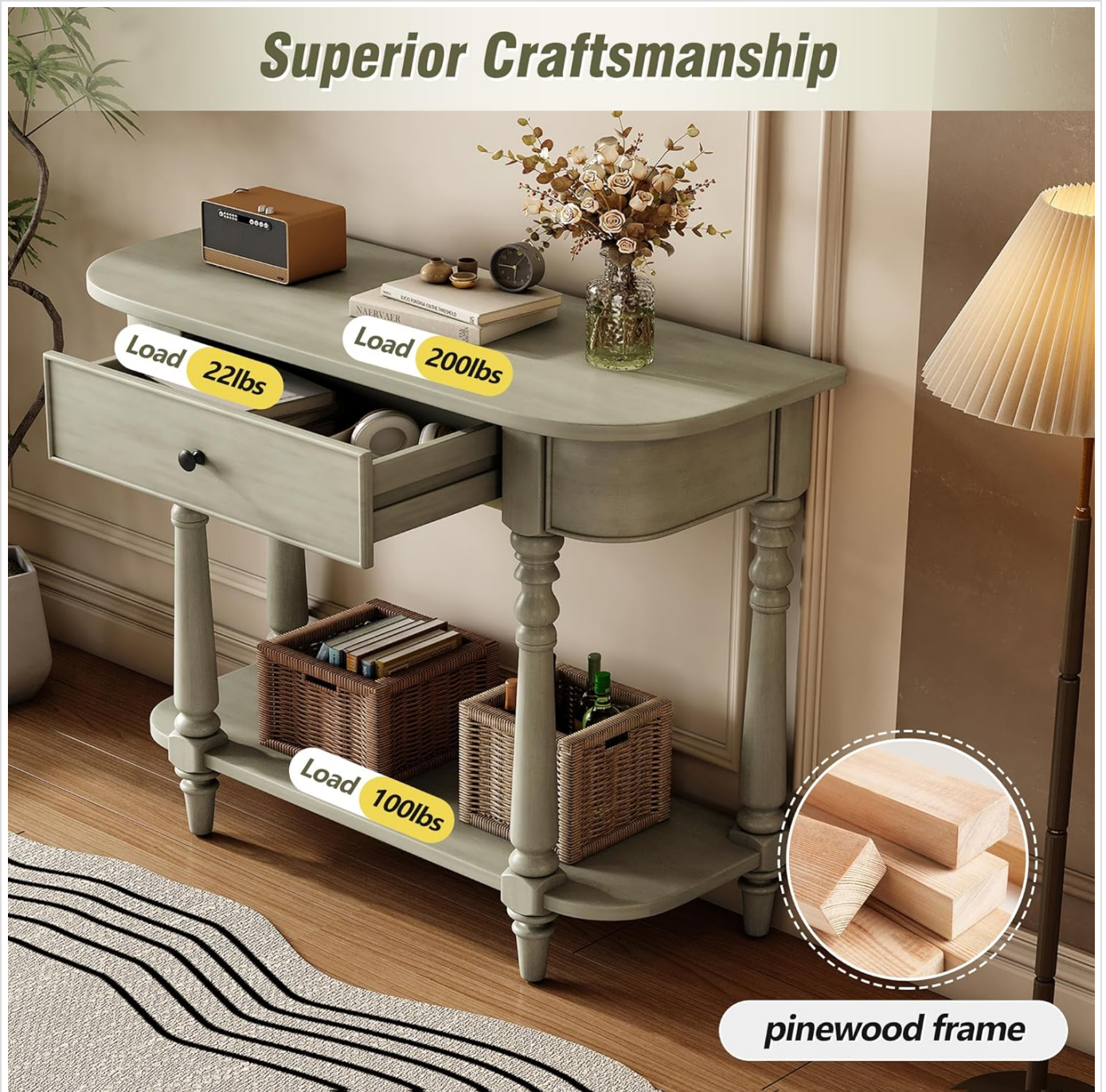
Image: A visual representation of the console table highlighting its load capacities for the tabletop (200 lbs), drawer (22 lbs), and bottom shelf (100 lbs), along with a close-up of the pinewood frame material.