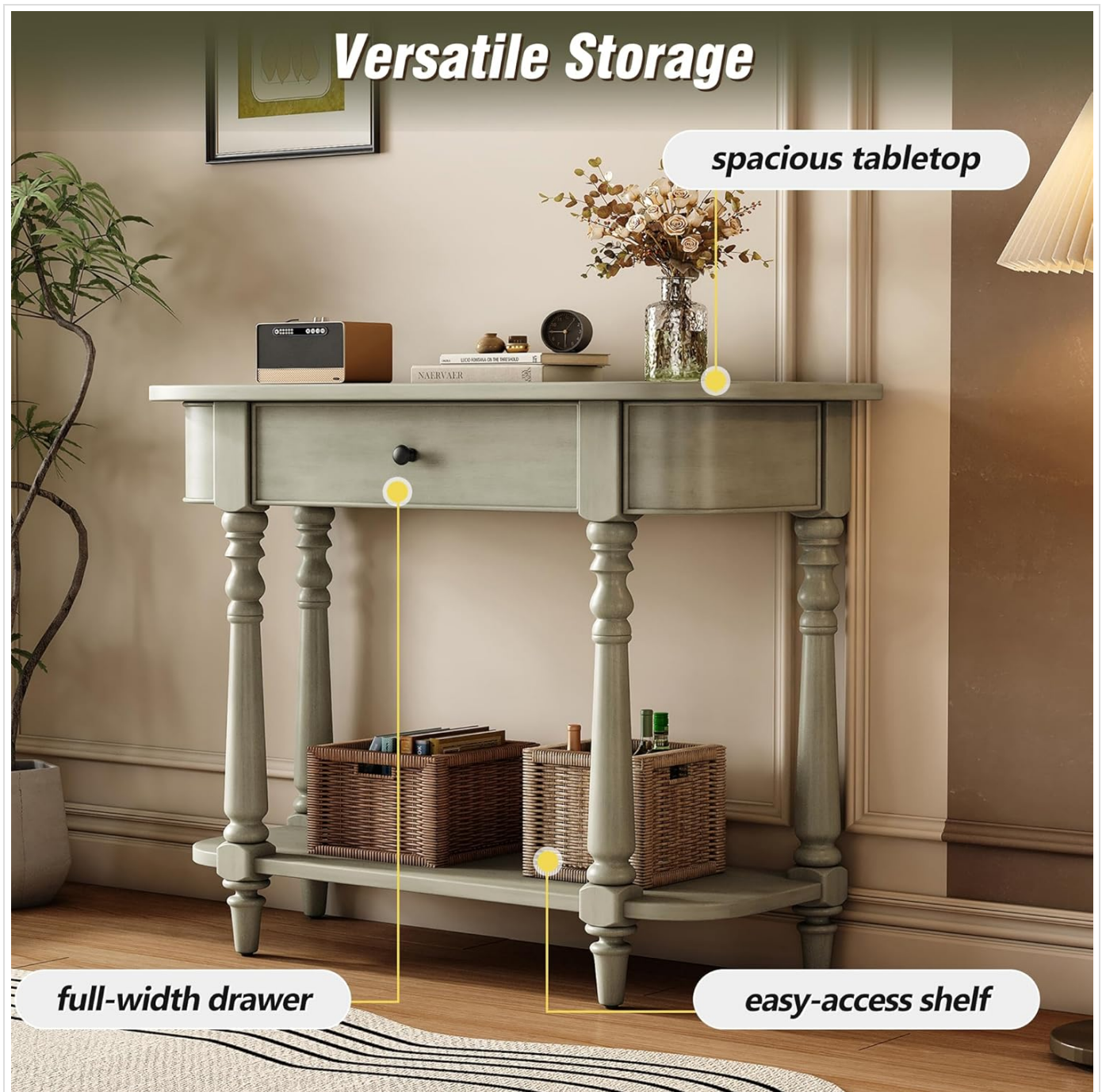
Image: A detailed view of the console table, with labels pointing to the spacious tabletop, full-width drawer, and easy-access shelf, illustrating its functional storage design.