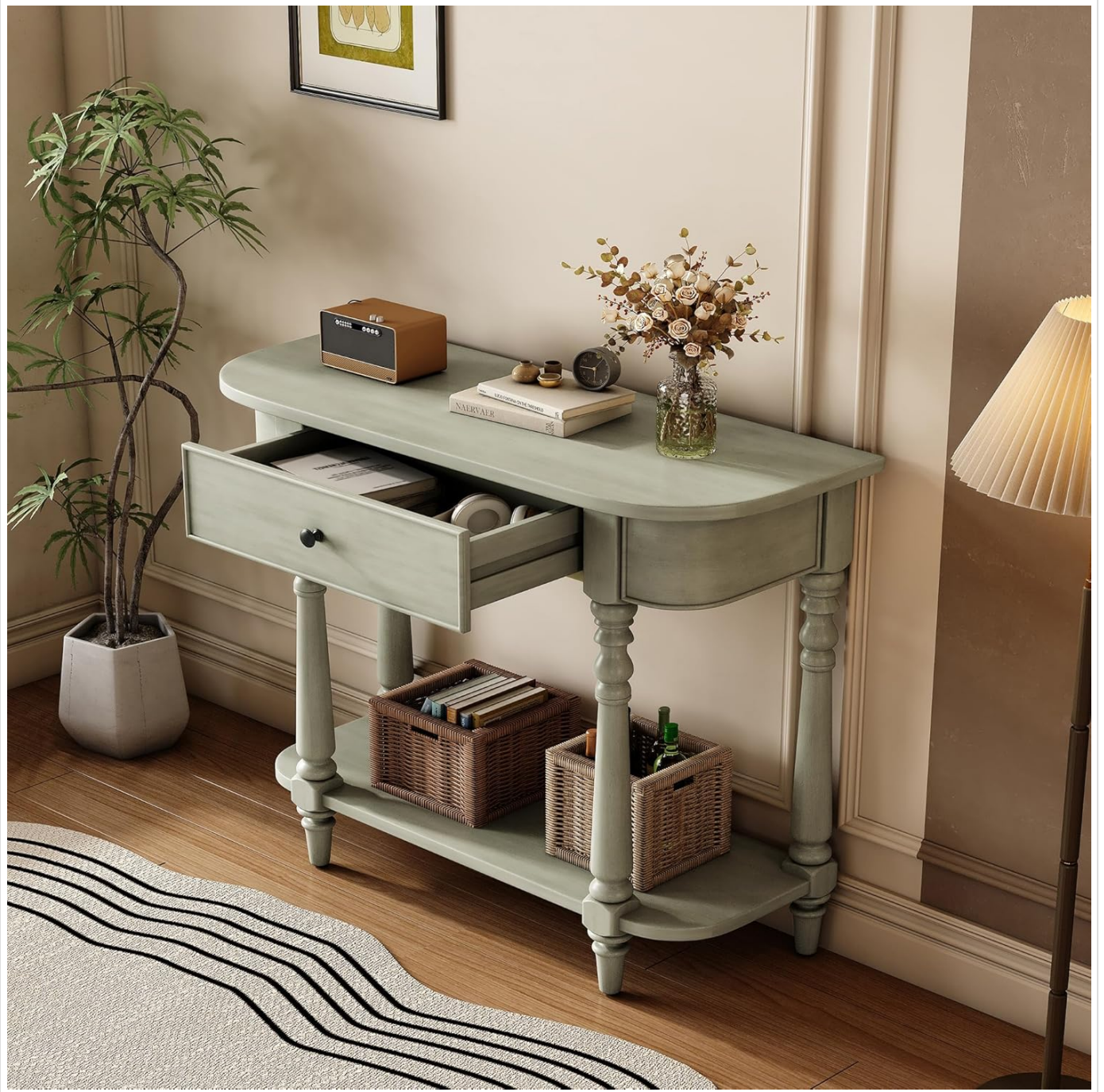
Image: The console table with its drawer partially open, revealing internal storage, and two woven baskets placed on the lower shelf, demonstrating its versatile storage capabilities.