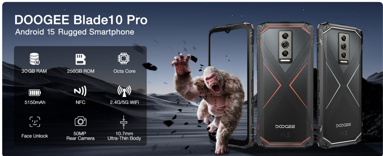
Figure 1: DOOGEE Blade10 Pro Rugged Smartphone highlighting key features.

The DOOGEE Blade10 Pro is a rugged smartphone designed for durability and performance. Featuring an ultra-thin body, a large battery, and advanced camera capabilities, it is built to withstand challenging environments while providing a smooth user experience with Android 15.