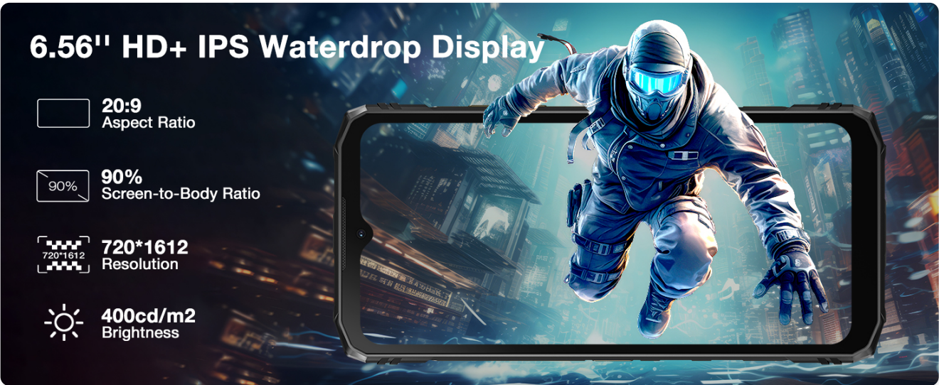
Figure 6: The 6.56-inch HD+ IPS waterdrop display of the DOOGEE Blade10 Pro.

The Blade10 Pro features a 6.56-inch HD+ IPS waterdrop screen with a 90Hz refresh rate, providing a smooth and immersive visual experience. With 400 nits of brightness, the display offers clear visibility in various lighting conditions.