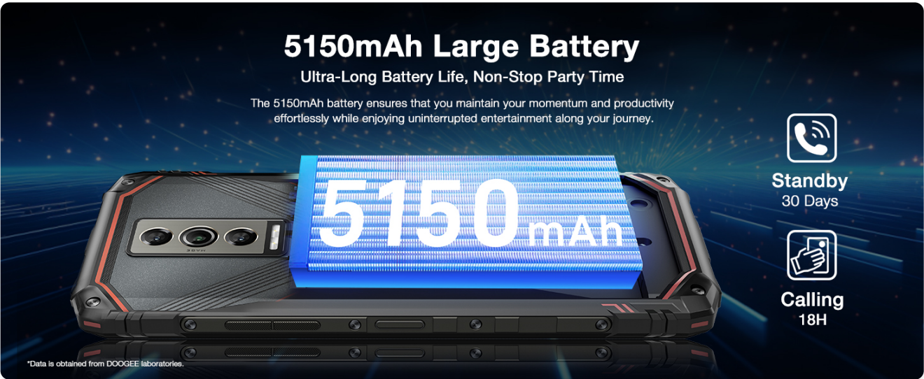
Figure 9: The 5150mAh large battery of the DOOGEE Blade10 Pro, offering ultra-long battery life.

Equipped with a large 5150mAh battery and 10W charging technology, the Blade10 Pro provides extended usage throughout the day, keeping you connected and entertained.