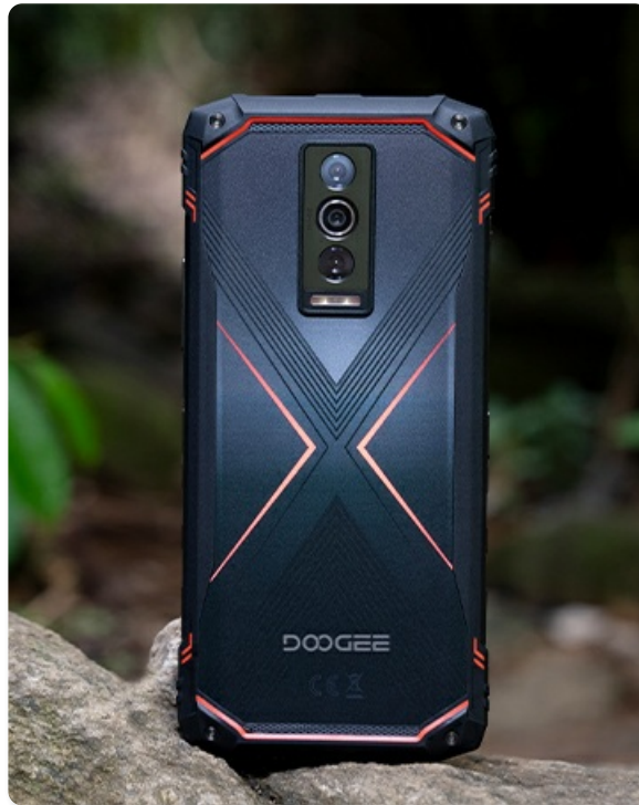
Figure 3: Detailed diagram showing the layout and components of the DOOGEE Blade10 Pro smartphone.