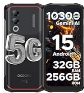
Figure 8: The 50MP AI main camera and 8MP front camera of the DOOGEE Blade10 Pro.

Capture life's moments with the 50MP AI main camera and 8MP front camera. The camera system includes various advanced shooting modes such as HDR, Panorama, Pro Mode, and Beauty Mode to enhance your photography.