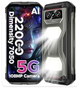
Figure 12: The DOOGEE Blade10 Pro is waterproof, dust-proof, and drop-proof, meeting IP68, IP69K, and MIL-STD-810H standards.

Your browser does not support the video tag. This video demonstrates the IP68/IP69K waterproof capabilities of a rugged Android phone.