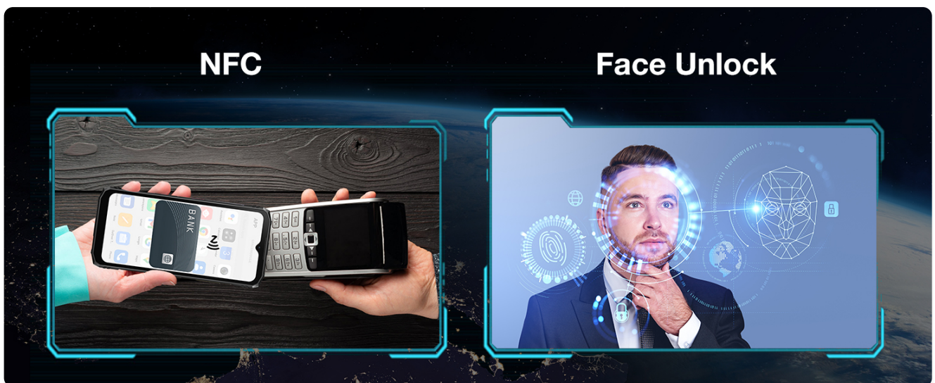
Figure 11: NFC functionality for quick and secure transactions.

The Blade10 Pro supports NFC for contactless payments and data transfer, dual-band Wi-Fi (2.4G/5G) for fast internet access, and built-in GPS for navigation.