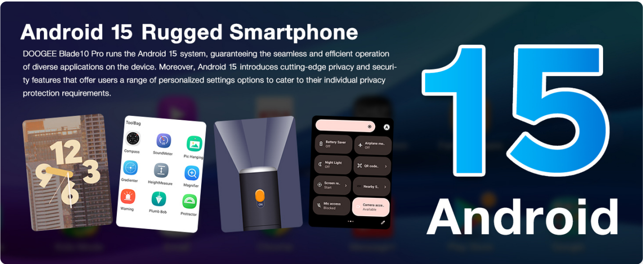
Figure 5: The Android 15 interface on the DOOGEE Blade10 Pro, showcasing its optimized operating system.

To power on your device, press and hold the Power Key until the DOOGEE logo appears. Follow the on-screen instructions to complete the initial setup, including language selection, Wi-Fi connection, and Google account setup.