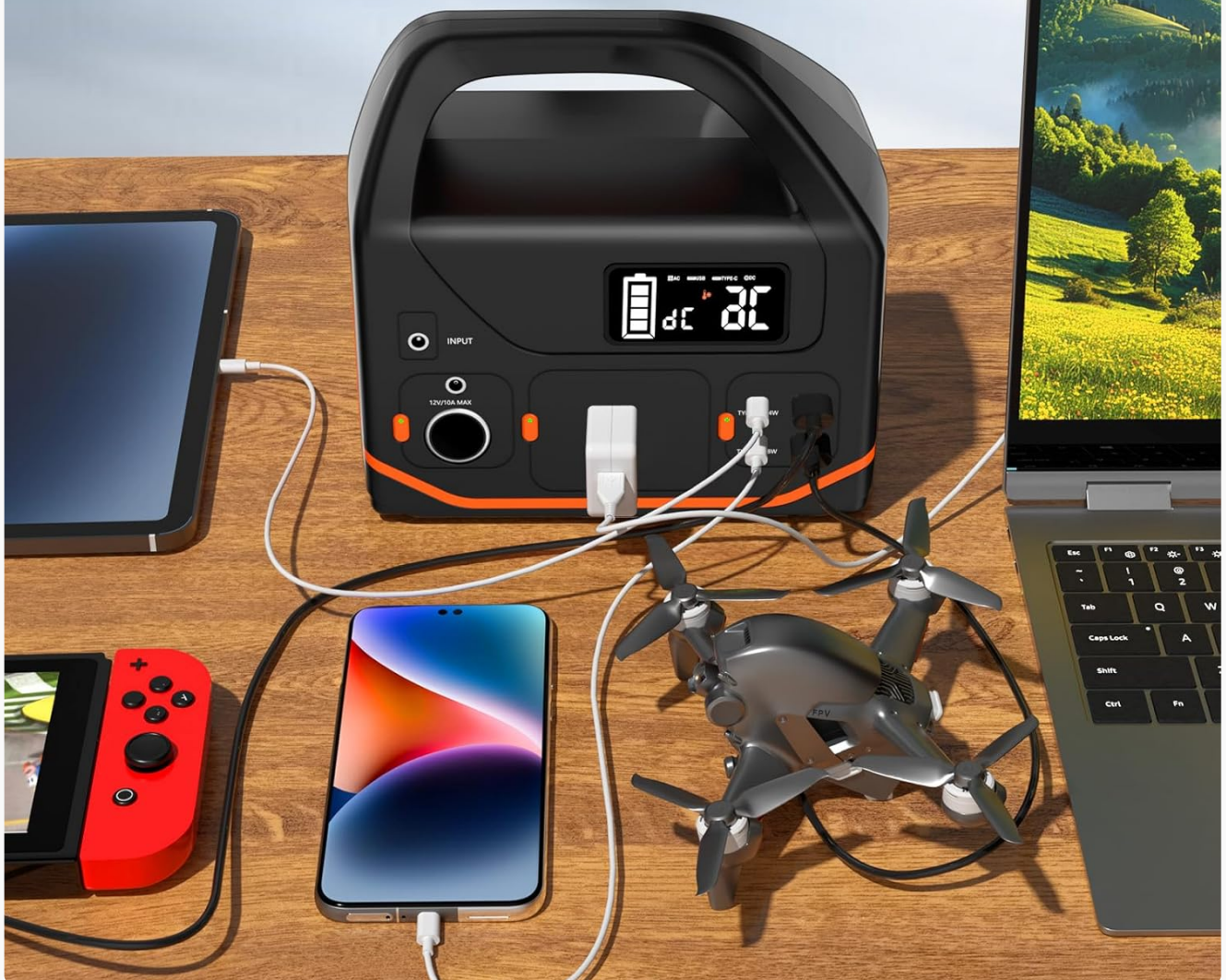
Figure 4: The power station simultaneously charging a variety of electronic devices.