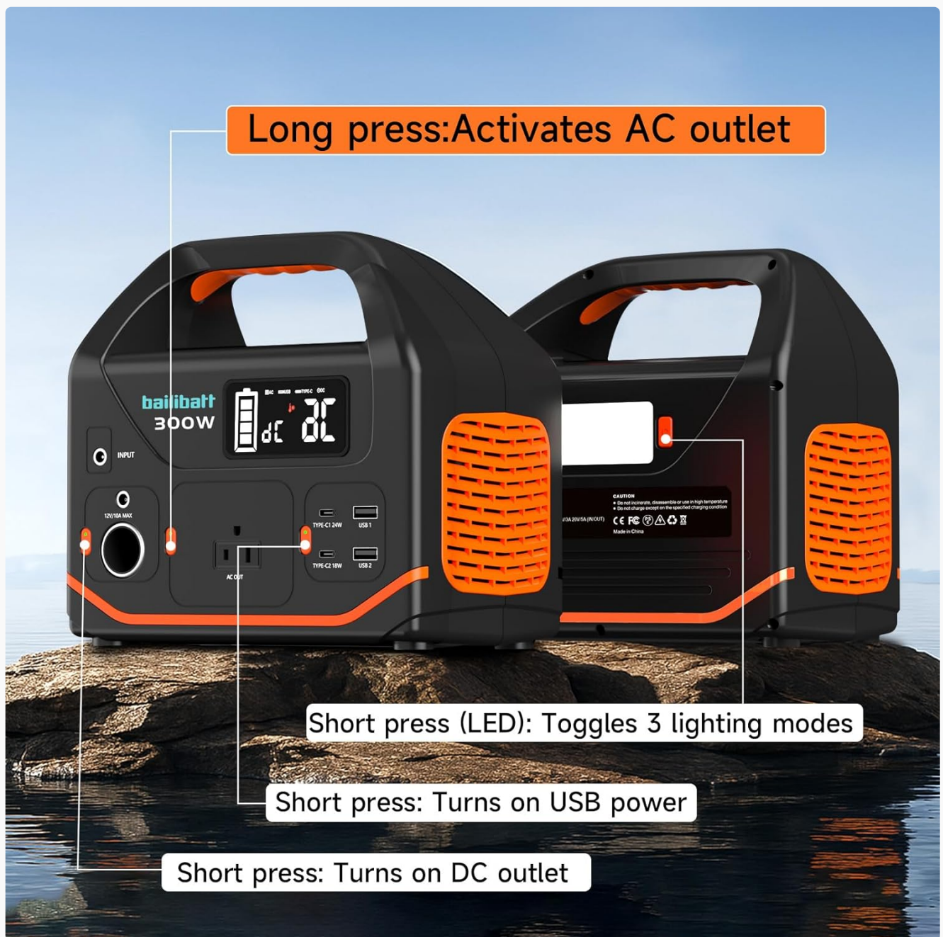
Figure 3: Button functionalities for activating different output types and the LED flashlight.