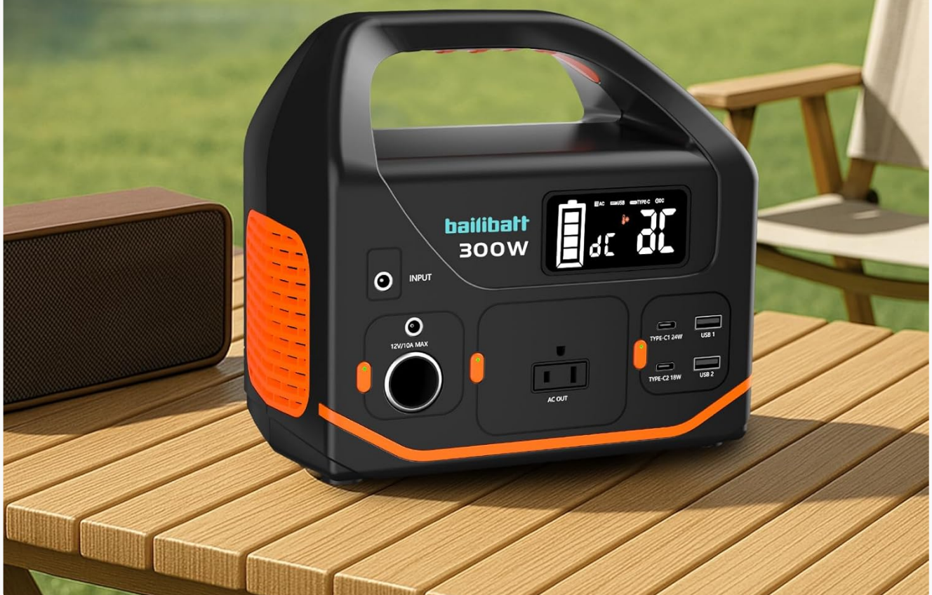
Figure 2: Detailed view of the multi-port power station, highlighting the AC, USB-C, USB-A, Car, and DC output options.