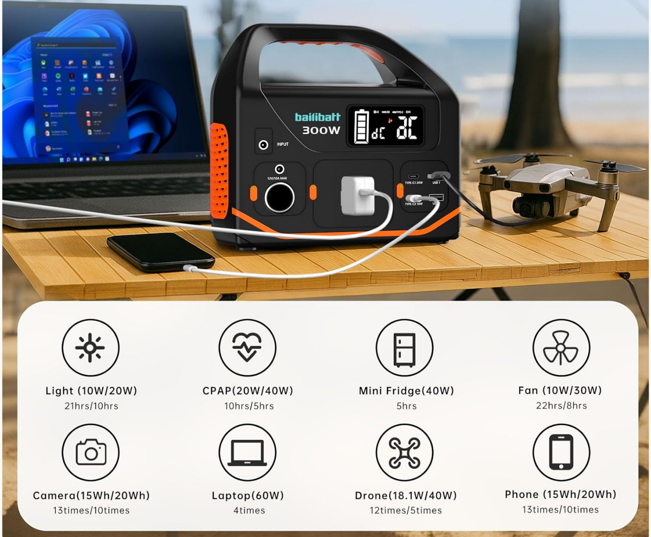
Figure 5: Estimated device runtimes based on the power station's capacity.

2,000mAh lithium battery (266.4Wh rated capacity)