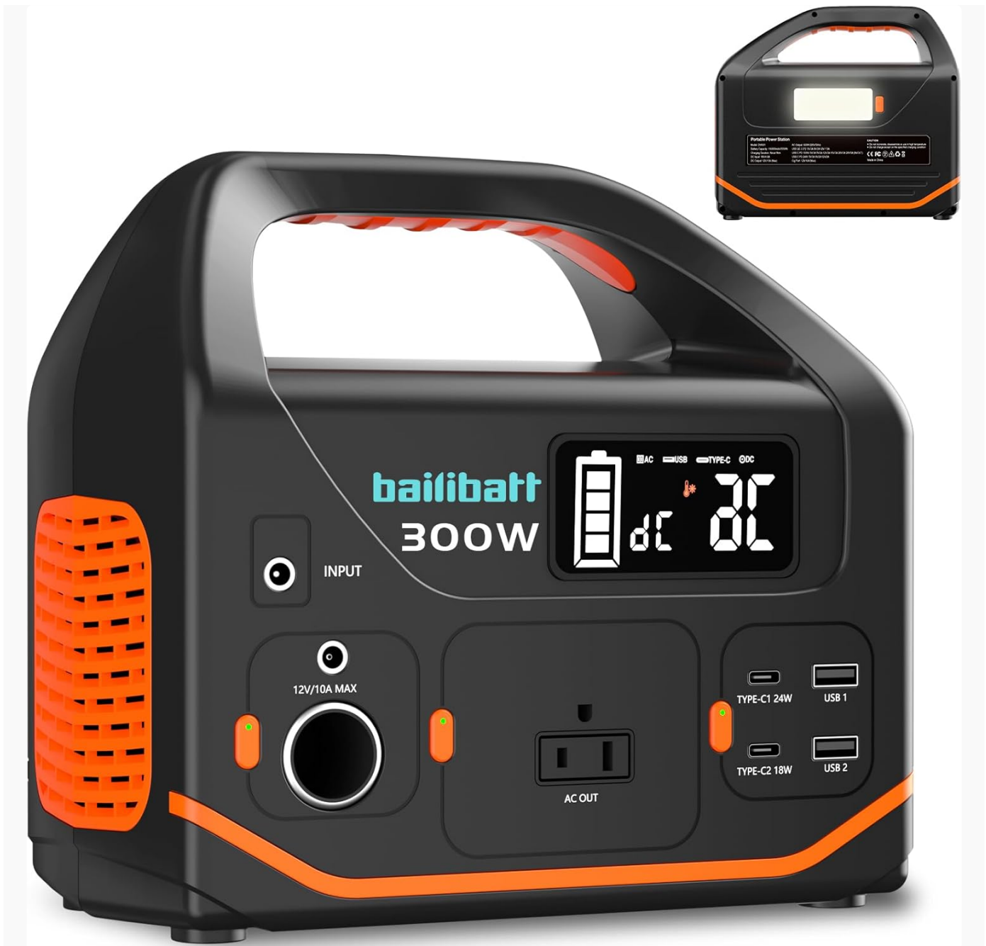
Figure 1: Front view of the bailibatt DW301S Portable Power Station, showcasing its compact design and accessible ports.