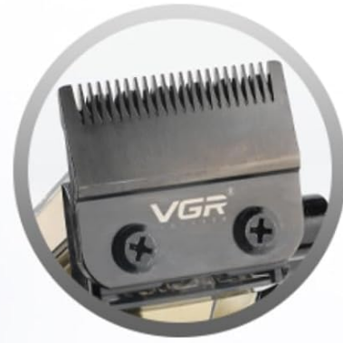
Ceramic and stainless steel blade

3 Hours Charging Time 200 Mins Operating Time 7000 RPM DC Motor 2000 mAh Battery