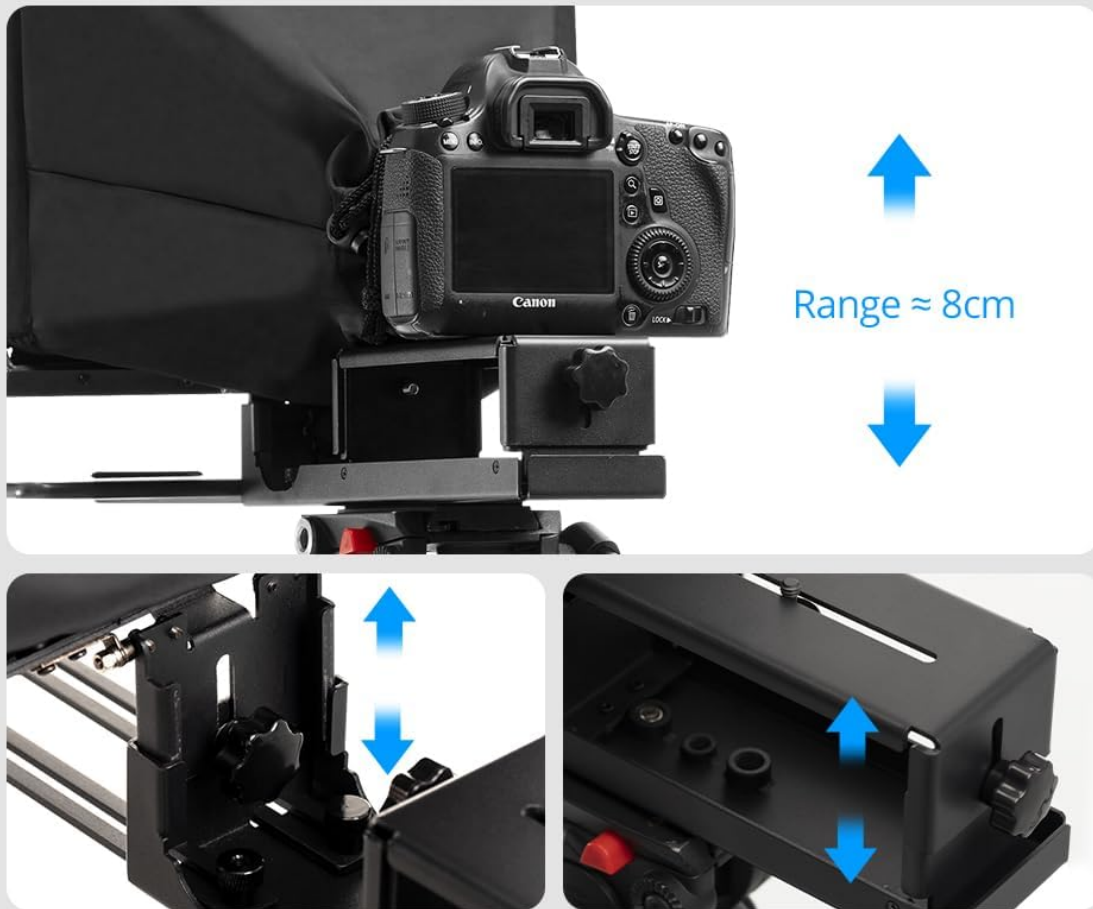
Image 3.1: Adjusting the screen and camera height using the lift gimbal.

The teleprompter is equipped with a screen head to adjust the height of the screen; the camera height can also be adjusted by installing a camera lifting head.