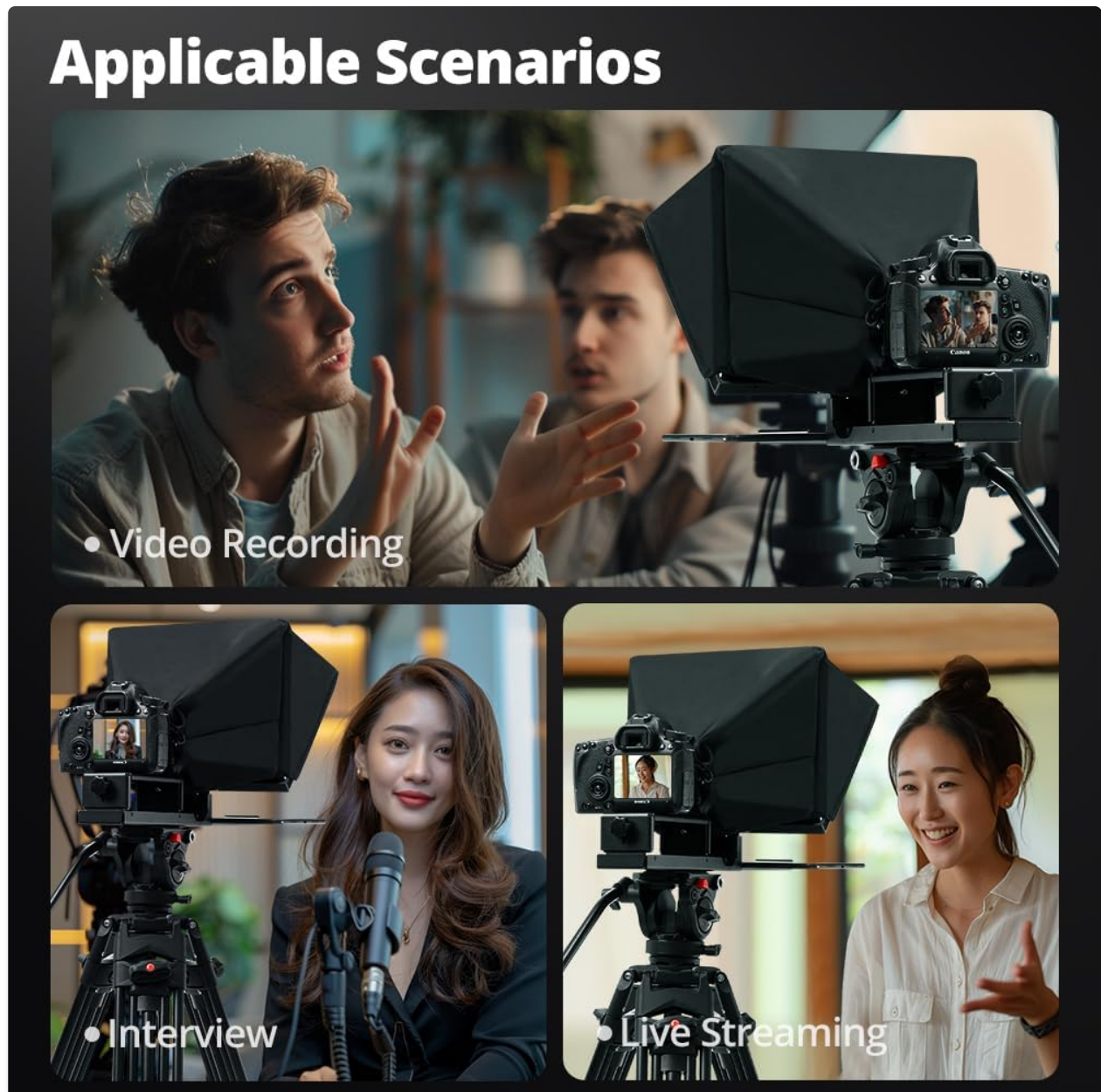
Image 4.4: Examples of the teleprompter in use across different professional settings.