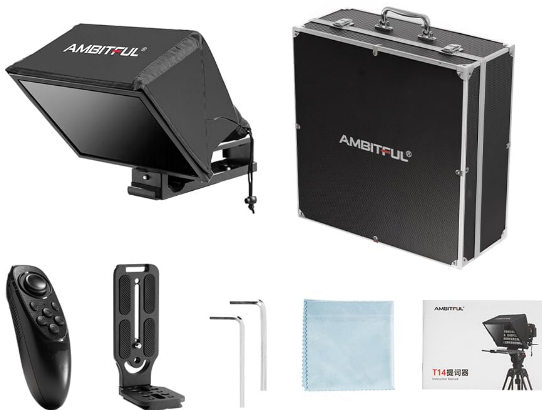
Image 2.1: Visual representation of all items included in the product package.