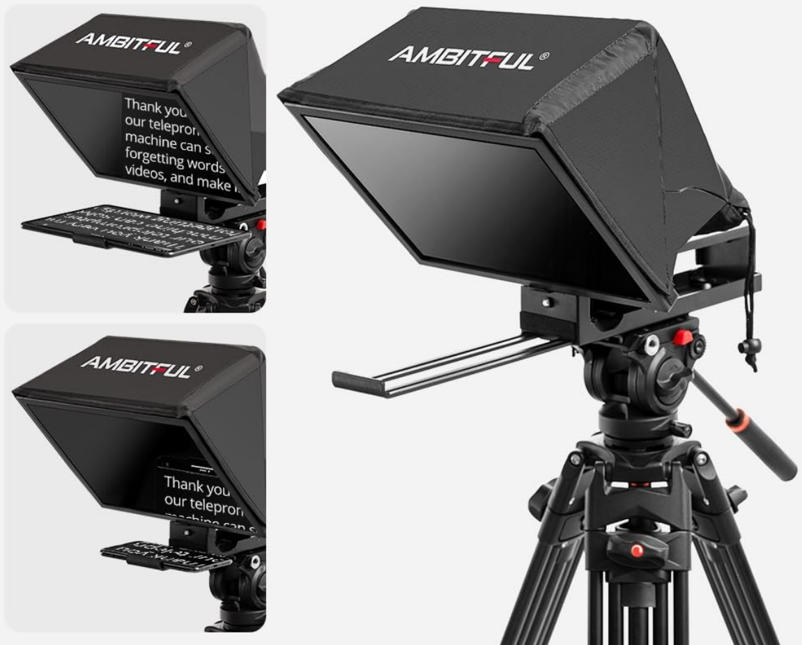
Image 3.2: The adjustable splints accommodate various mobile devices.

The adjustable range of the teleprompter clipboard is about 21.5cm or less, and supports mobile phones or tablet teleprompters up to 12.9" (tablet teleprompters are recommended for better results).