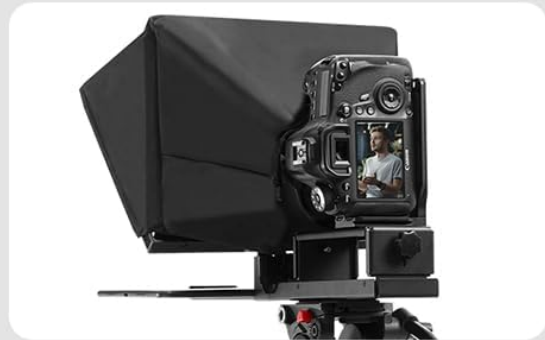
Image 3.3: The teleprompter supports both vertical and horizontal camera orientations.