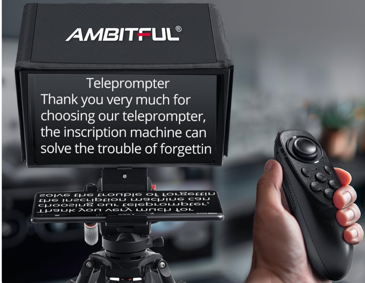
Image 4.2: The included remote control facilitates app-based script management.

The teleprompter supporting the application of mobile phone APP teleprompter software, Bluetooth remote control APP pause, adjustment, font and background colour switching and other operations.