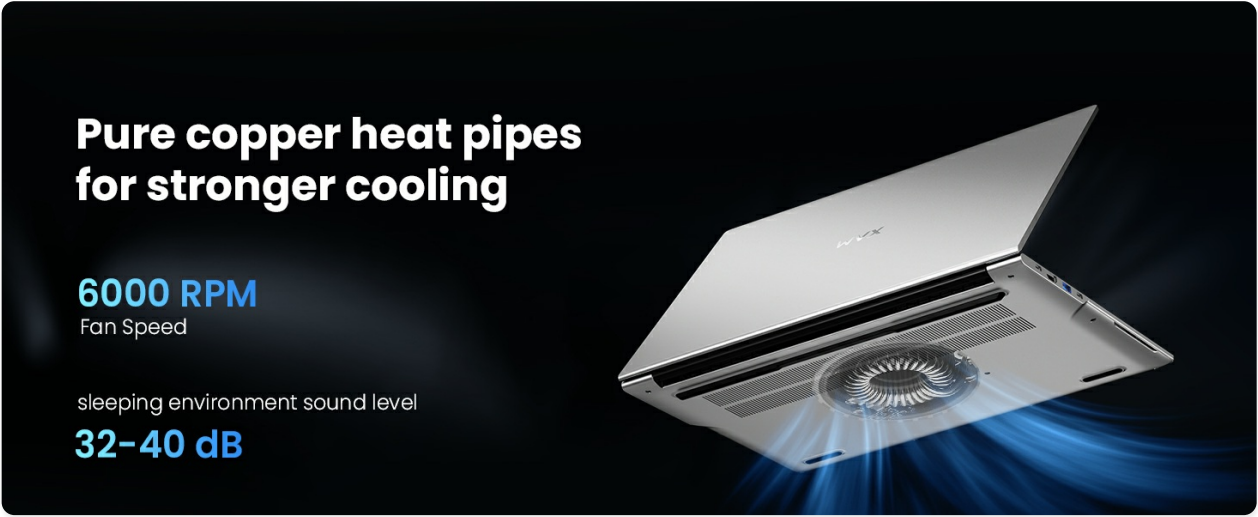
Image 5.1: Illustration of the laptop's cooling system with pure copper heat pipes and fan speed.