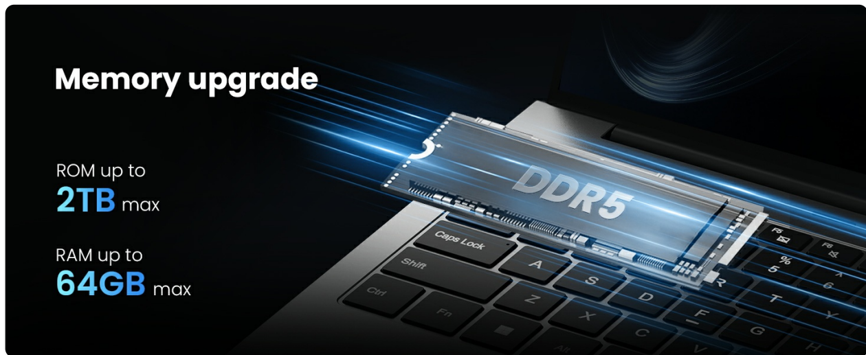
Image 4.1: Illustration of memory and storage upgrade capabilities.

The laptop's RAM can be upgraded to a maximum of 64GB, and the SSD storage can be expanded up to 2TB. Consult a qualified technician for hardware upgrades to avoid voiding your warranty.