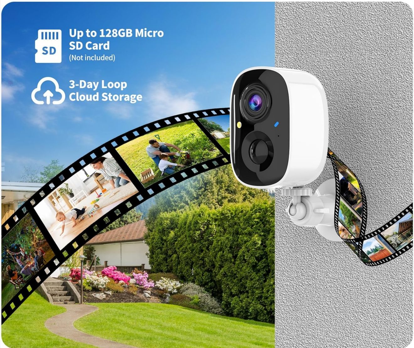
Image: Diagram showing the available storage options: local storage via Micro SD card (up to 128GB) and free 3-day loop cloud storage.