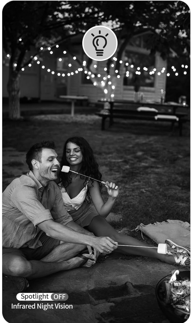
Image: A comparison demonstrating the clarity of color night vision with the spotlight on versus traditional infrared night vision.