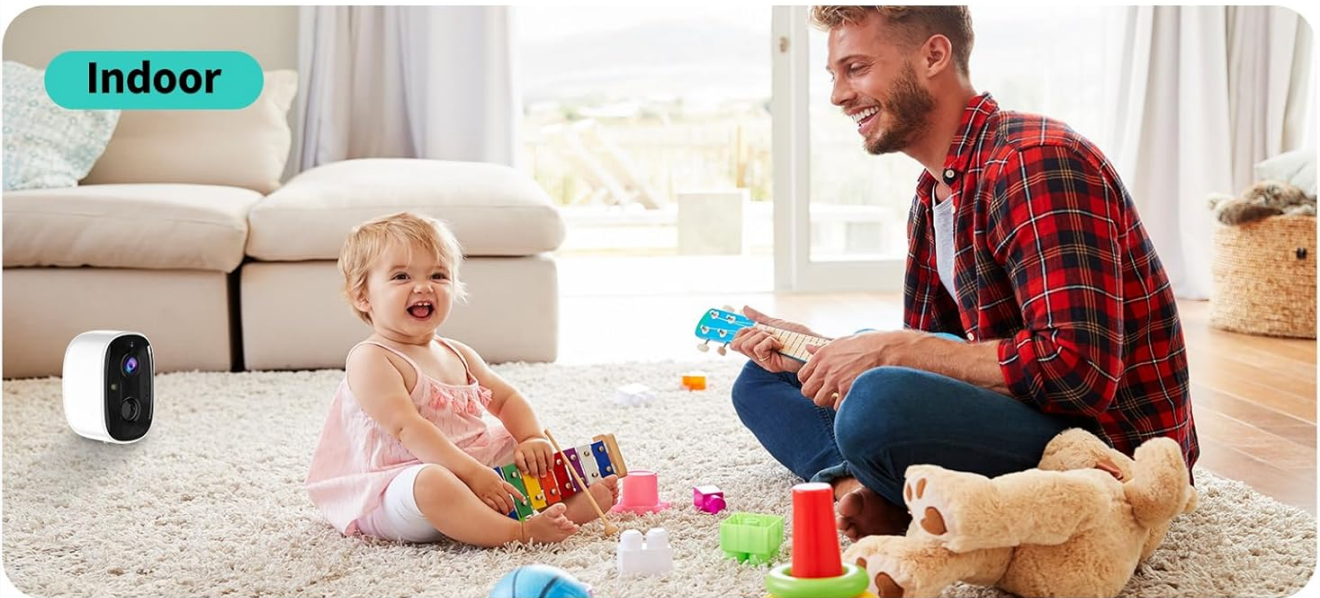
Image: Examples of camera placement both outdoors and indoors, showcasing its versatility for various monitoring needs.