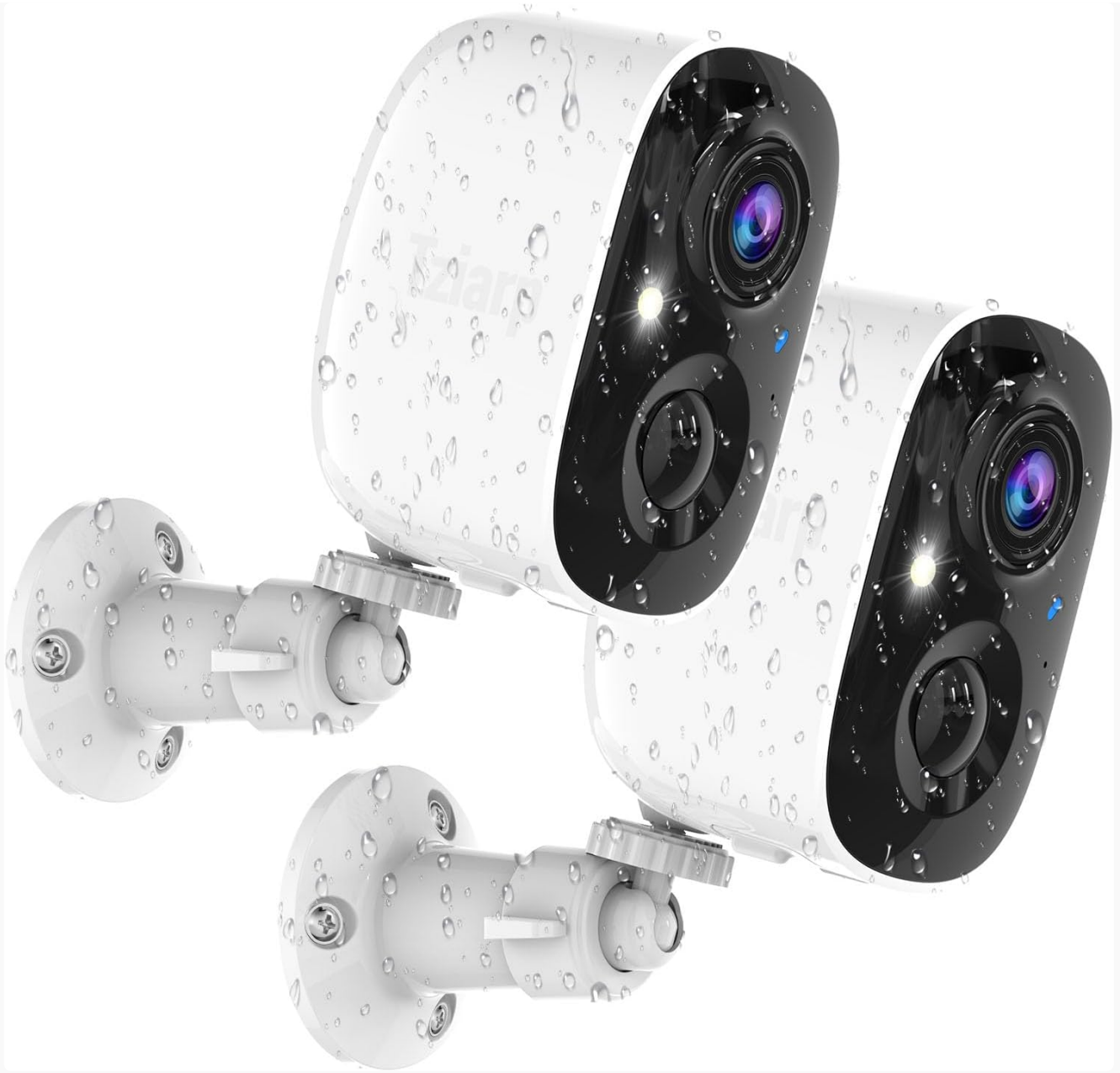
Image: Two Tziarp 2K wireless security cameras with water droplets, highlighting their IP65 weatherproof design for outdoor use.