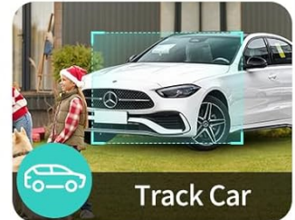
Image: Illustrates the Smart AI Detection feature, capable of tracking various subjects like people, pets, vehicles, and packages.