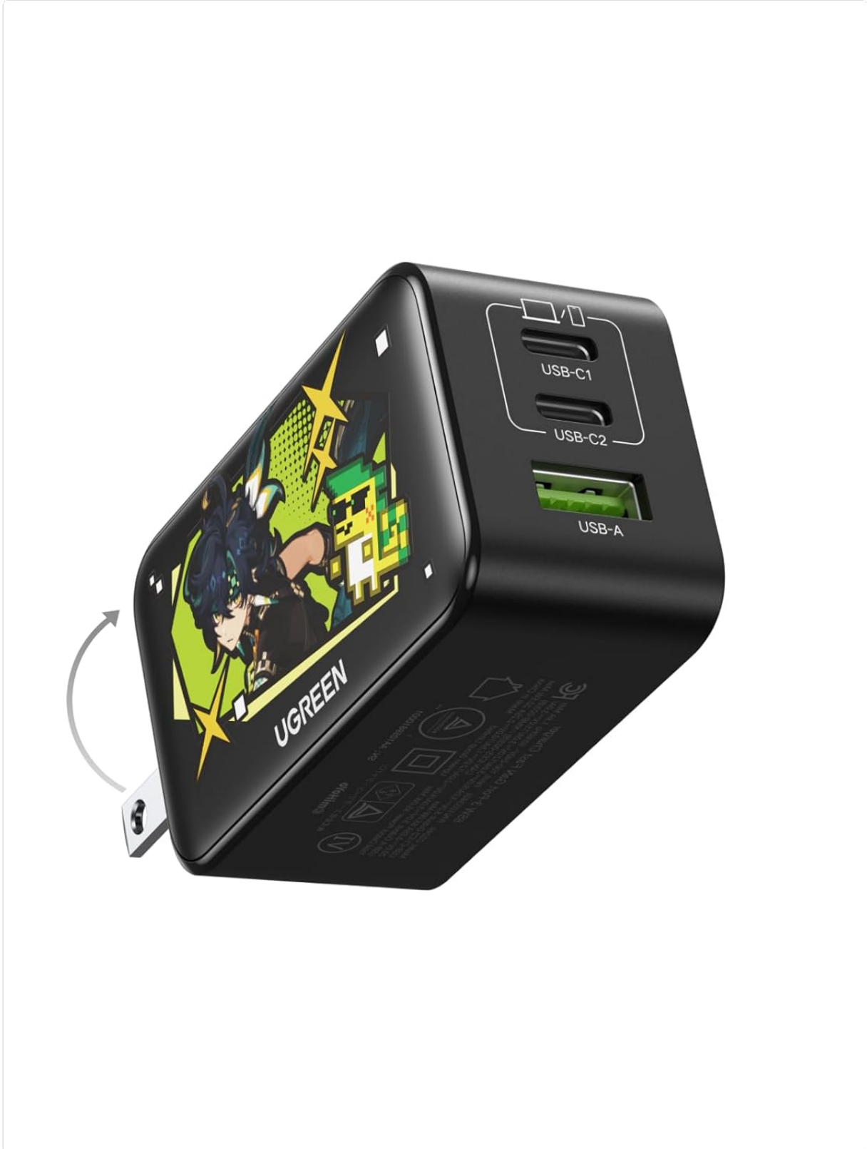
Image: Front view of the UGREEN 65W USB C Charger, showing its USB-C1, USB-C2, and USB-A ports.