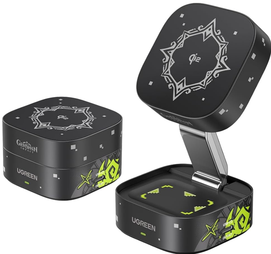
Image: The UGREEN Qi2 Wireless Charger in its upright stand configuration, showing the magnetic charging surface.