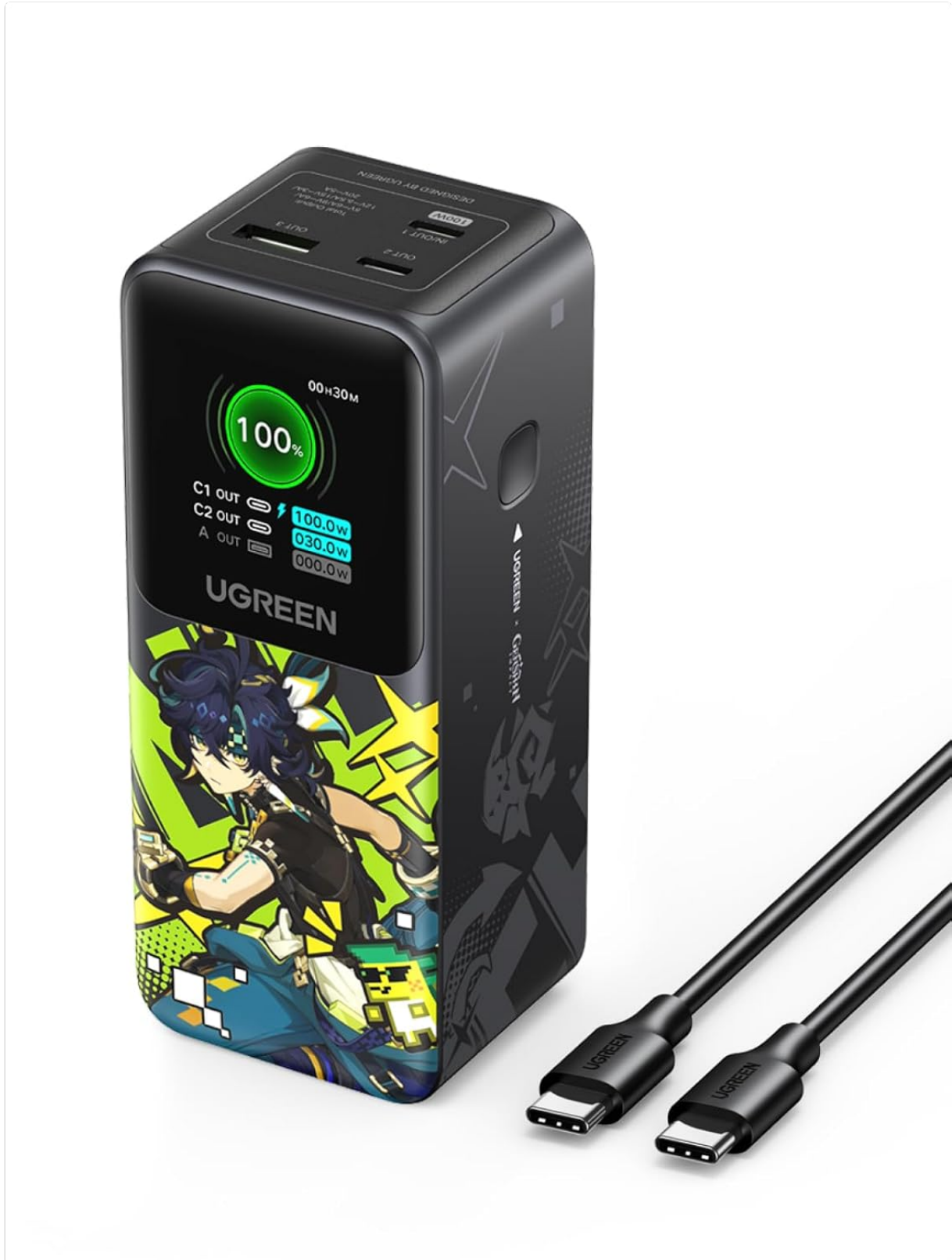
Image: Close-up of the UGREEN 20000mAh Power Bank, displaying its digital screen and charging ports.