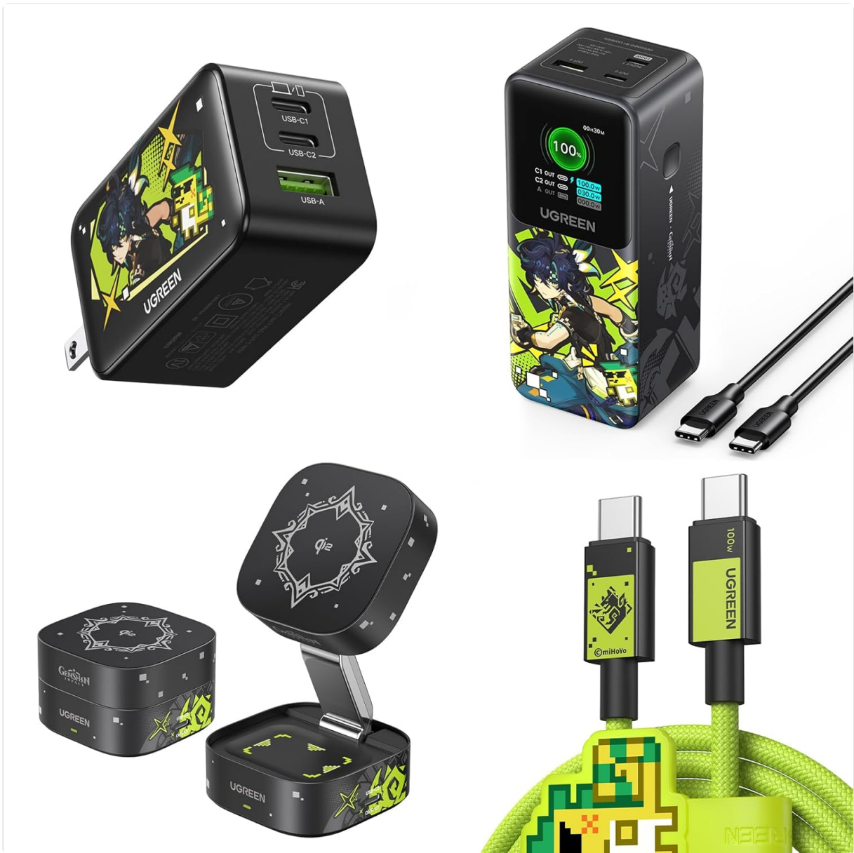
Image: The complete UGREEN Genshin Impact charging bundle, showcasing the 65W charger, 100W cable, 20000mAh power bank, and Qi2 wireless charger, all adorned with Genshin Impact themed artwork.