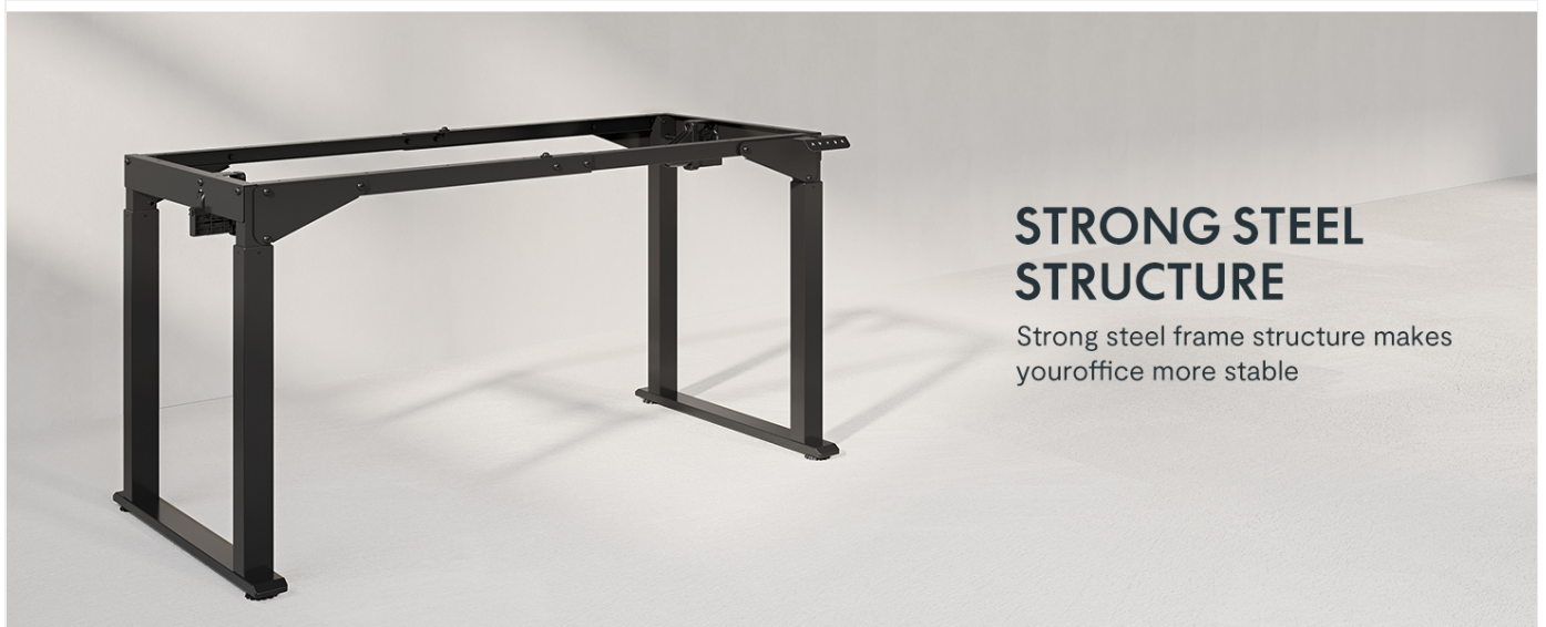
Image: The robust 4-leg frame of the SANODESK standing desk, providing enhanced stability.