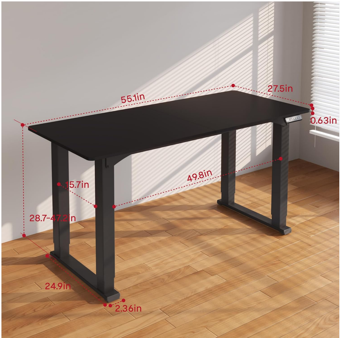
Image: Detailed dimensions of the 55x28 inch SANODESK standing desk.