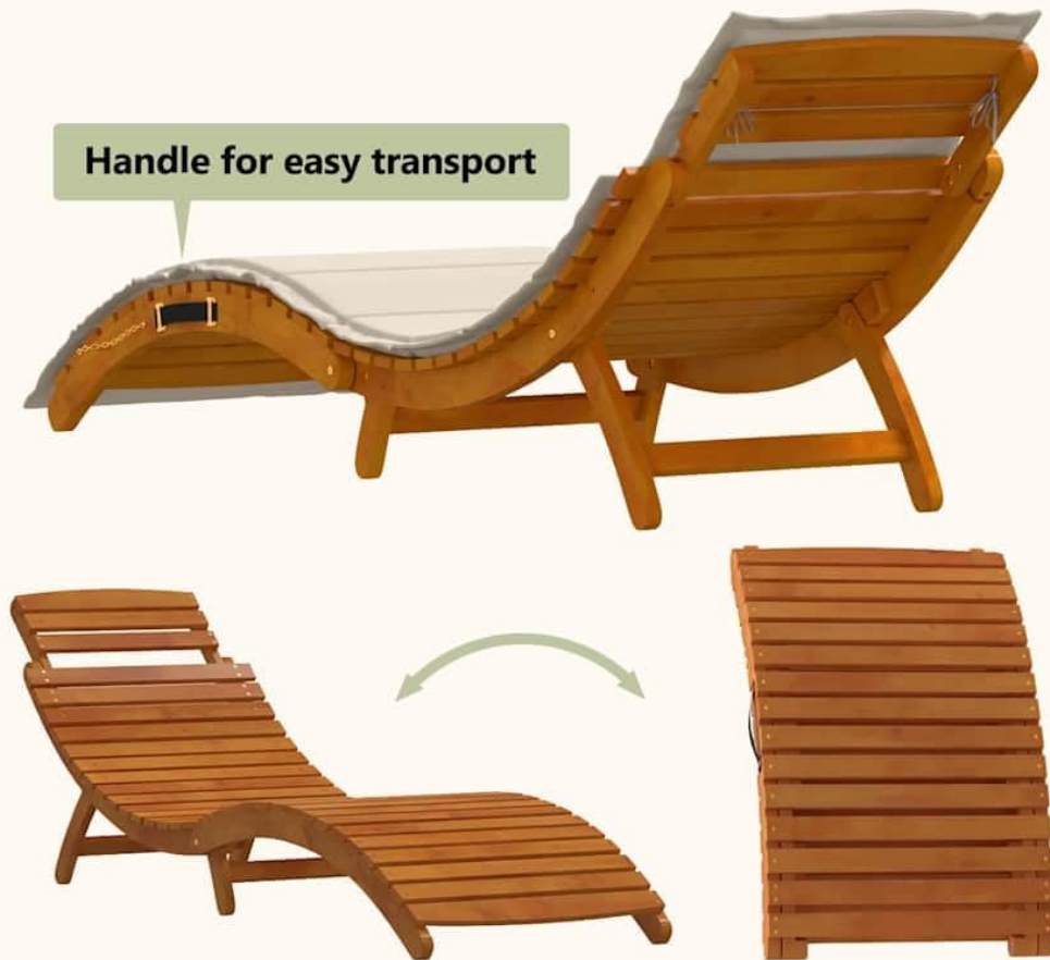
Image: A visual guide demonstrating the foldable design of the sun lounger for convenient storage and transport.

Ideal for garden, patio, poolside, balcony