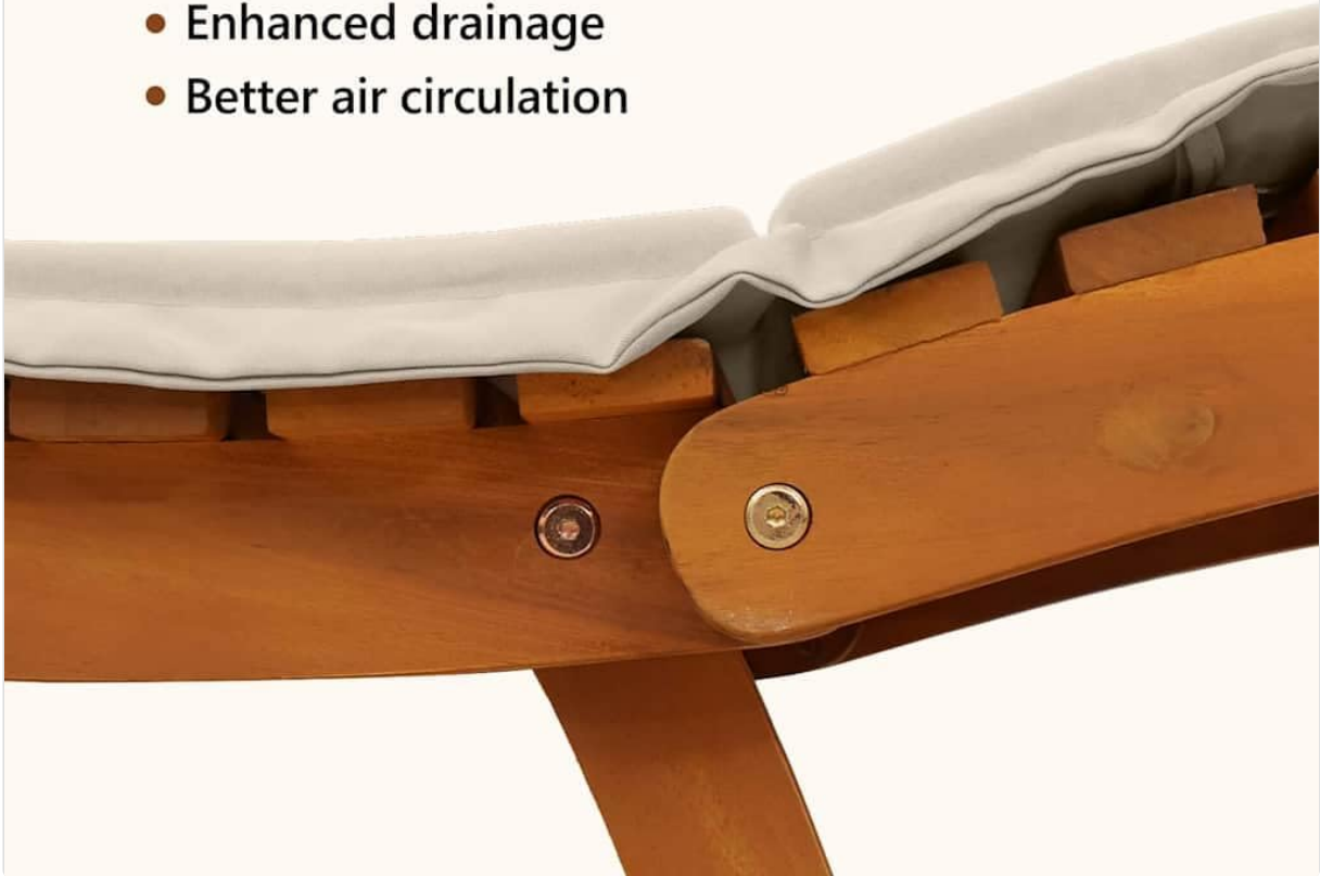
Image: A close-up of the sun lounger's adjustable backrest mechanism, demonstrating how to change reclining positions.