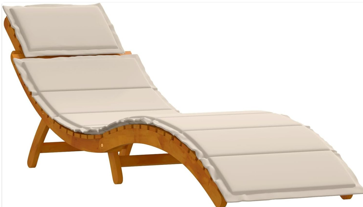
Image: A fully assembled vidaXL sun lounger with cushions, illustrating the final product after assembly.