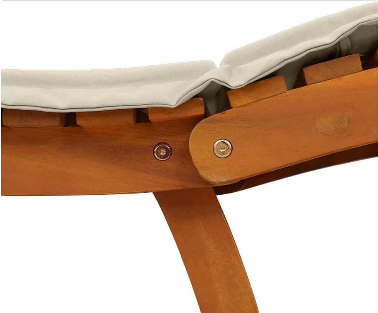
Image: A vidaXL acacia wood sun lounger with cream cushions, showing the main components when assembled.