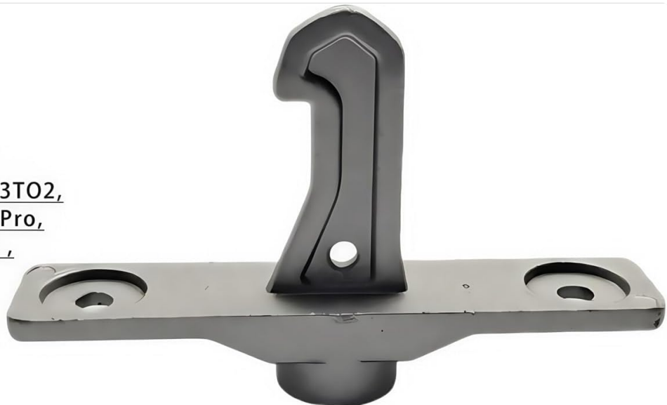
Image 2: Visual representation of compatible Midea dishwasher models.

H3602D, H1, V3, MK68DW, S50, Vie5, UX Magic, CDS13TO2, 3602 Plus, Vie6 Pro, Vie7 Pro, E7 Pro , XH09, XLO3, XH09P, XH06P, XHO5S, XH05P