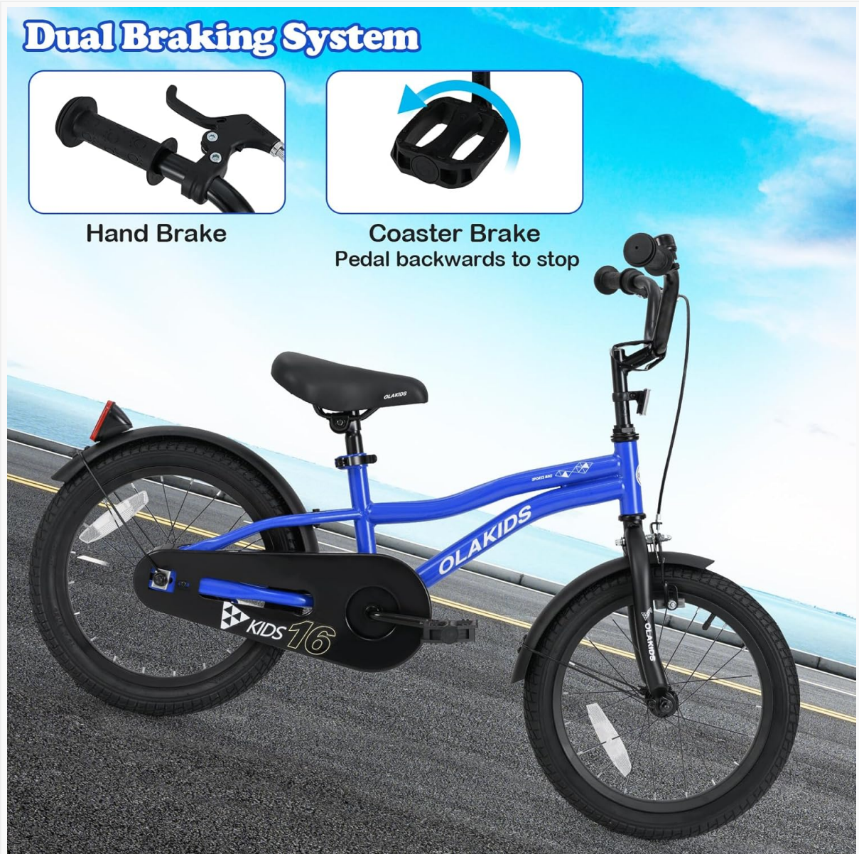
Image: Close-up of the dual braking system, showing both the handbrake lever and the coaster brake pedal mechanism.