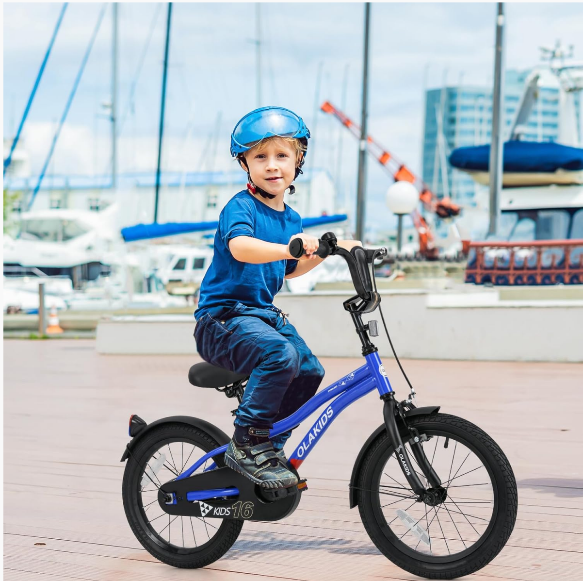
Image: A child riding the Olakids Kids Bike, demonstrating the adjustable seat and handlebar for different growth stages.