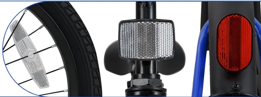
Image: Detailed view of the bike's design features, including easy-grip handles with a bell, a wide soft padded seat, and three different reflectors for visibility.