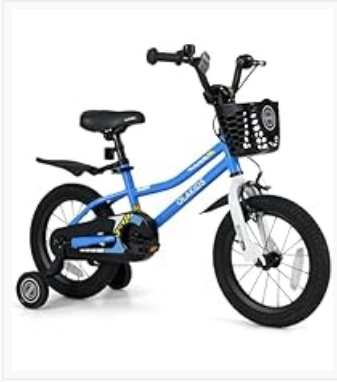
Image: Overview of bike components including adjustable seat, handlebar, handbrake, coaster brake, enclosed chain guard, and detachable training wheels.