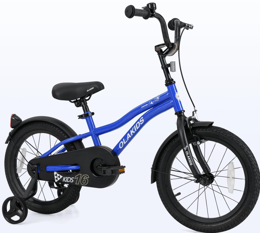
Image: The Olakids Kids Bike shown in its 85% pre-assembled state, ready for final quick assembly.