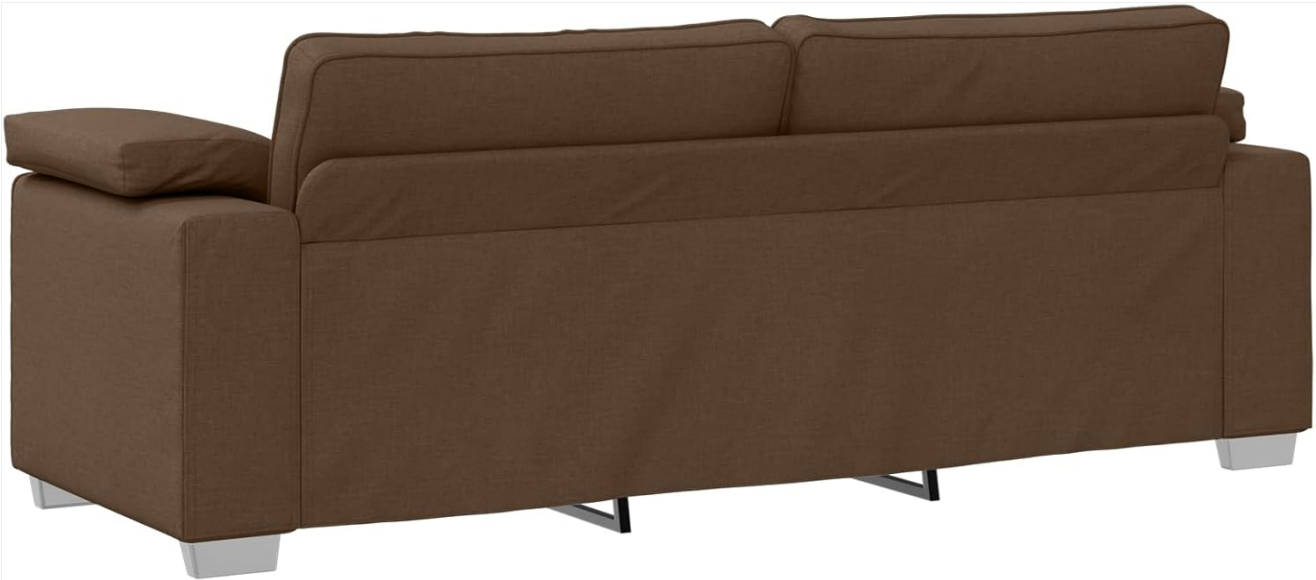
Figure 2.3: Rear view of the sofa, showing the backrest and structural support.