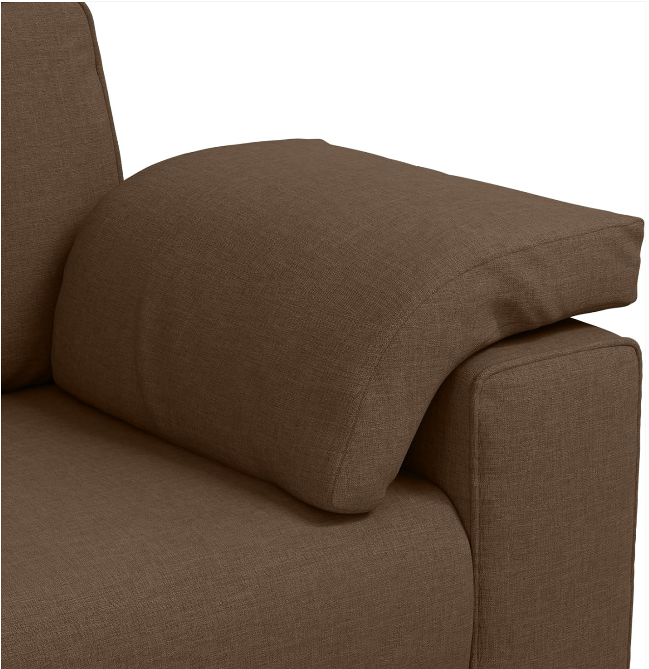
Figure 2.5: Detailed view of the sofa's armrest, showing the cushion design.