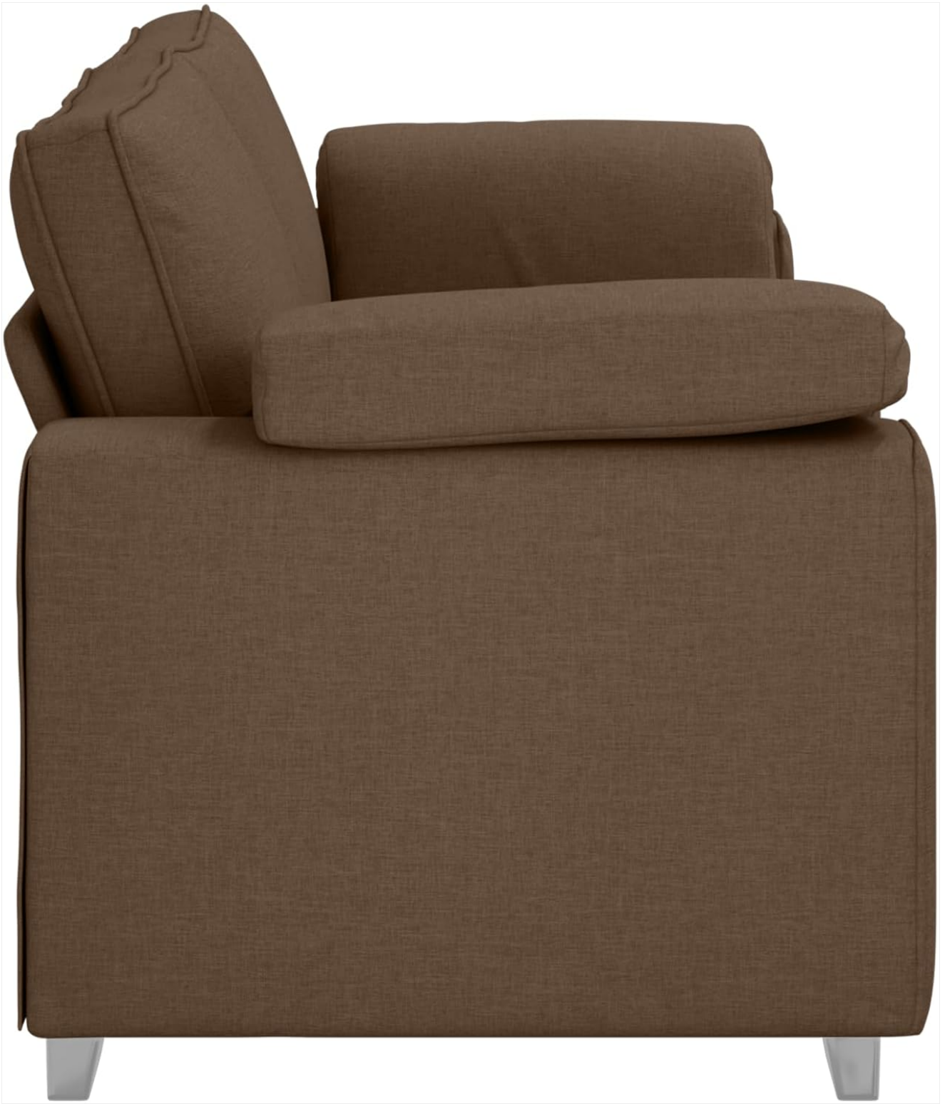
Figure 2.4: Side profile of the sofa, highlighting the armrest design and leg height.