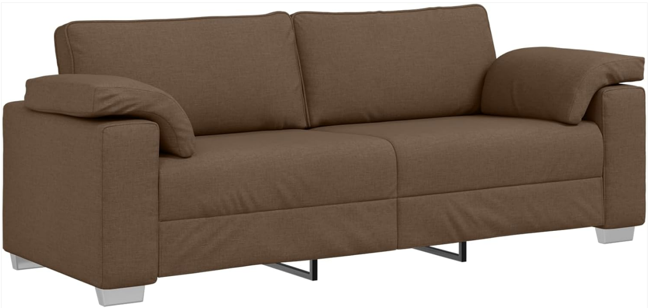
Figure 2.1: Front view of the vidaXL brown 3-seater sofa, showcasing its rectangular shape and Textilene fabric.