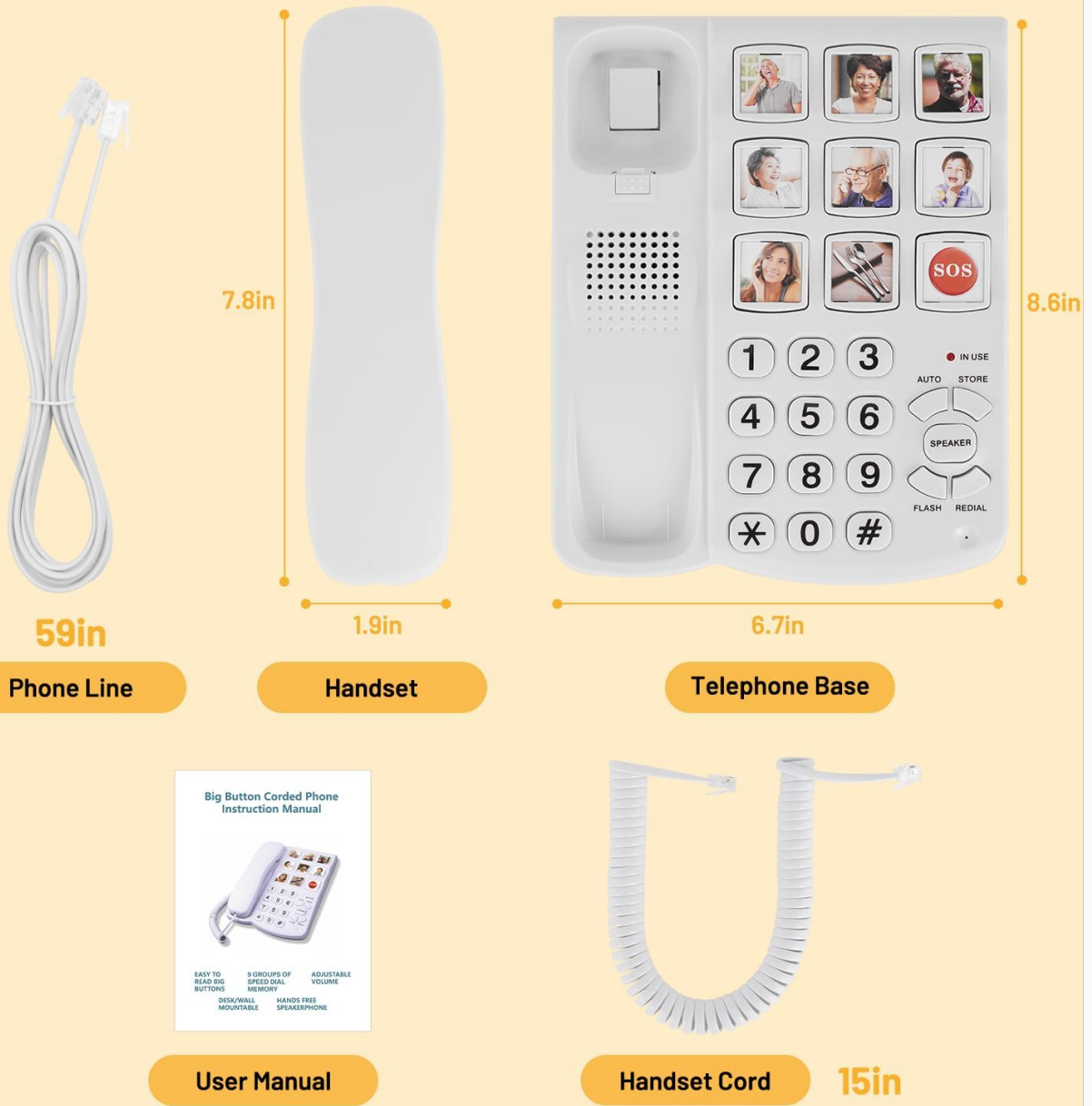
Figure 4: Dimensions of the phone components, including the phone line (59in), handset (7.8in length, 1.9in width), telephone base (8.6in length, 6.7in width), and handset cord (15in).