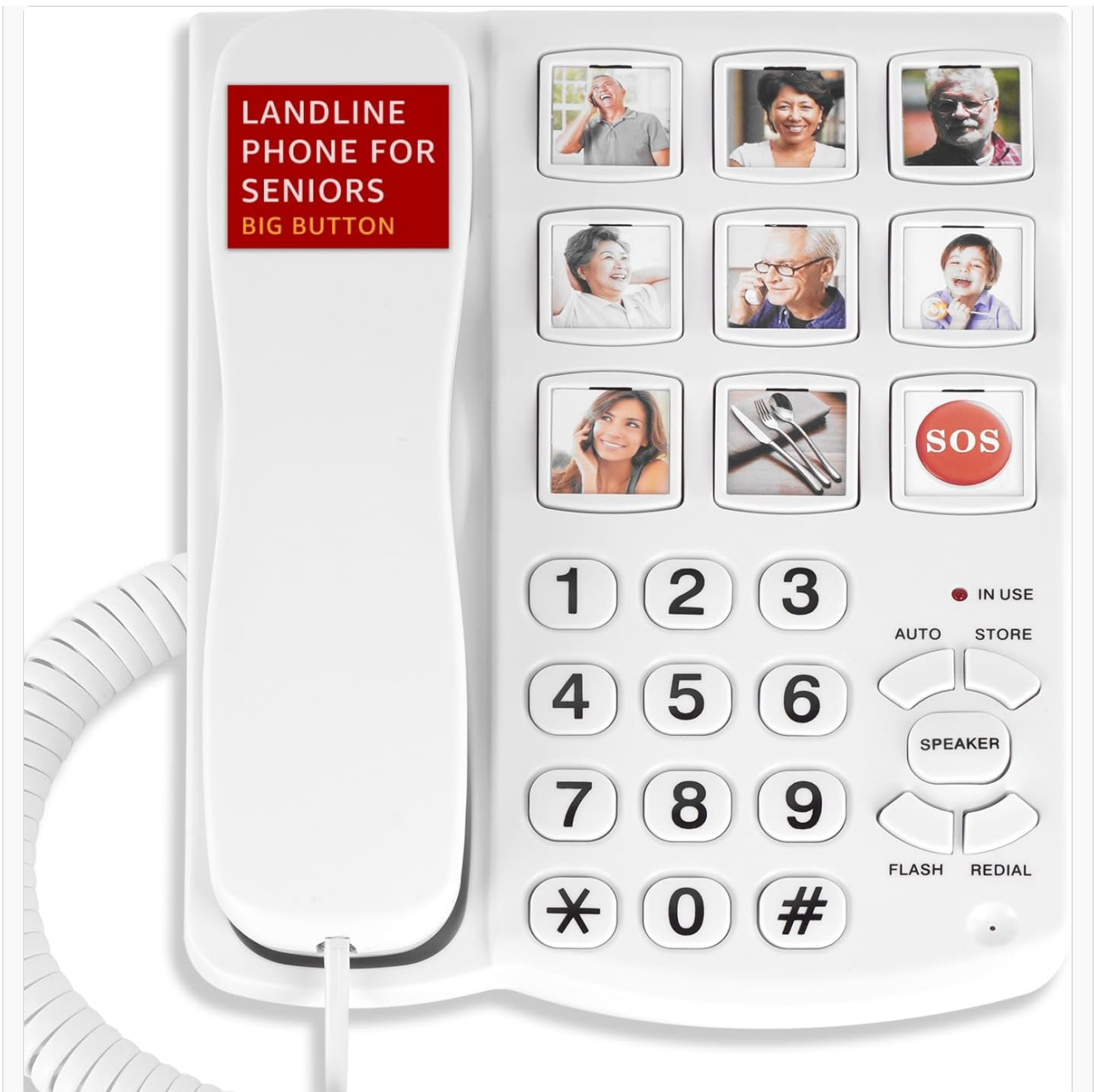
Figure 1: Front view of the Uvital LD-858 Big Button Corded Landline Phone, showing the large keypad, one-touch dialing buttons, and handset.