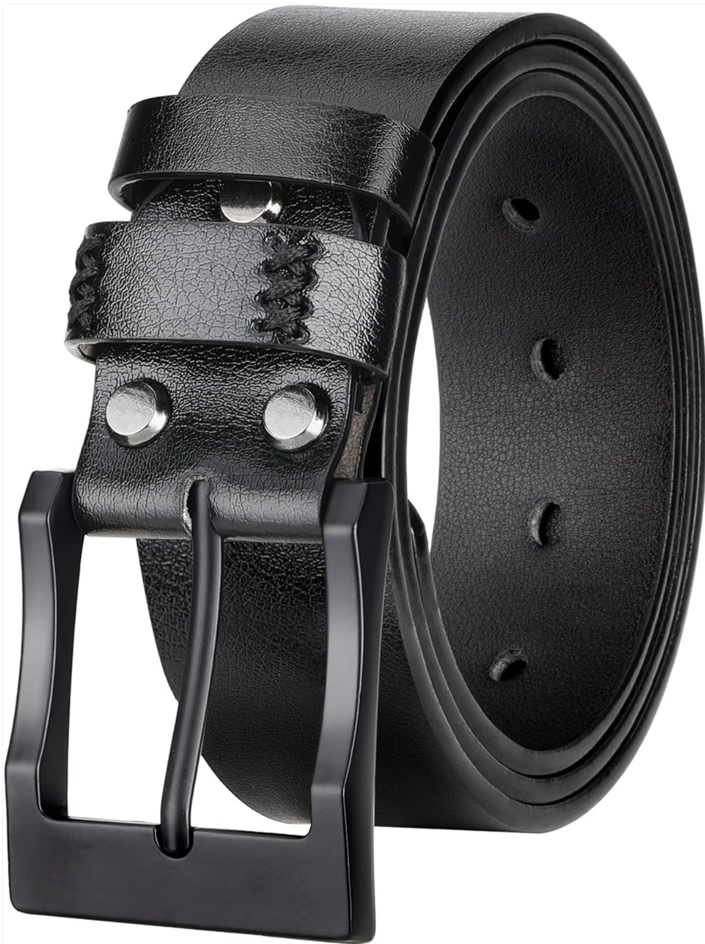
Image: The EsengNoyi Men's Black PU Leather Belt, featuring a black strap and a matching black alloy buckle.

The EsengNoyi Men's Black PU Leather Belt is designed for versatility, suitable for both casual and office wear. Key features include: