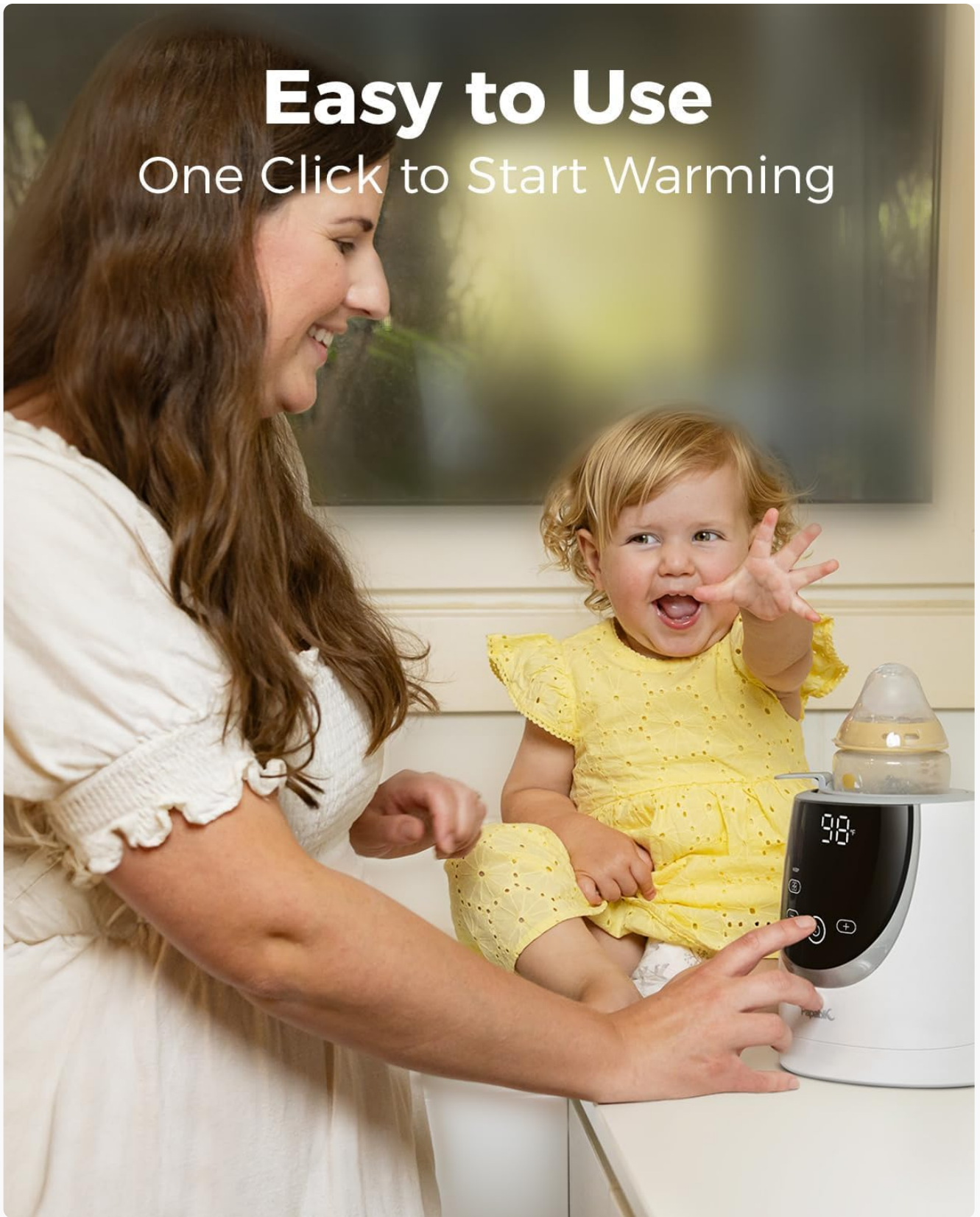
Image: The bottle warmer in use, demonstrating its user-friendly design.