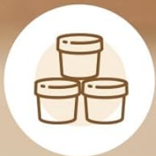
Baby Food Jars