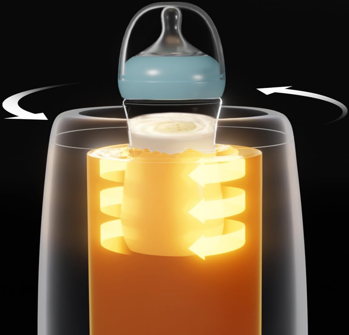
Image: Visual representation of the swirling mechanism within the Papablic NutriWarm Bottle Warmer.

The New Standard in Nutrient-Preserving Warming