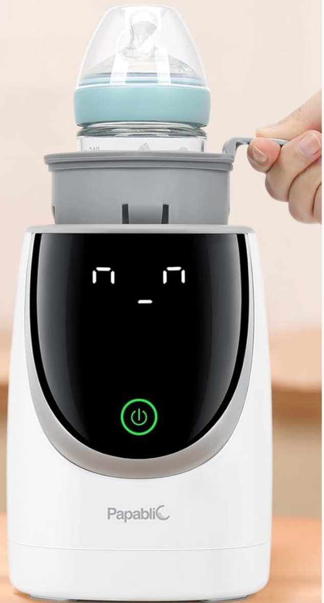
Image: The bottle warmer demonstrating compatibility with various bottle types and baby food jars.