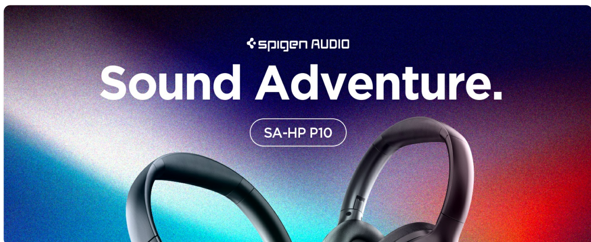
Image: The Spigen SA-HP P10 headphones with visual cues indicating 43dB Active Noise Cancelling, 5-Mode Hybrid Adaptive ANC, Transparency Mode, and Clear Calls with 5 MICs.