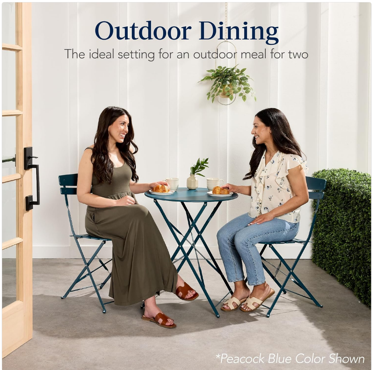
Image: The 3-piece bistro set in use on a patio, demonstrating its suitability for outdoor dining.