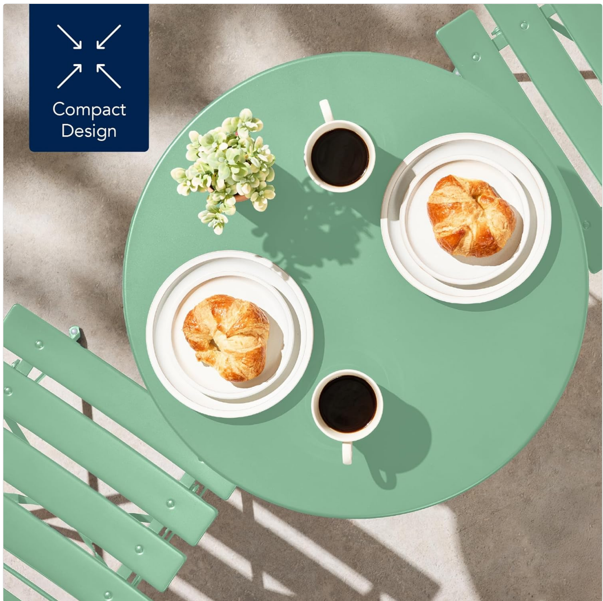
Image: An overhead view of the bistro table with coffee and pastries, emphasizing its compact and functional design.