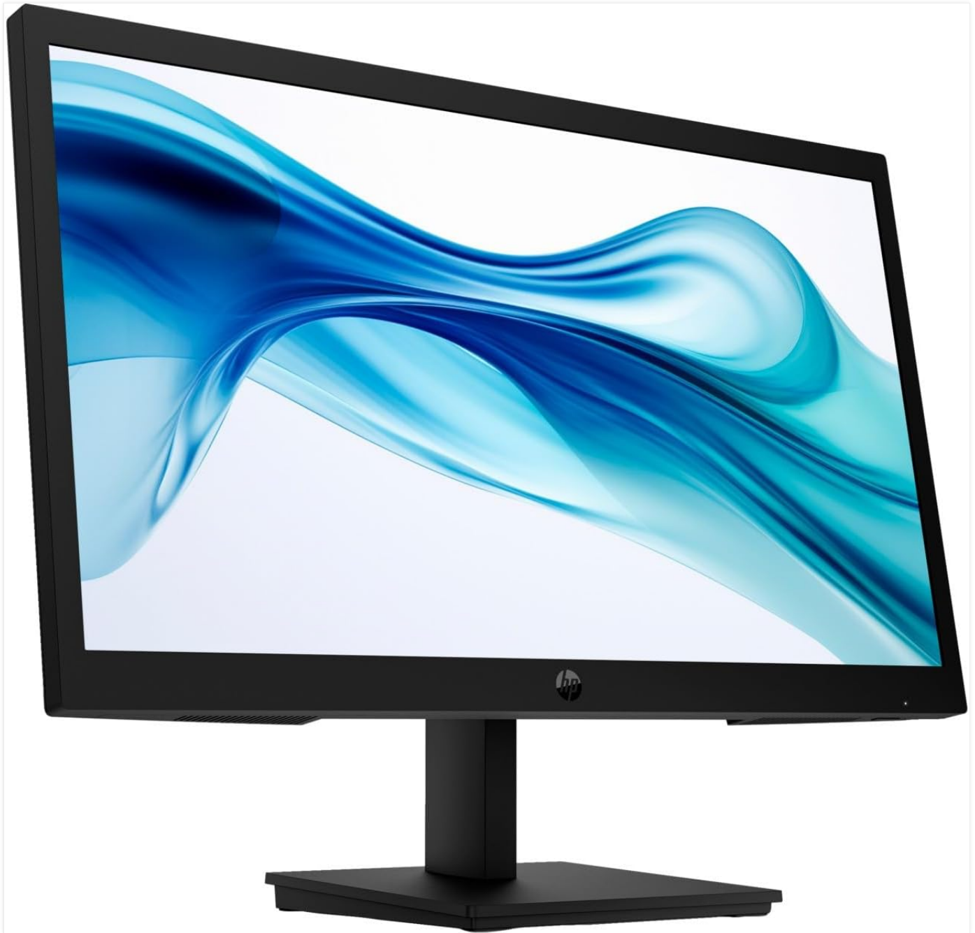
Figure 1: Front view of the HP 22 inch Series 3 Pro 322pv FHD Monitor with its attached stand. The screen displays a dynamic blue and white wave pattern.

Alternatively, the monitor supports VESA mount (100x100mm) for wall or arm mounting. Ensure the VESA mount is compatible and securely installed.