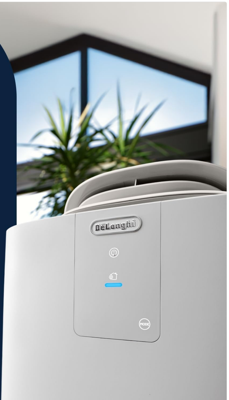
Figure 4: The intuitive remote control and the clear front-facing display of the unit, allowing for easy adjustment of settings from a distance. The remote control allows you to adjust temperature, mode, and fan speed conveniently from across the room. The front-facing display on the unit provides real-time feedback on current settings.

*Internal test, initial condition 30° C and 40%RH