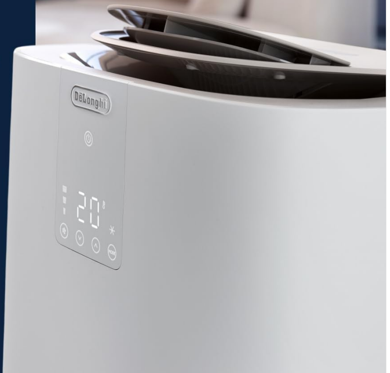
Figure 7: The De'Longhi Pinguino AP98 operating in a living space, demonstrating its quiet mode for peaceful operation.

Adjust temperature, mode and fan speed from across the room. The front-facing display makes it easy to see your settings while you protect your spot on the sofa.