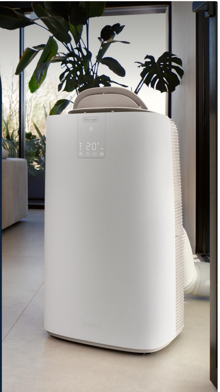
Figure 6: The unit's display highlighting the EcoRealFeel function, which optimizes comfort by balancing temperature and humidity.

*Tested in our laboratory by comparing the maximum sound level using max. fan speed vs. sound level at min. fan speed