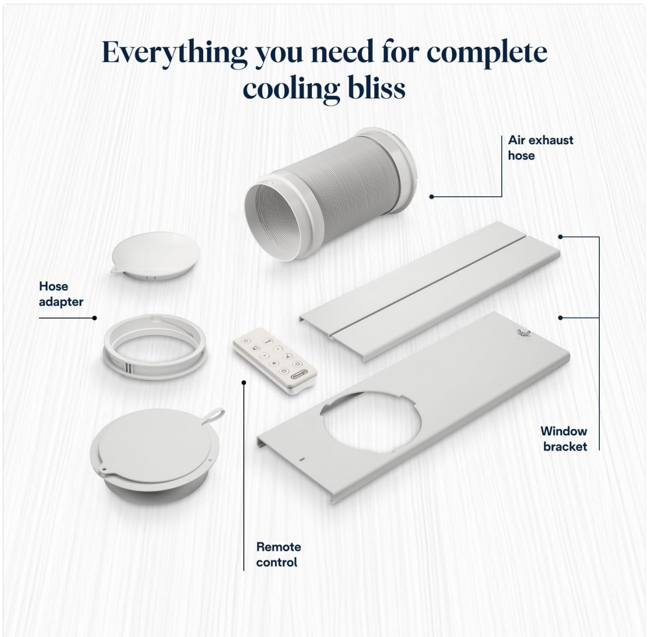
Figure 2: All components included with the De'Longhi Pinguino AP98, including the air exhaust hose, hose adapter, remote control,