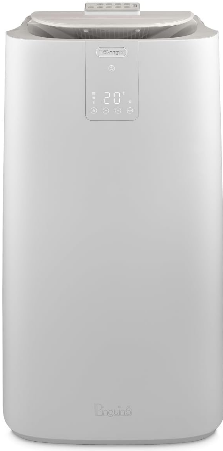
Figure 1: Front view of the De'Longhi Pinguino AP98 Portable Air Conditioning Unit, showcasing its sleek design and digital display.