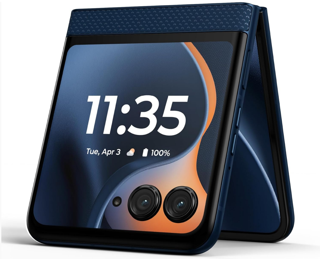
Figure 7: The external display of the Motorola Razr 2025 showcasing moto ai features for enhanced user interaction.