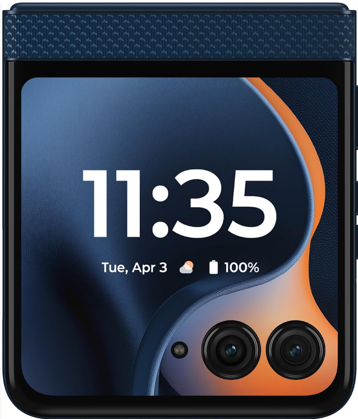
Figure 2: Motorola Razr 2025 folded, displaying the external screen and camera module.