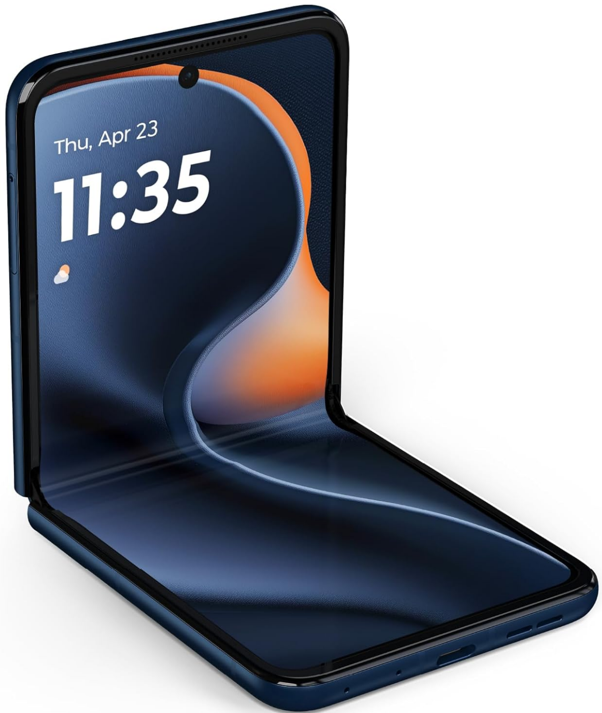
Figure 3: The Motorola Razr 2025 in its folded state, showing various applications accessible on the external display.