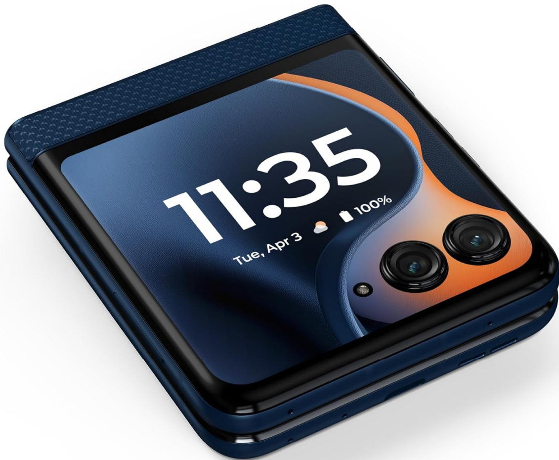
Figure 5: The Motorola Razr 2025 partially folded, demonstrating its flexible display and hinge mechanism.