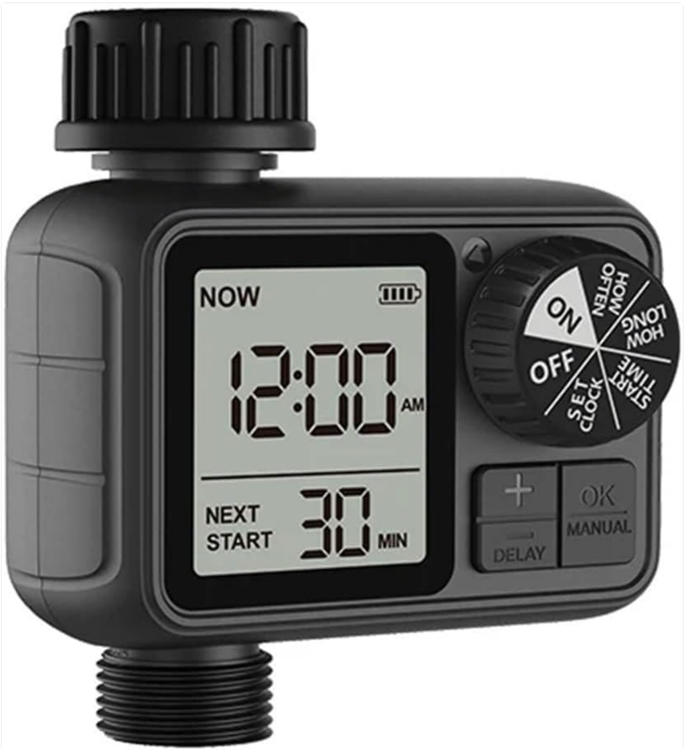
Image: Front view of the SanmeiLi Smart Water Timer M02, showing the digital display with "NOW 12:00 AM" and "NEXT START 30 MIN", along with the control dial and buttons.