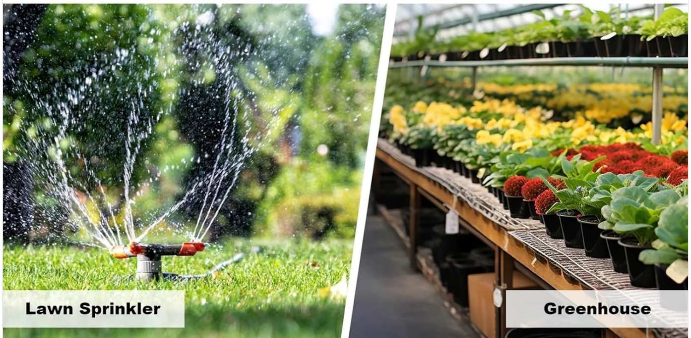
Image: A collage showing various applications of the water timer, including garden watering with a hose, drip irrigation, lawn sprinkler use, and greenhouse watering.