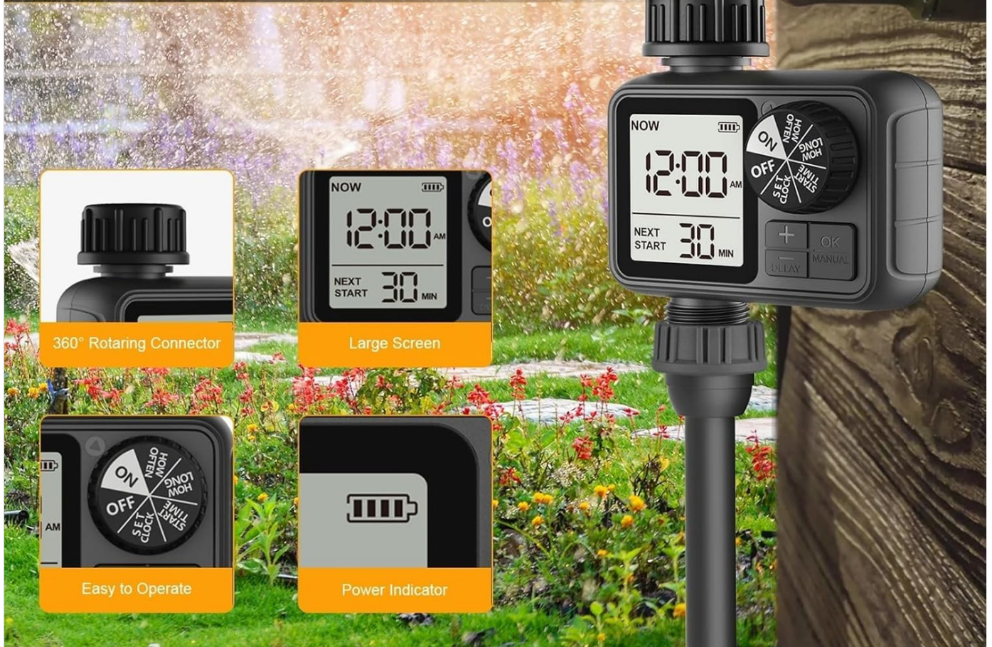
Image: The SanmeiLi Smart Water Timer M02 connected to a hose and a sprinkler, actively watering a lawn, demonstrating its outdoor application.