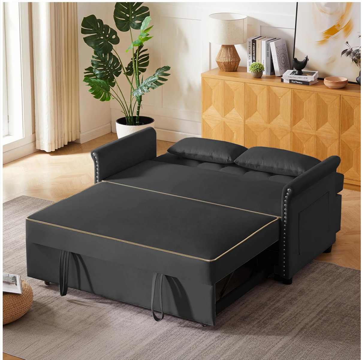
Figure 4: Sofa partially converted. This image demonstrates the sofa in a chaise lounge configuration, ideal for relaxing.

Your browser does not support the video tag.