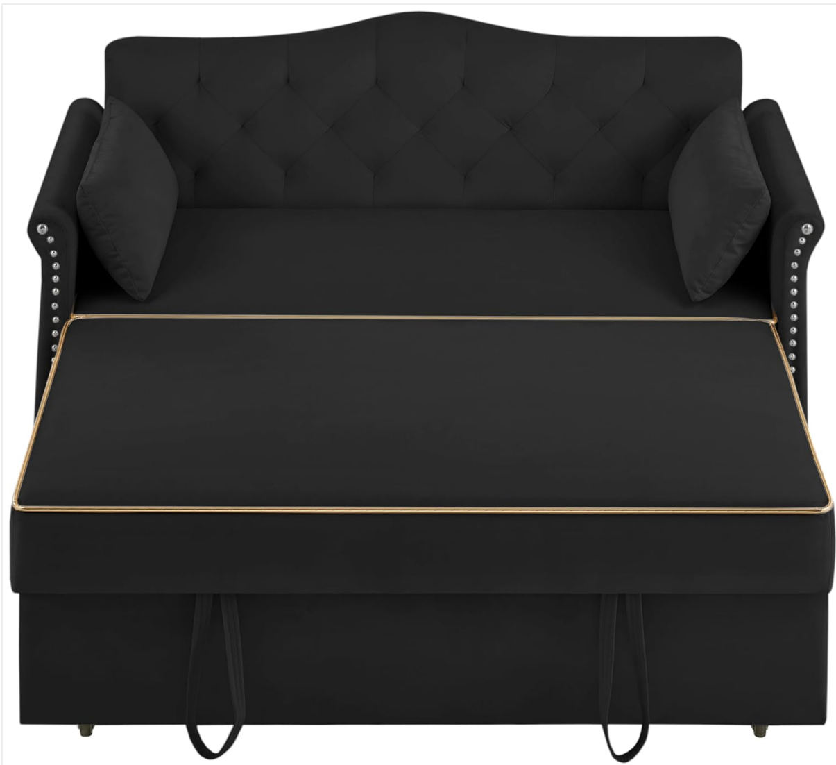
Figure 2: Sofa converted to bed, front view. This image shows the sofa fully extended into a sleeping surface.