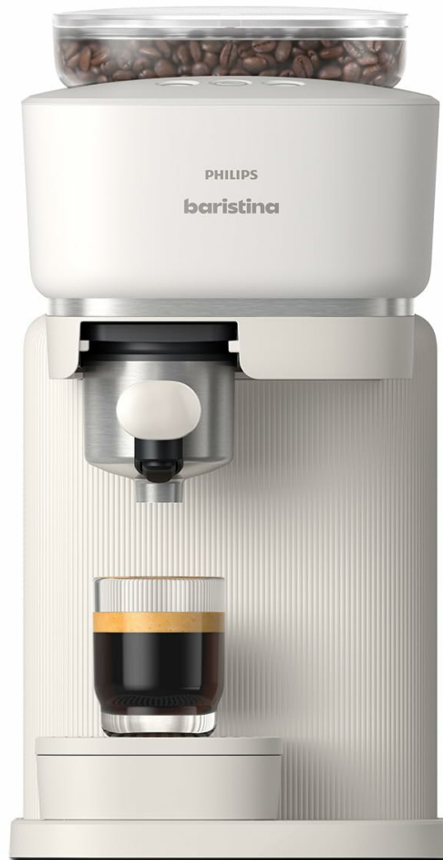
Figure 1: Philips Baristina Espresso Machine (BAR300/00)