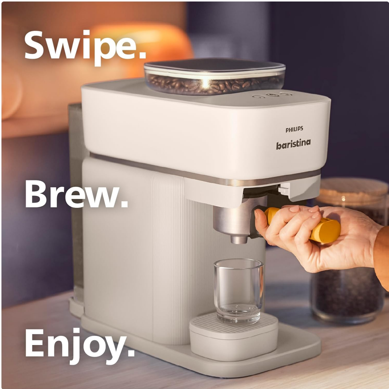
Figure 6: Swipe the handle to brew and enjoy.

Your browser does not support the video tag.