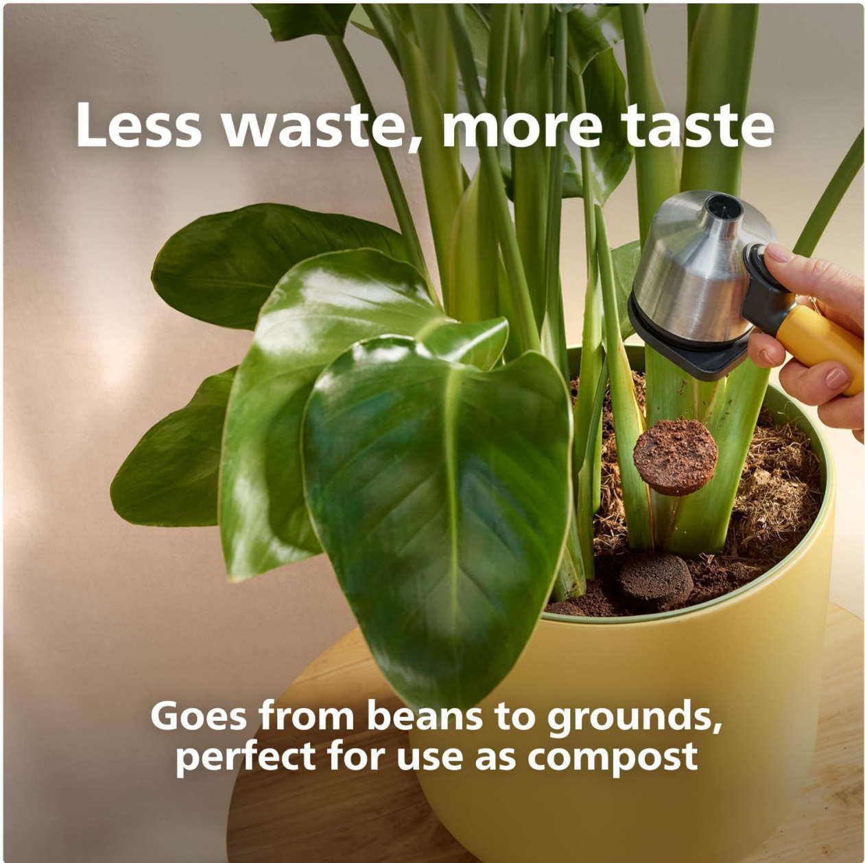
Figure 8: Used coffee grounds can be composted, reducing waste.